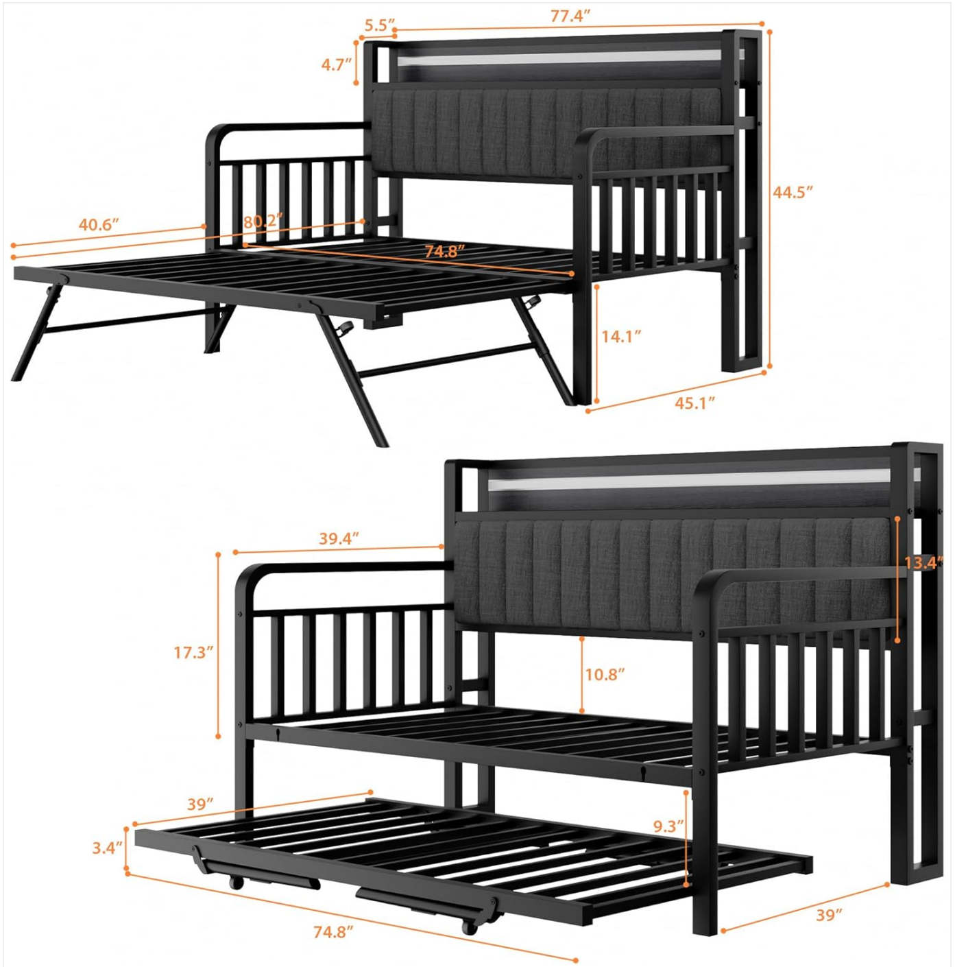
Figure 2: Detailed dimensions of the daybed and trundle unit, showing overall length, width, and height measurements.