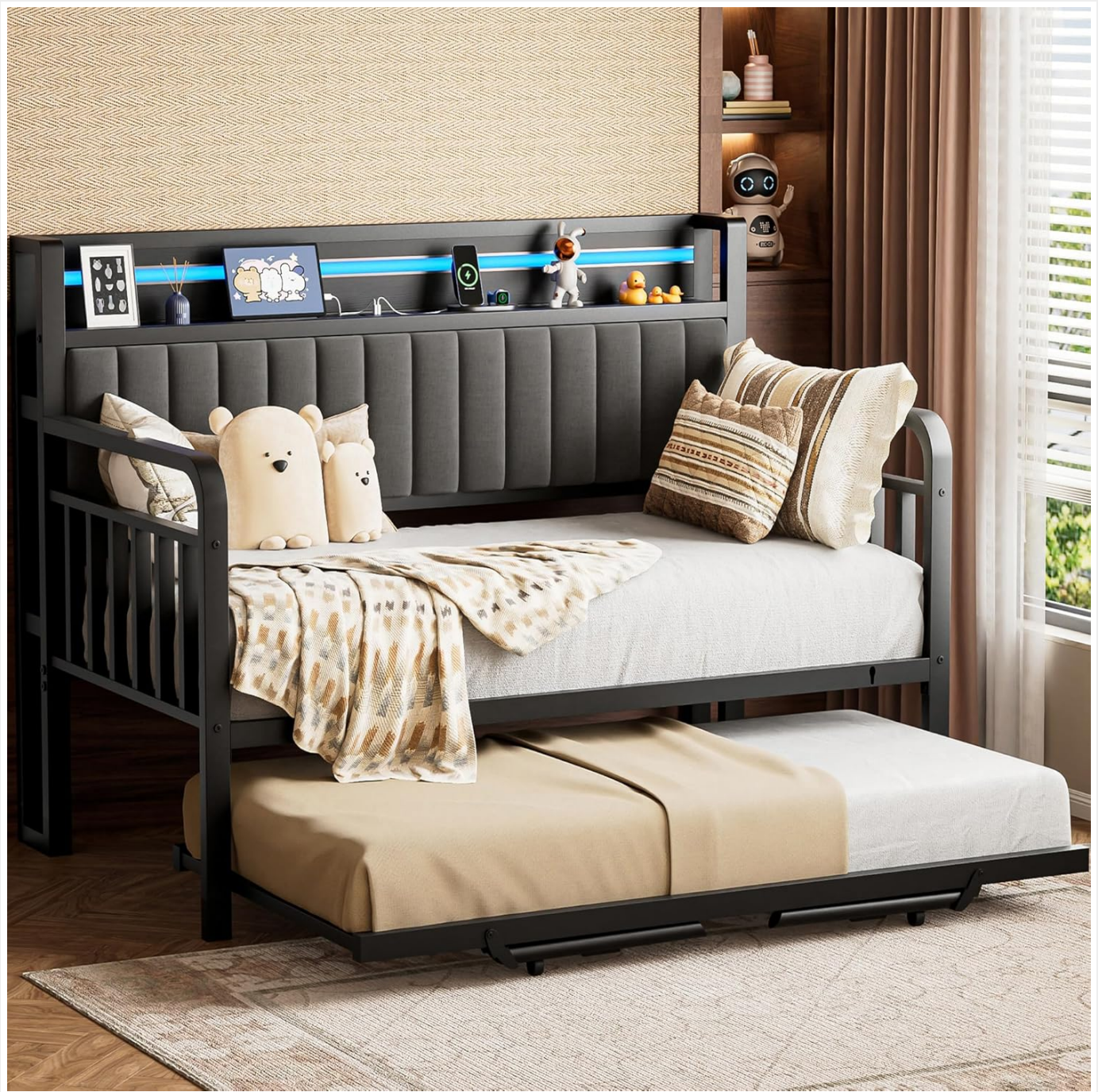
Figure 1: Jocoevol Daybed with Trundle and LED Lights, showcasing the main unit with the trundle bed extended, upholstered headboard, and illuminated LED strip.