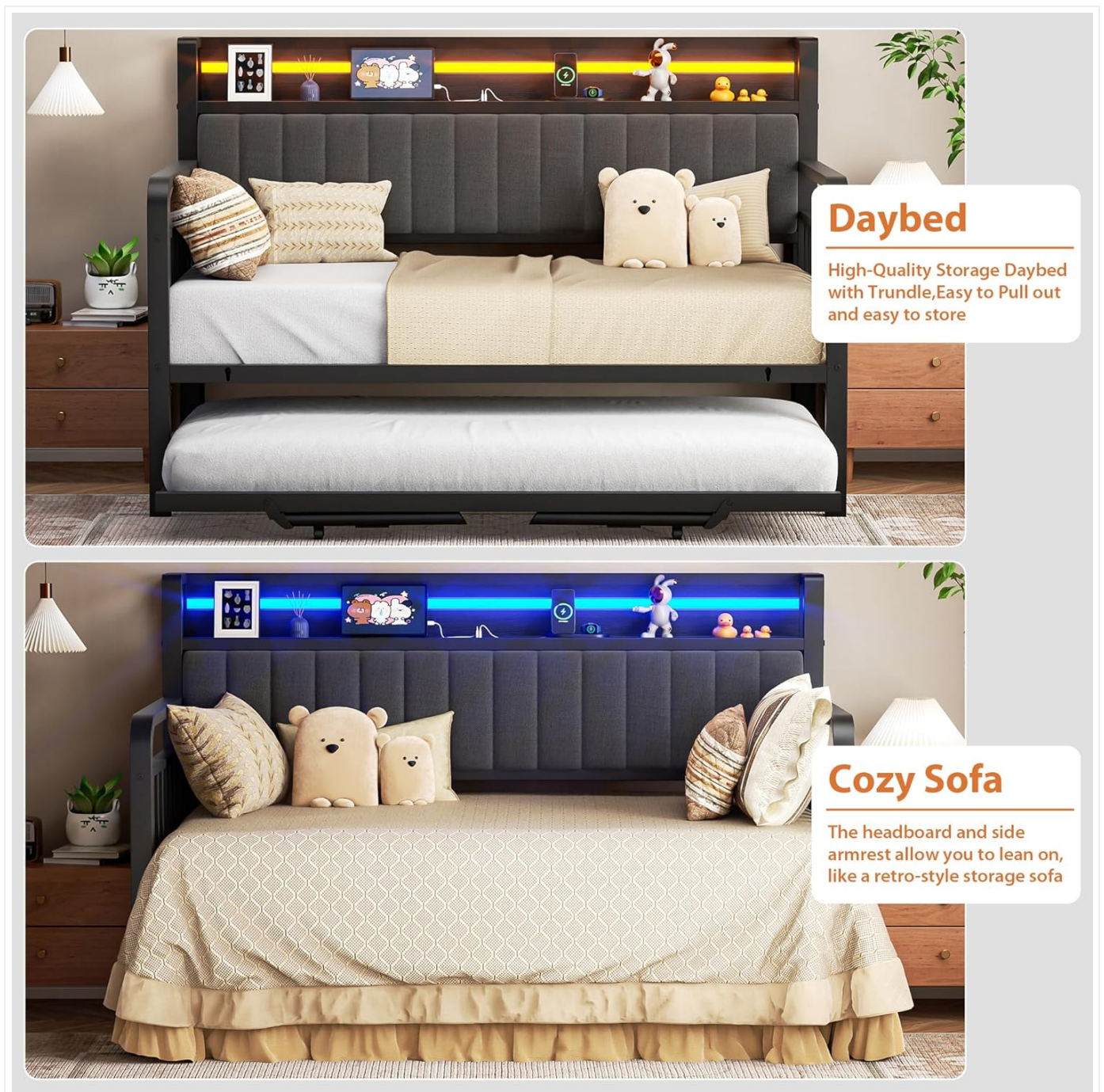
Figure 5: Illustration showing the daybed's dual functionality as a traditional daybed with trundle and as a cozy sofa when the trundle is stored.