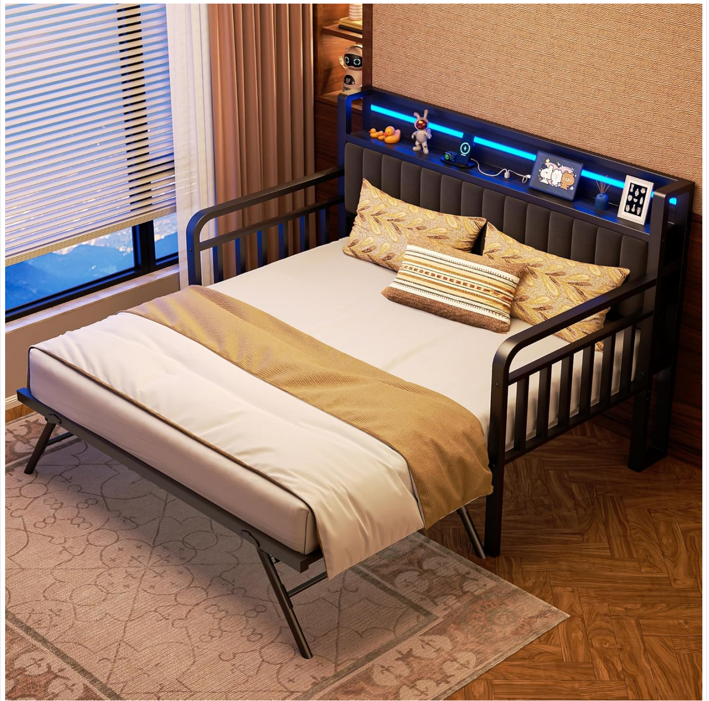
Figure 4: The daybed with the trundle fully extended and raised, demonstrating its use as a second twin bed or part of a larger sleeping surface.