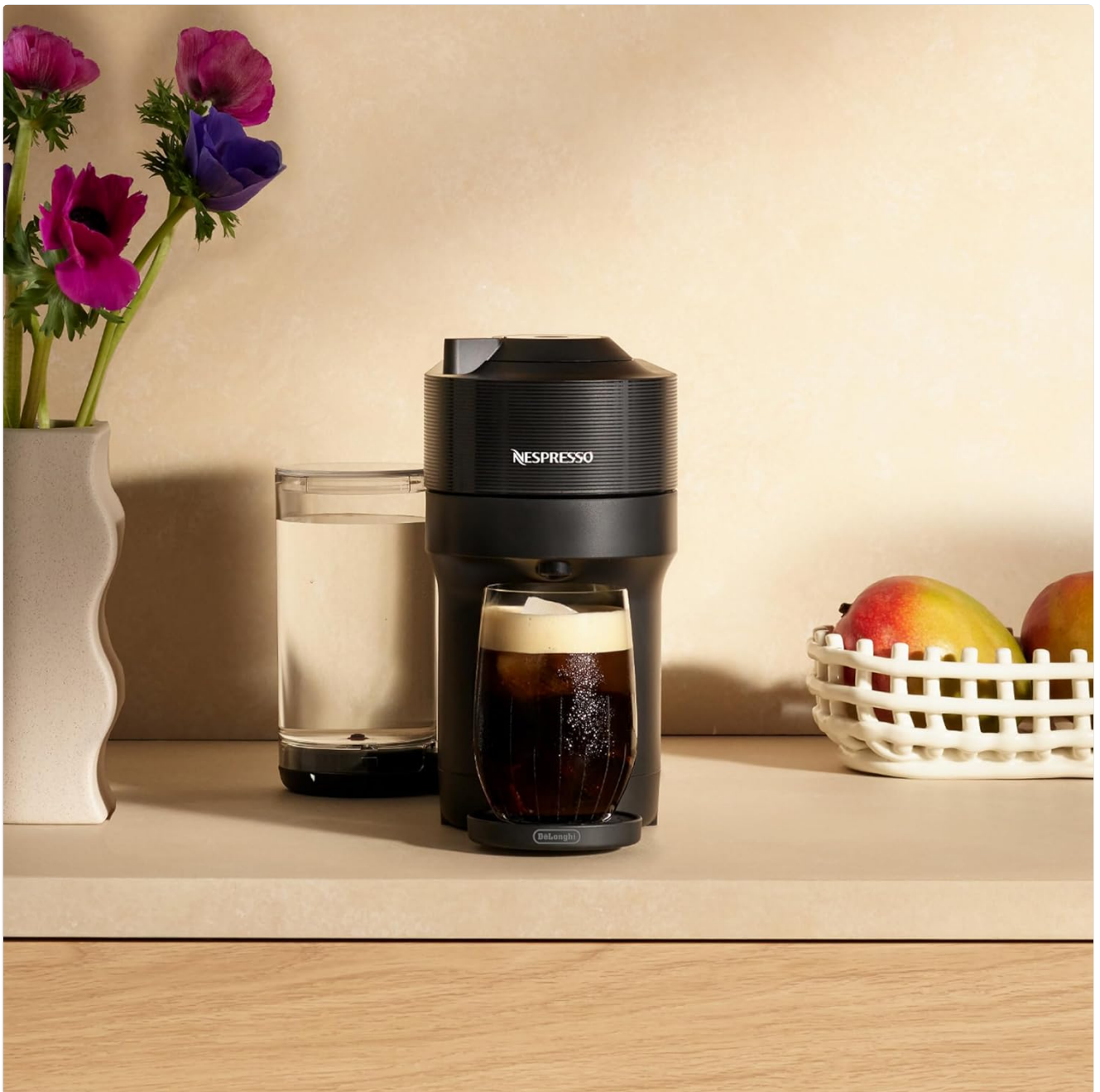
Figure 2: The compact design of the Vertuo Pop+ fits well in various spaces.