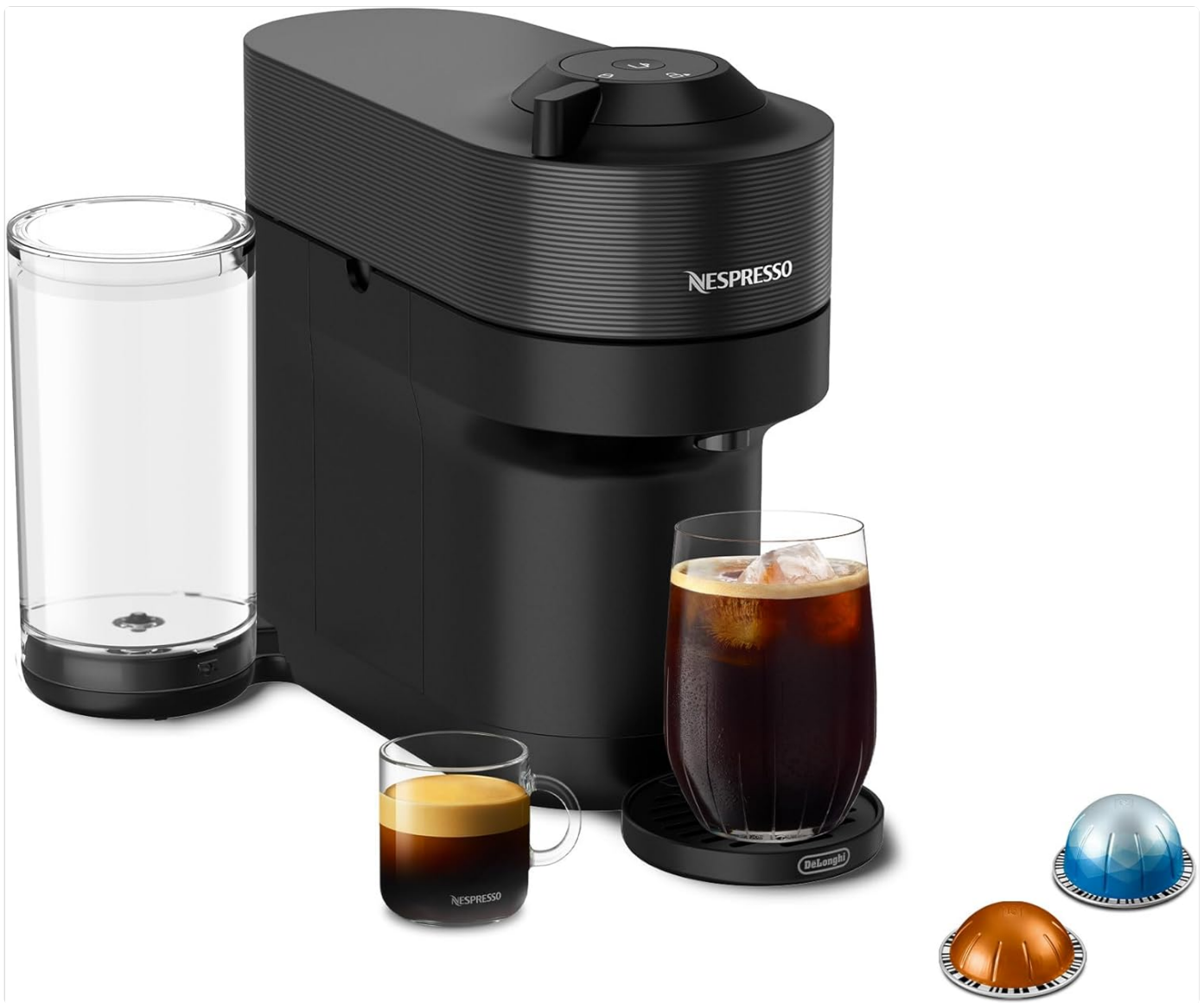
Figure 1: Nespresso Vertuo Pop+ Coffee and Espresso Machine, Liquorice Black.