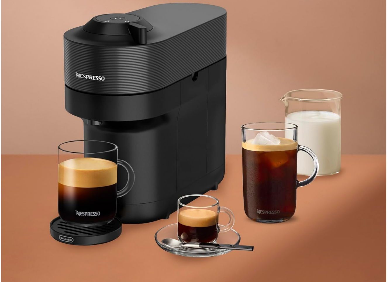
Figure 5: The Vertuo Pop+ brews both espresso and coffee.

4. Cup Sizes: The Vertuo Pop+ offers five cup sizes: