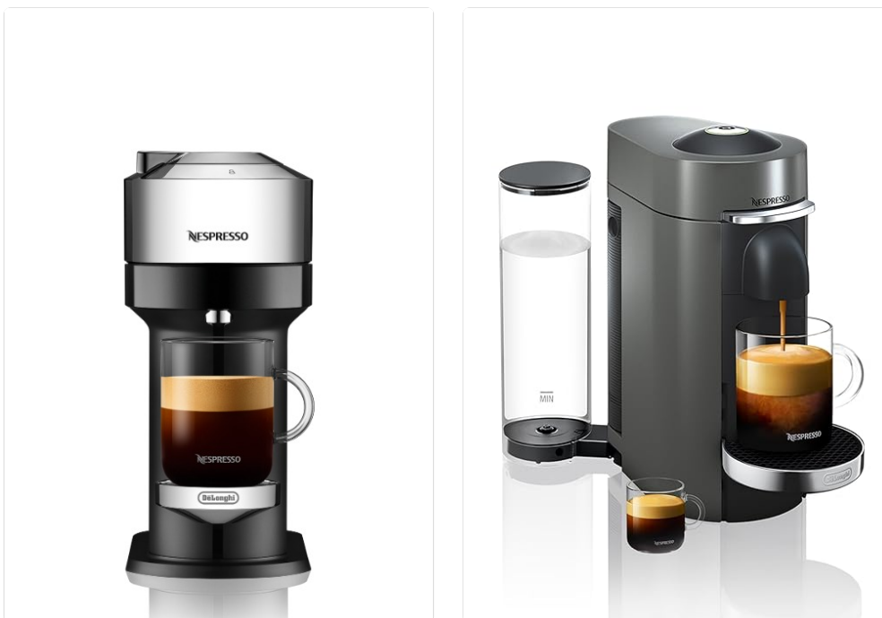
Figure 7: Nespresso pods are filled with freshly roasted ground coffee and are recyclable.