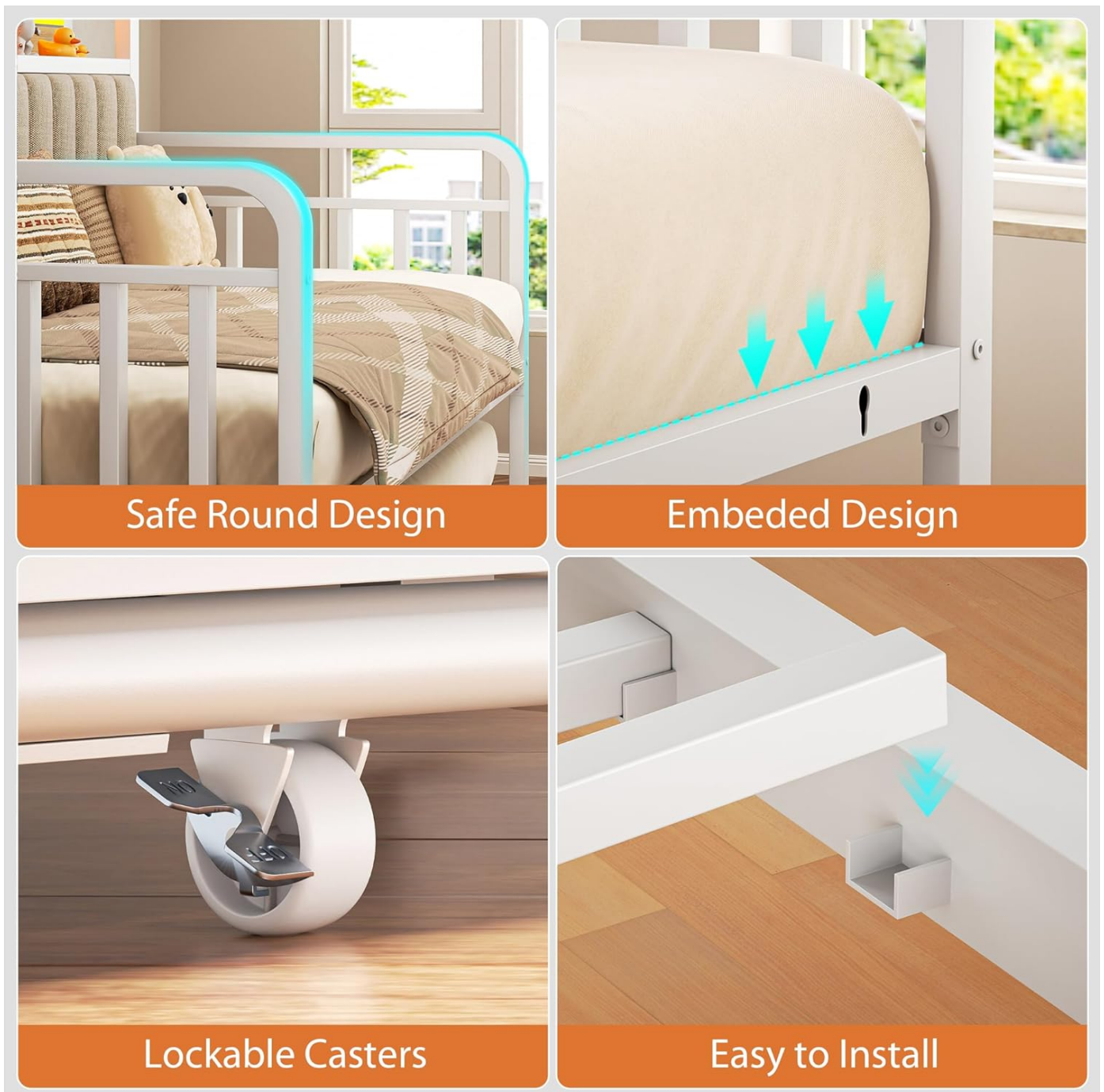
Figure 3: Key design features including safe round edges, embedded mattress design, lockable casters, and easy installation points.