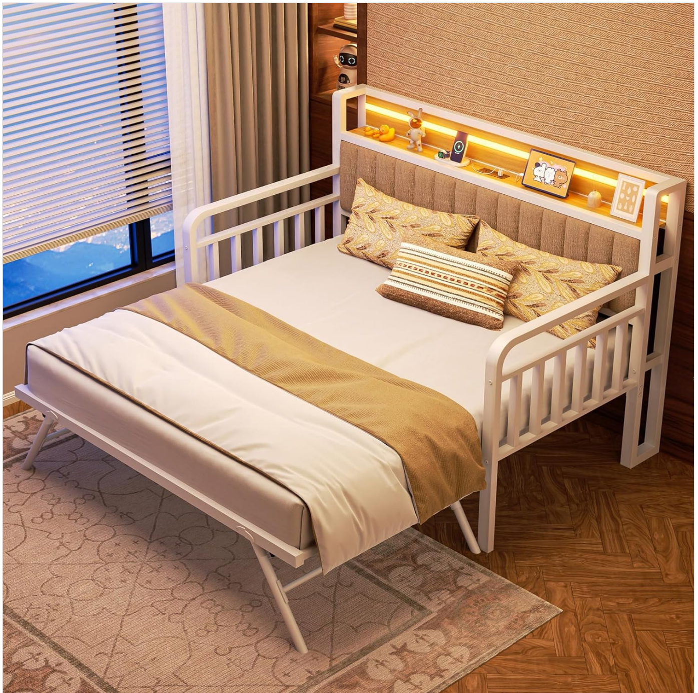
Figure 7: The headboard with its integrated LED lighting and charging station.