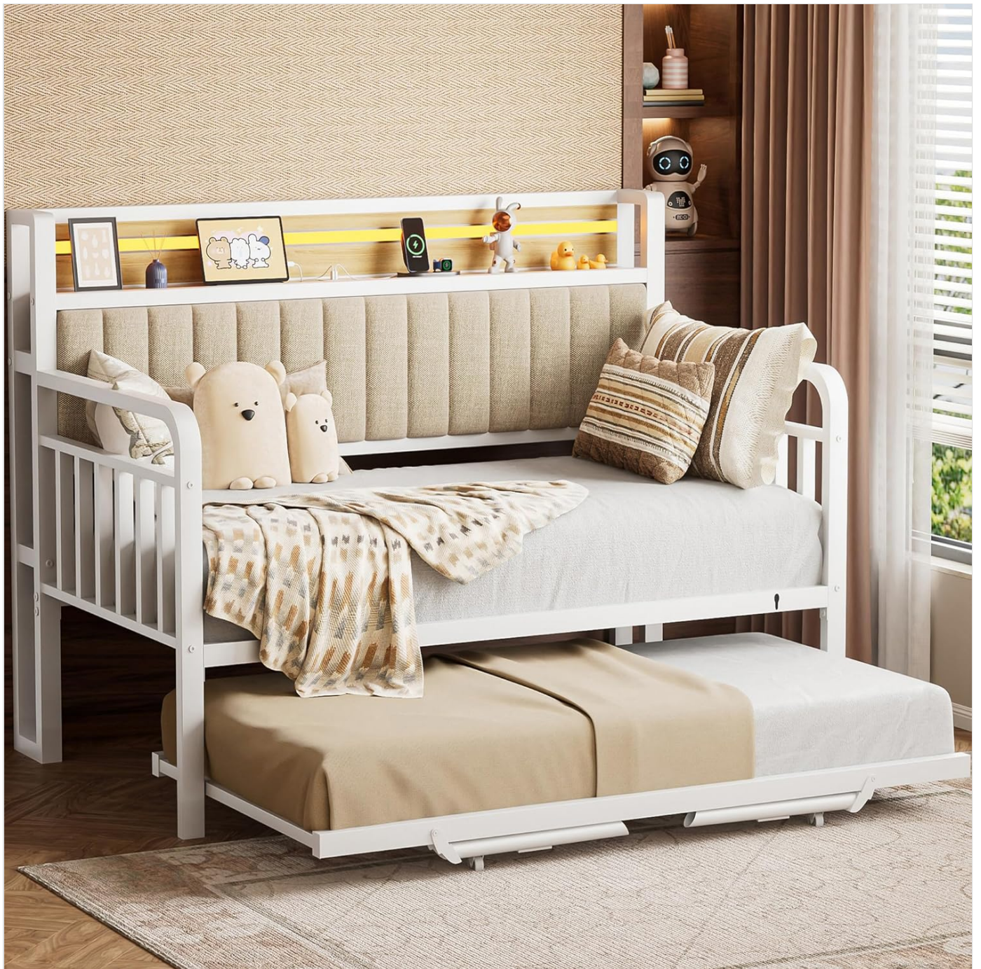
Figure 2: Fully assembled Jocoevol Daybed with Trundle.