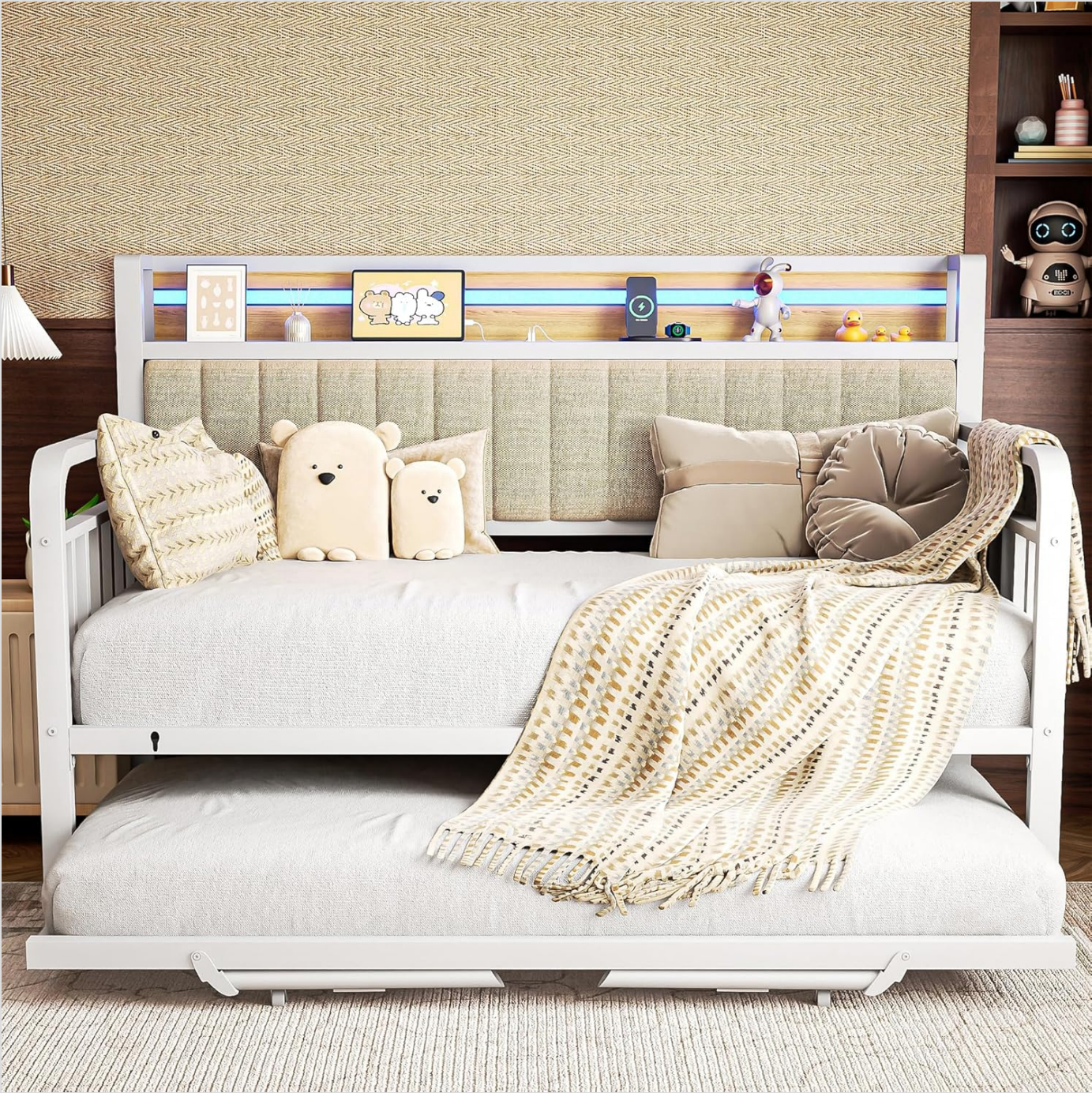
Figure 4: The trundle bed extended and popped up, ready for use.