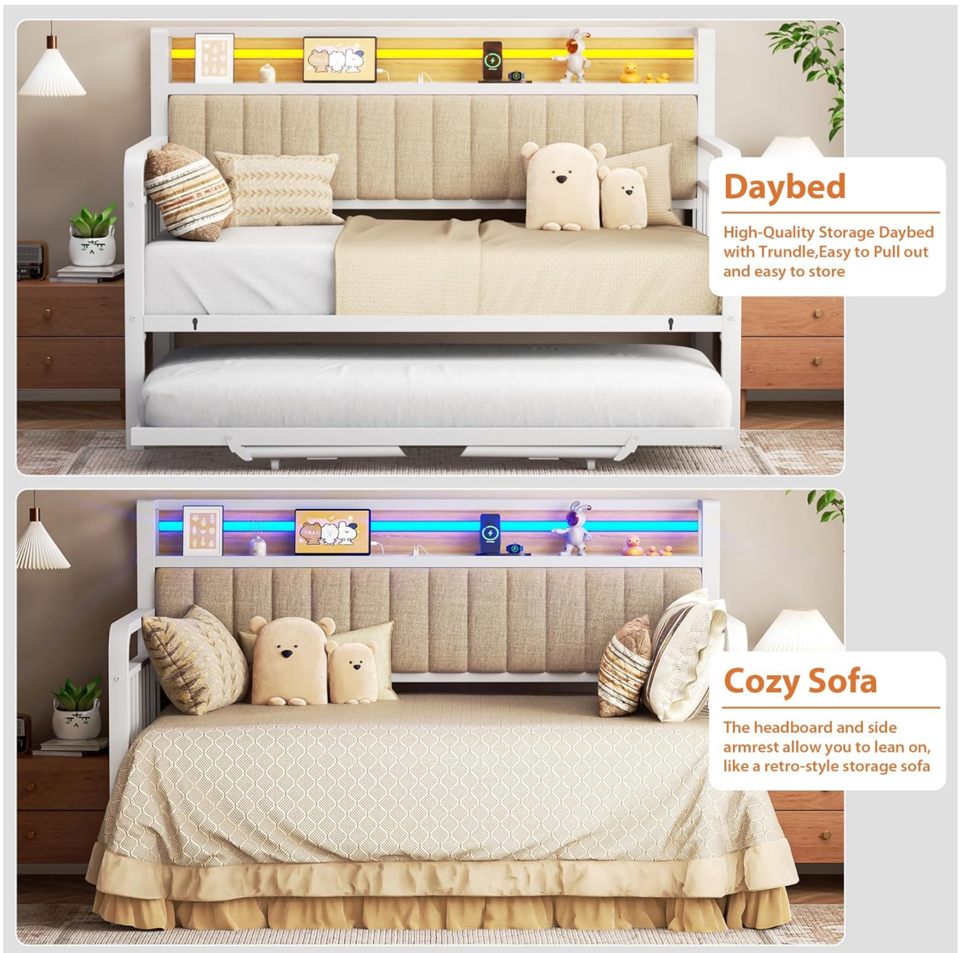
Figure 5: The daybed configured as a traditional daybed and as a cozy sofa.