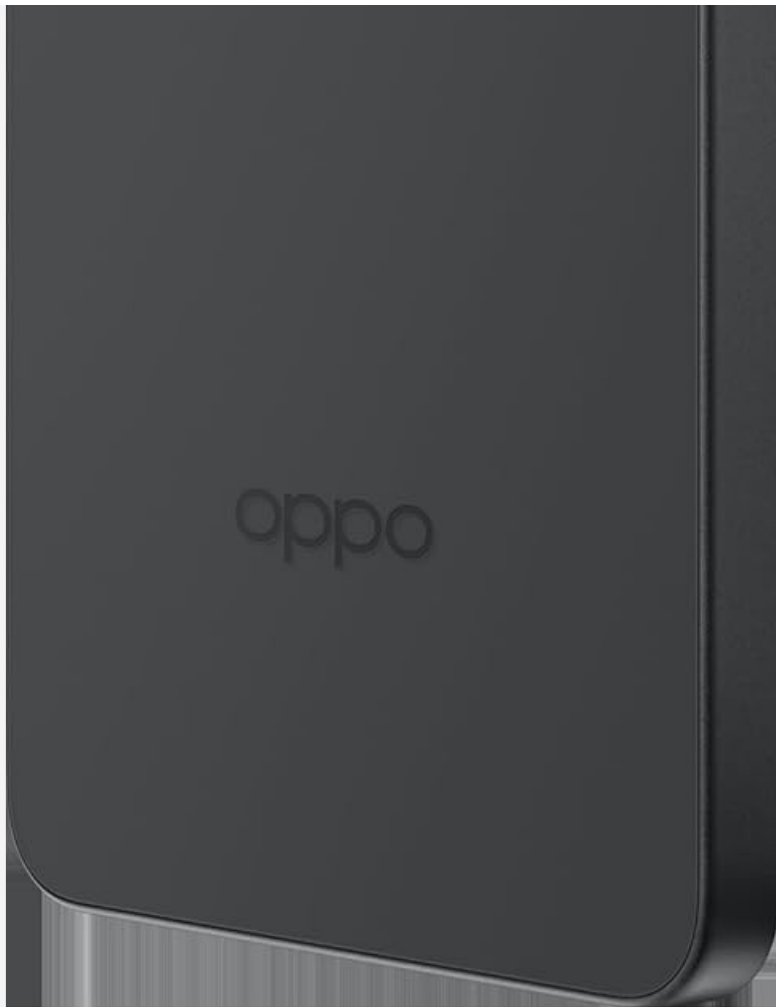
The back of the OPPO Reno13 FS 5G is shown, featuring its distinctive camera module and the subtle OPPO branding at the bottom.