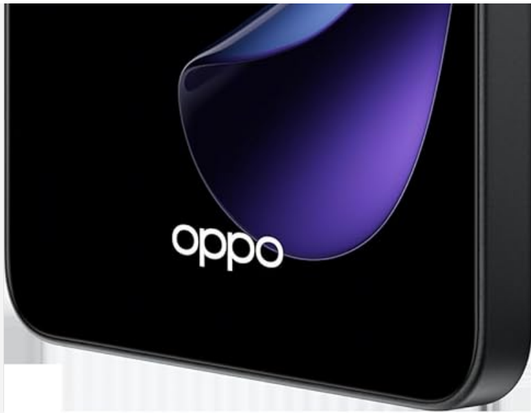
This image provides a clear side view of the OPPO Reno13 FS 5G, detailing the placement of the volume rocker and power button.