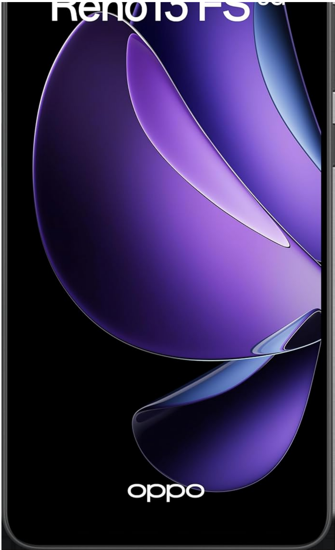
This image displays the front of the OPPO Reno13 FS 5G smartphone, highlighting its vibrant display and the prominent 'OPPO AI Phone' and 'OPPO Reno13 FS 5G' branding.