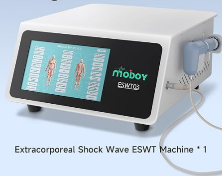
Extracorporeal Shock Wave ESWT Machine * 1