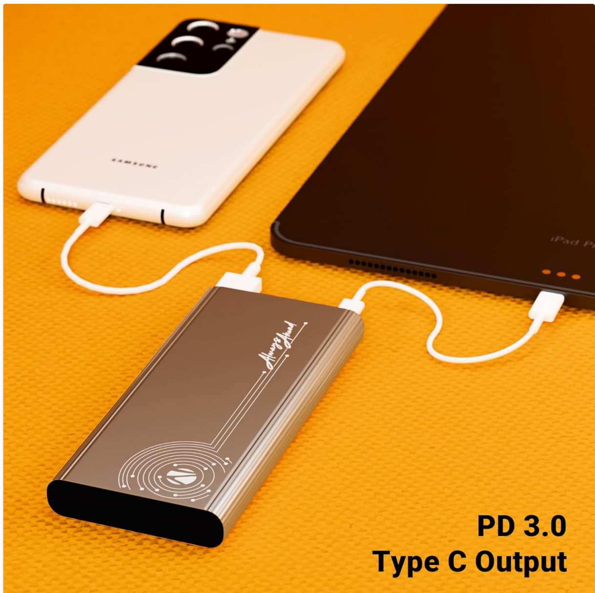
Image: The ZEBRONICS EnergiPod 10MR1 Power Bank simultaneously charging a smartphone and a tablet, highlighting its PD 3.0 Type C Output for versatile device compatibility.