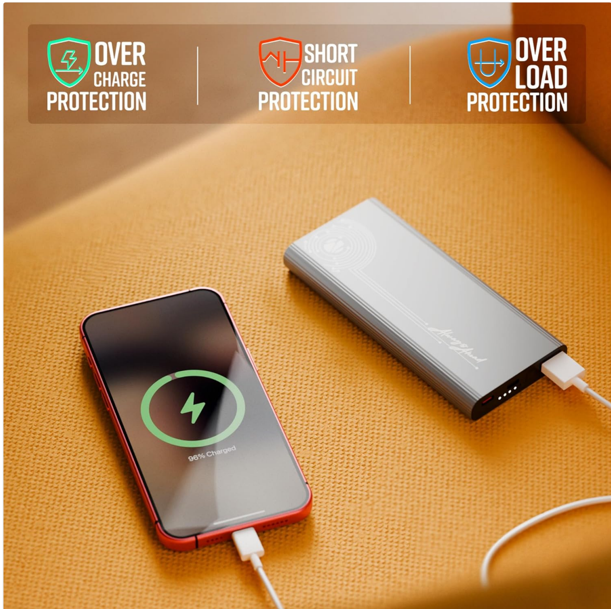
Image: The ZEBRONICS EnergiPod 10MR1 Power Bank charging a phone, accompanied by icons representing Overcharge Protection, Short Circuit Protection, and Overload Protection, emphasizing its safety features.