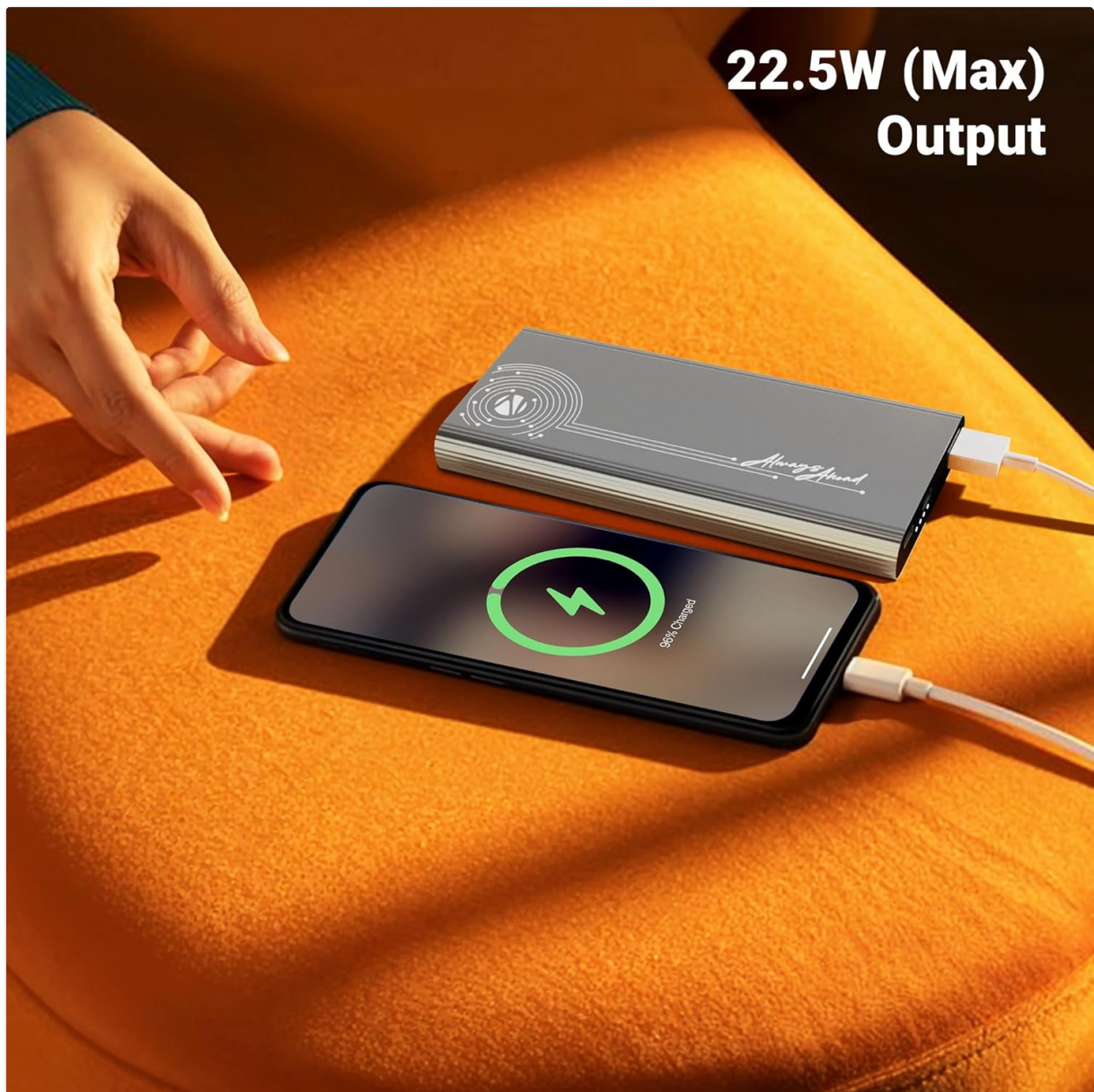
Image: The ZEBRONICS EnergiPod 10MR1 Power Bank connected via cable, actively charging a smartphone, with a "22.5W (Max) Output" label indicating its fast charging capability.