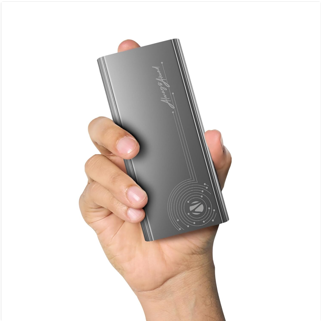
Image: The ZEBRONICS EnergiPod 10MR1 Power Bank, a compact grey device, held in a user's hand, showcasing its portable design.