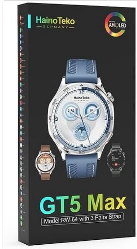
Image: A customizable watch face on the Smart Watch RW 64, featuring various data points.

Personalize your watch by choosing from multiple built-in dial faces or downloading new ones through the companion app.