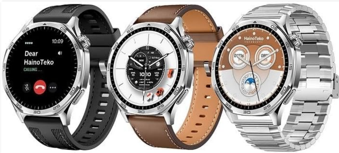
Image: The Smart Watch RW 64 presented with its three distinct strap options: black, brown, and silver metal.

Thank you for choosing the Smart Watch RW 64. This manual provides essential information for setting up, operating, and maintaining your new smartwatch. The RW 64 features a vibrant round AMOLED display, supports Bluetooth calls, and is compatible with both Android and iOS devices. It comes with three interchangeable straps to suit various styles.