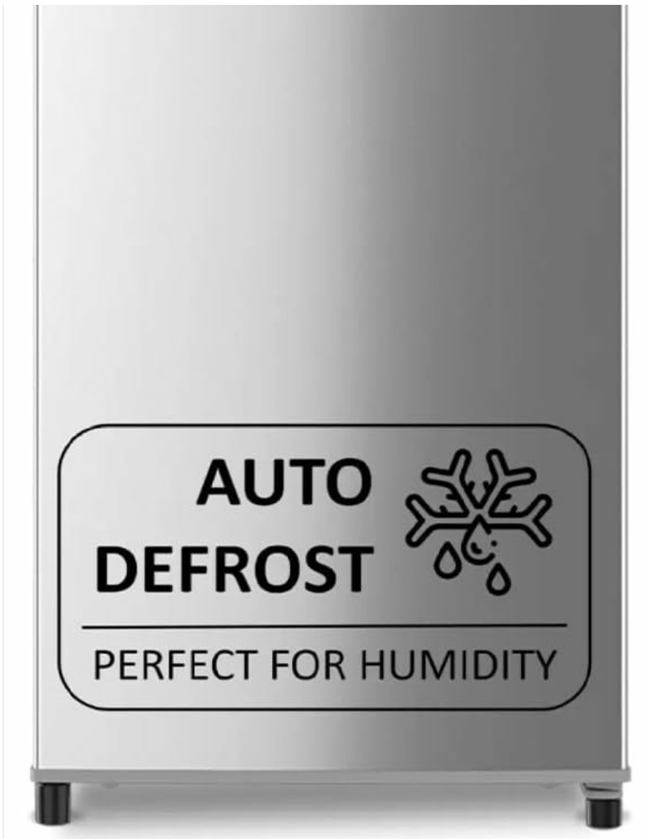
Front view of the Whirlpool 192 L Vitamagic PRO Refrigerator in Radiant Steel.