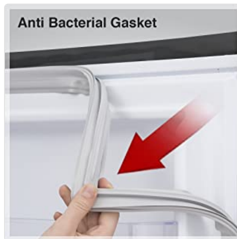
Close-up of the anti-bacterial gasket, highlighting its importance for hygiene.