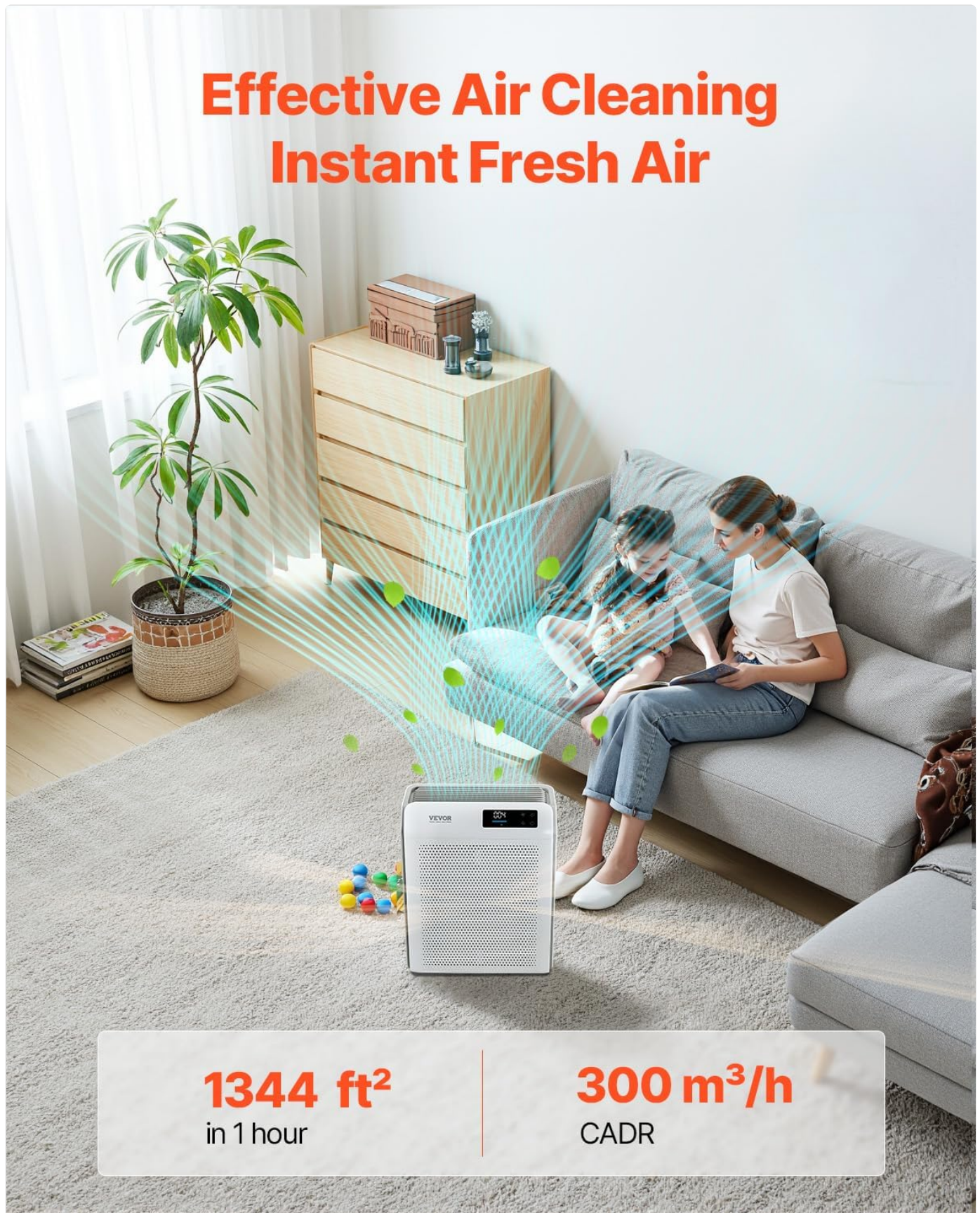
Image: Front view of the VEVOR H13 HEPA Air Purifier, showcasing its minimalist design and air intake grille.

The VEVOR H13 HEPA Air Purifier is designed with a sleek, compact form factor and an intuitive touch control panel. It features a multi-stage filtration system to effectively clean the air in your environment.