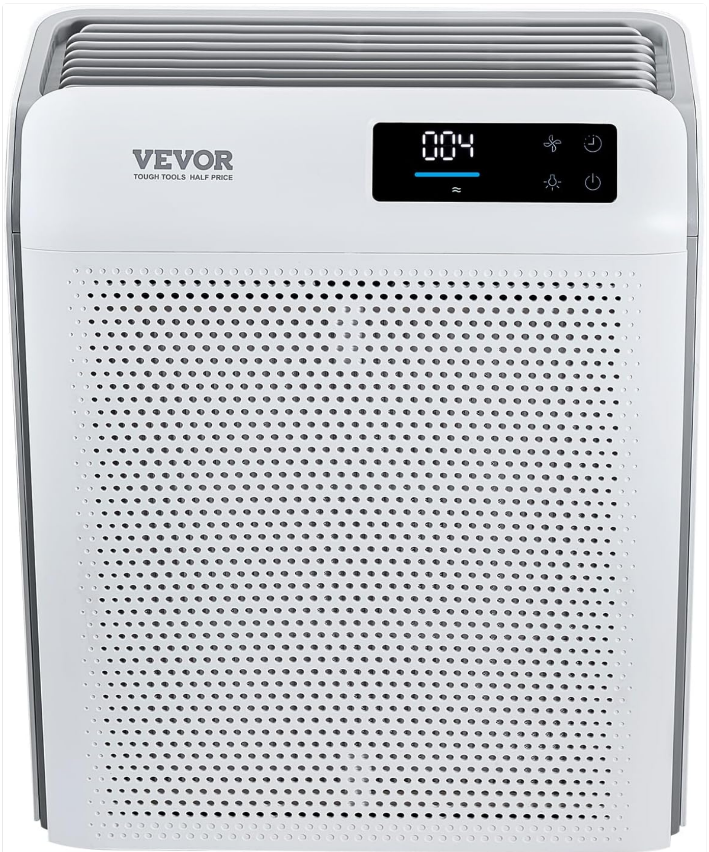
Image: A visual representation of the VEVOR Air Purifier with its dimensions and a list of key specifications.