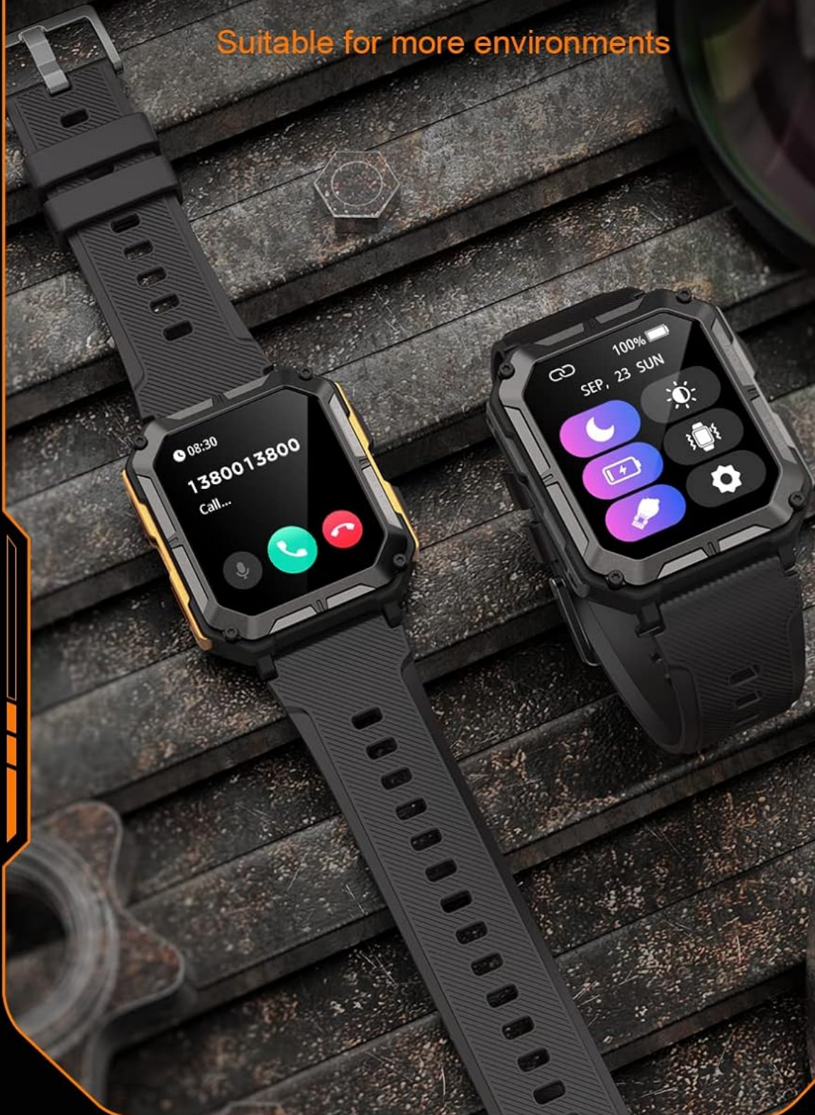
Image: The smartwatch screen showing an incoming call, illustrating the Bluetooth calling feature.