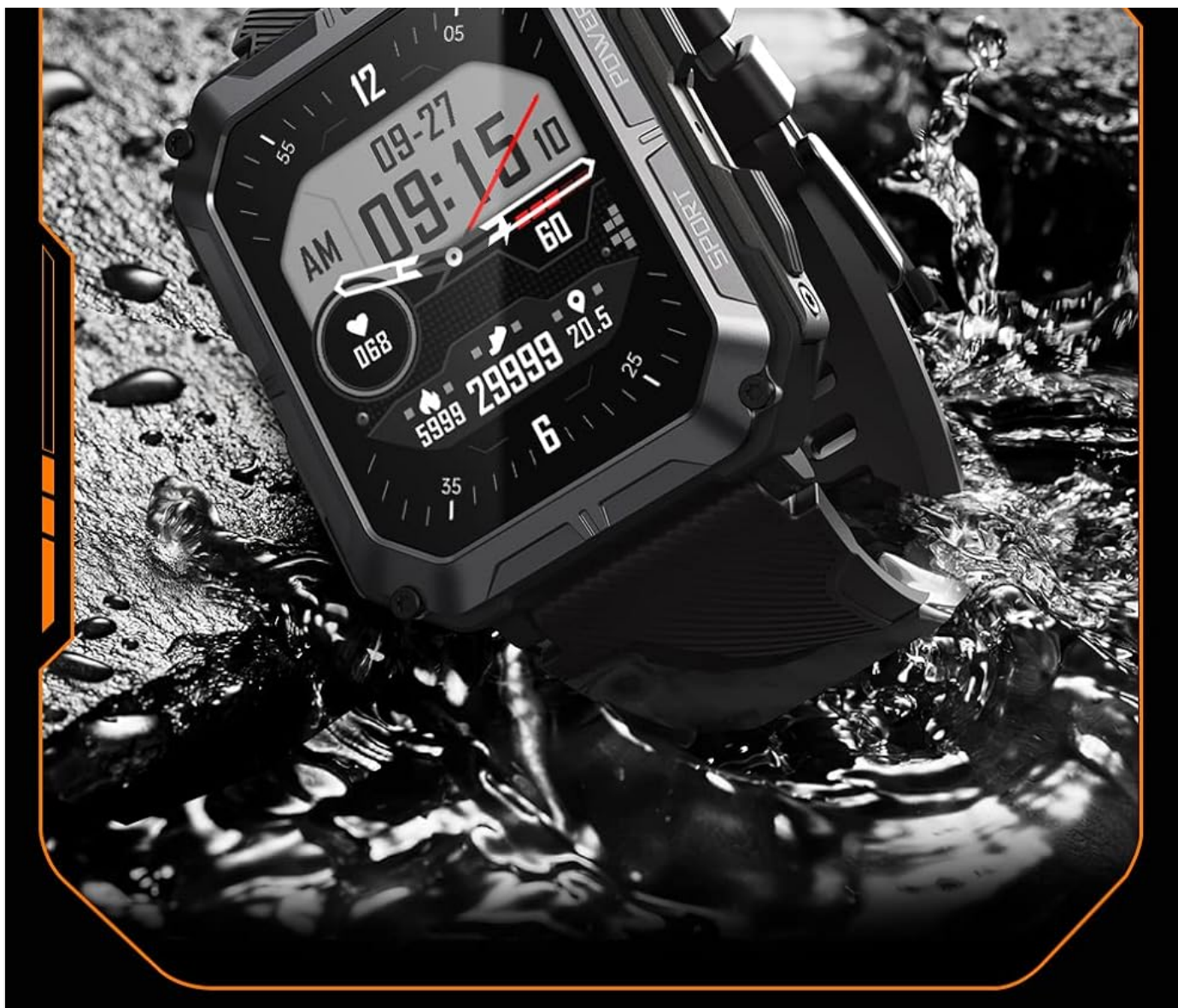
Image: The smartwatch partially submerged in water, demonstrating its IP68 dustproof and waterproof capabilities, suitable for daily exposure to water.