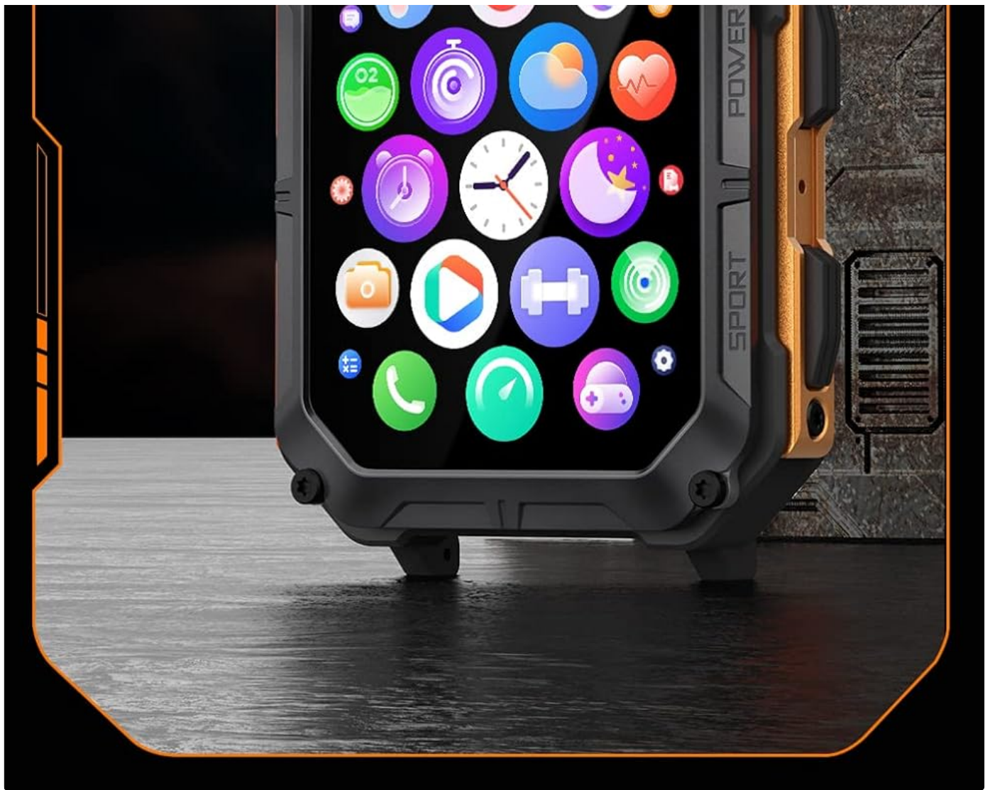
Image: The smartwatch screen showing a grid of application icons, demonstrating the cellular user interface for easy navigation.