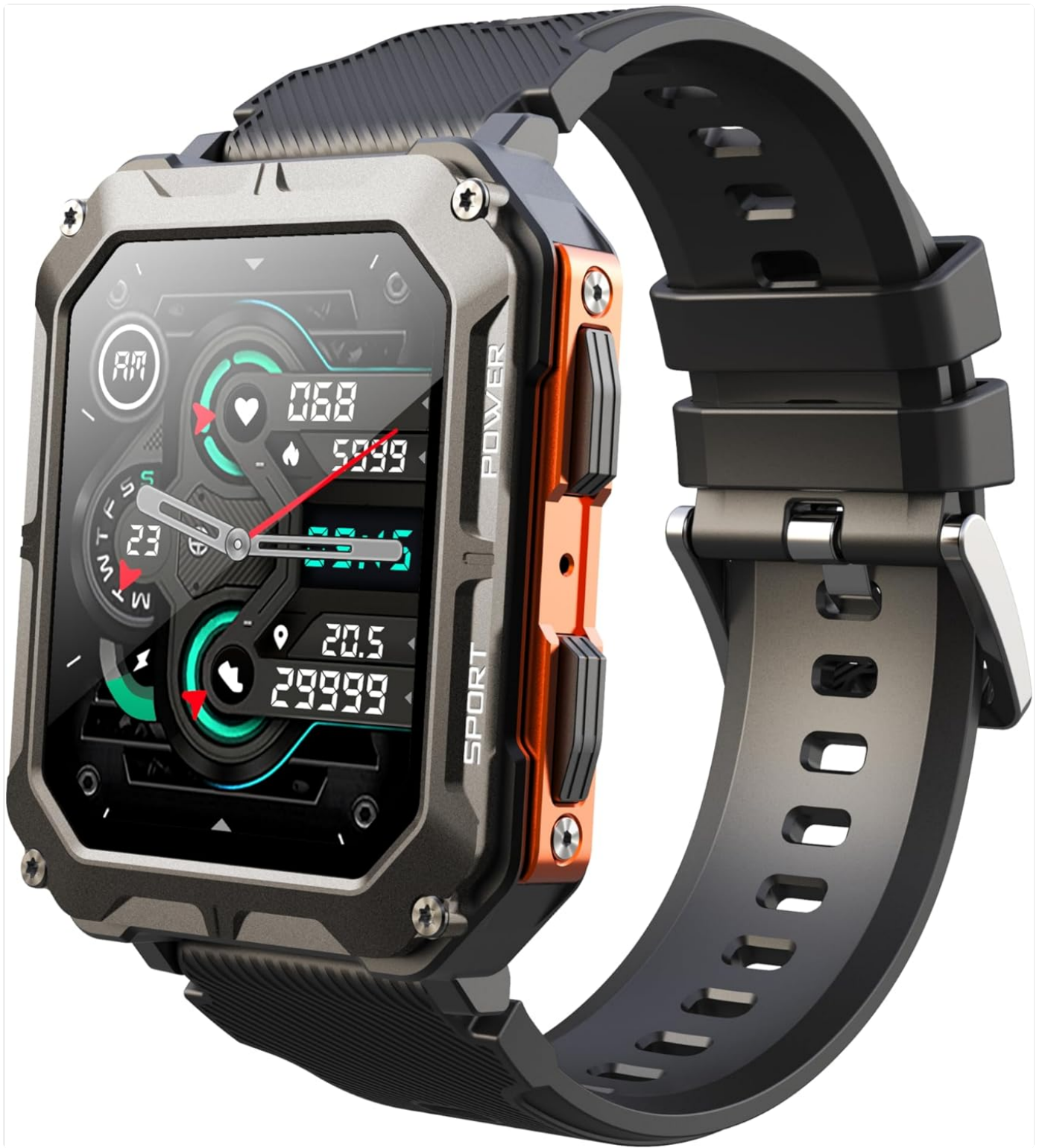
Image: The Gravity C20 Pro Smartwatch, typically accompanied by its charging cable and user manual.