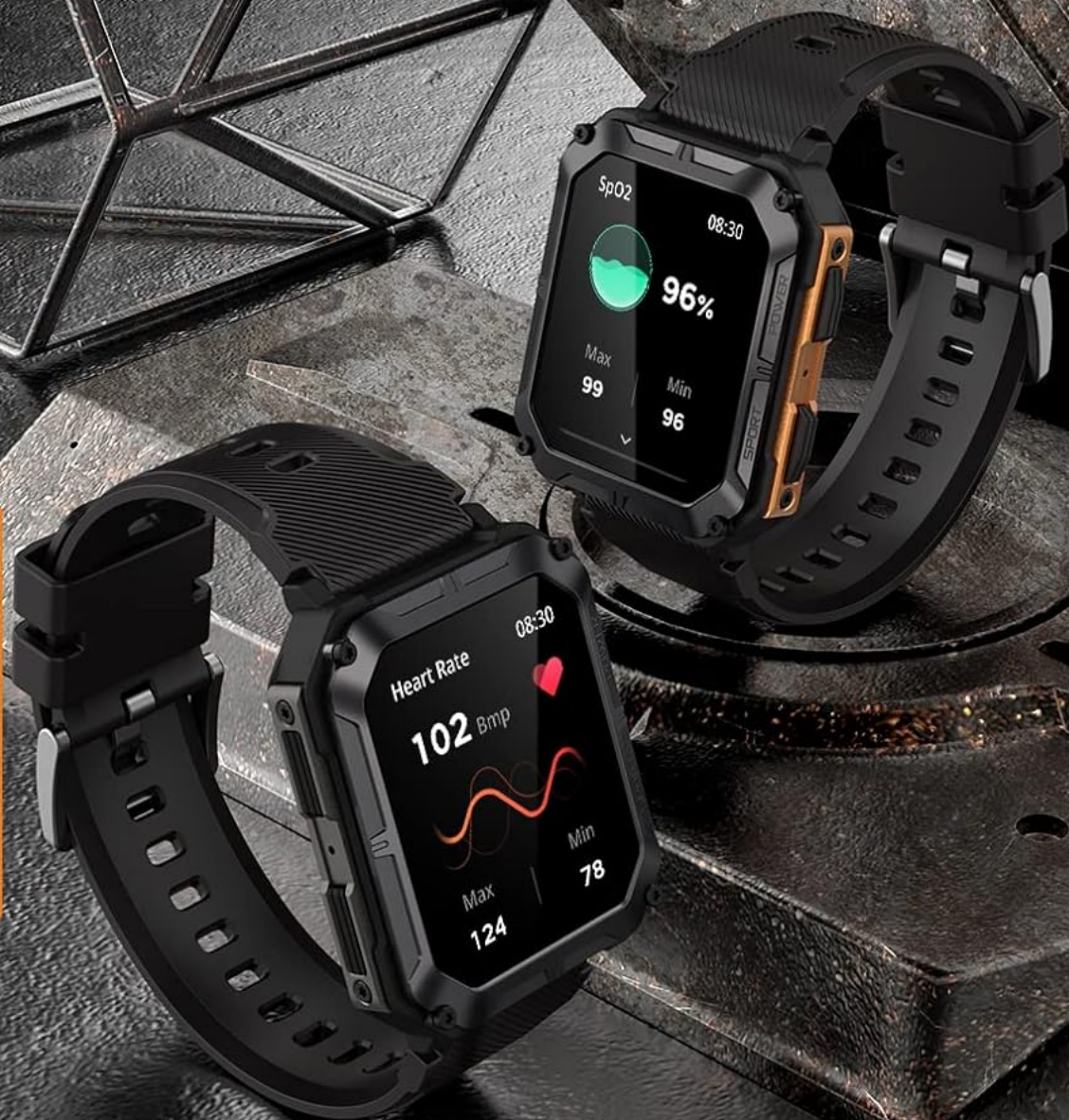
Image: The smartwatch screen displaying real-time heart rate and blood oxygen saturation (SpO2) data, highlighting its health monitoring capabilities.

HR3605 low-power high-definition heart rate & blood oxygen, more accurate detection.