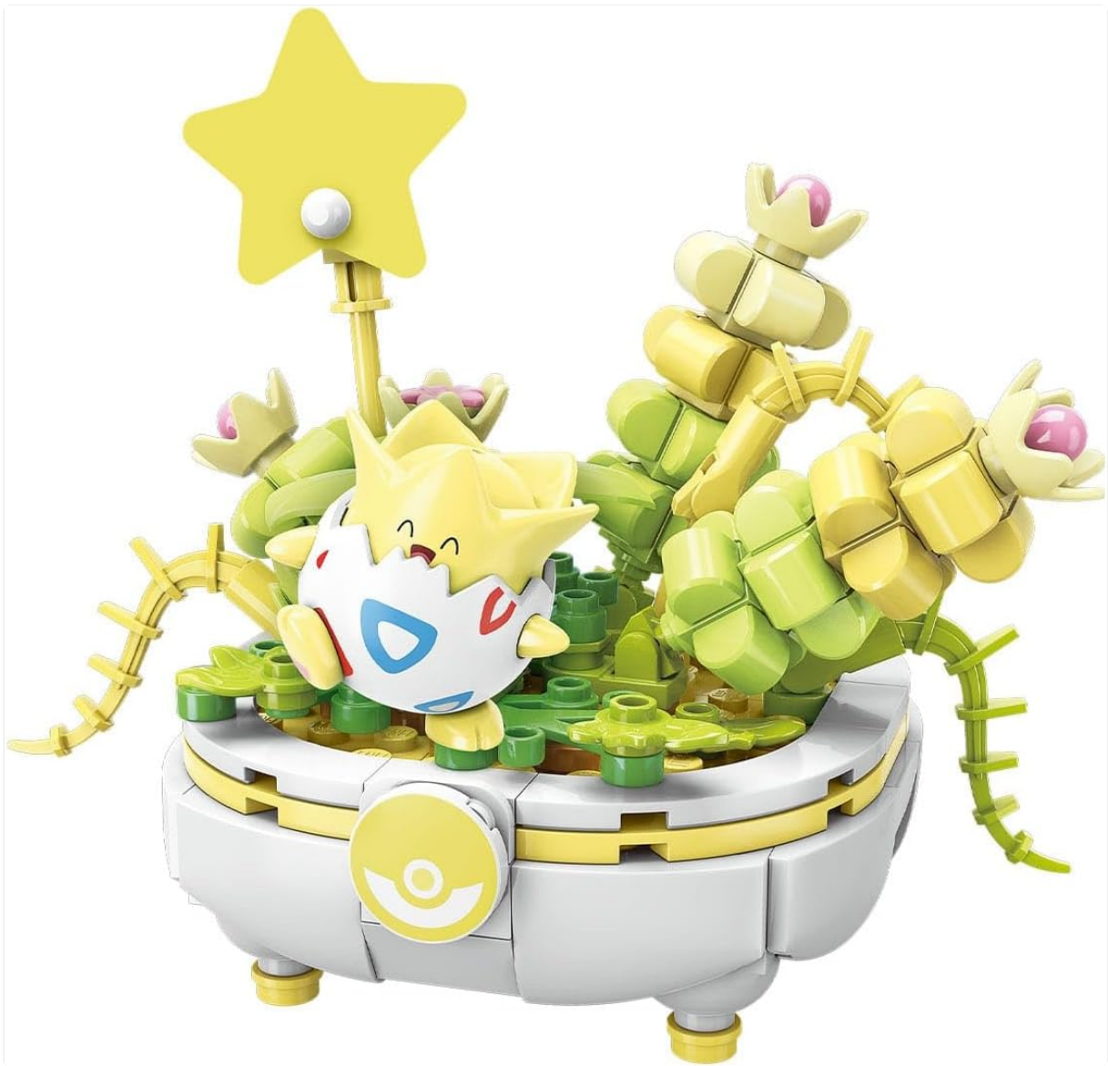
Image 1.1: The fully assembled Keeppley Poke-Egg Bonsai Building Blocks K20238 set, featuring a character emerging from an egg, surrounded by plant-like structures in a pot.