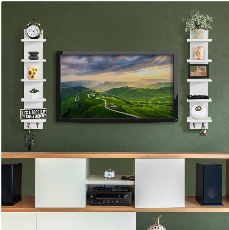
Figure 3: Example of the shelf unit installed in a living room.