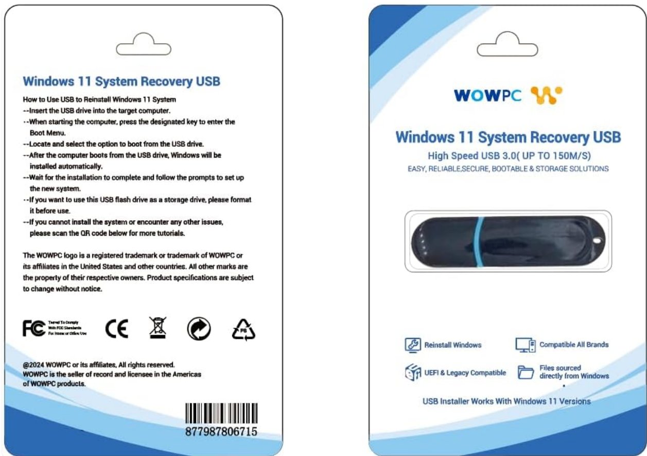
Figure 2.1: WOWPC Windows 11 System Recovery USB. This USB drive is provided for system reinstallation purposes.