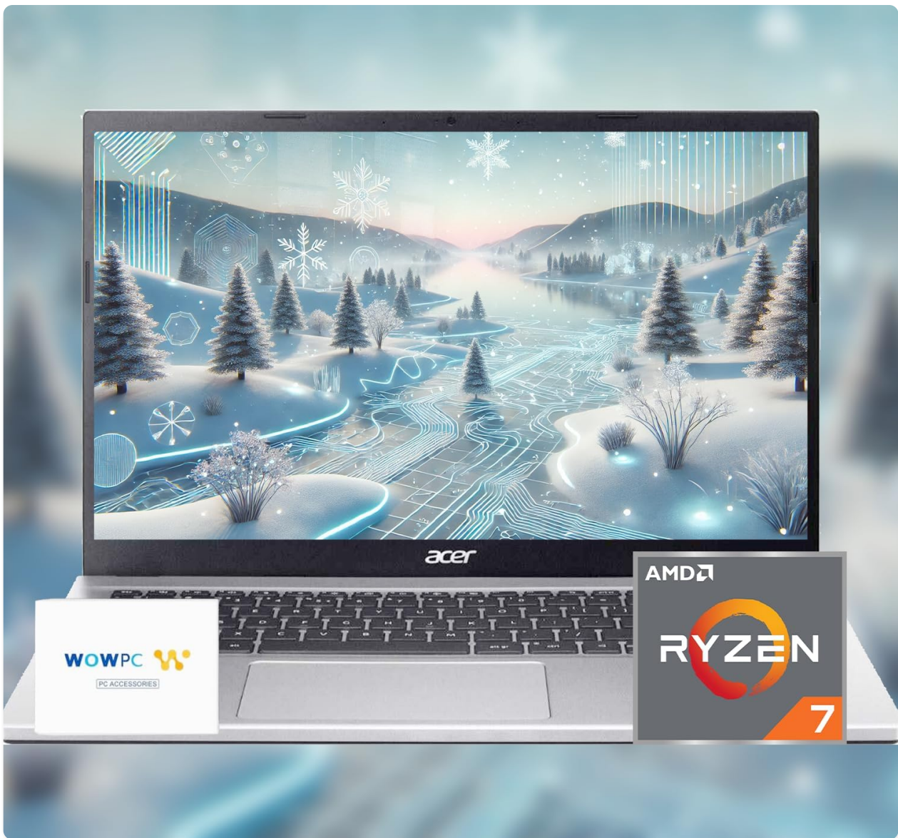
Figure 1.1: Acer Aspire Premium Laptop overview.