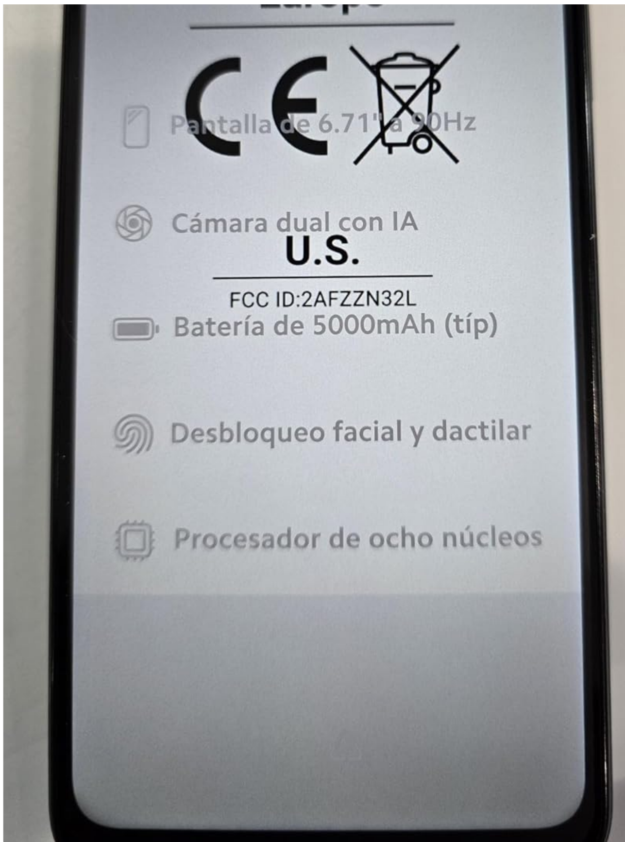
Figure 1.2: On-screen certification details for the Redmi A3X, confirming model 24044RN32L and FCC ID.