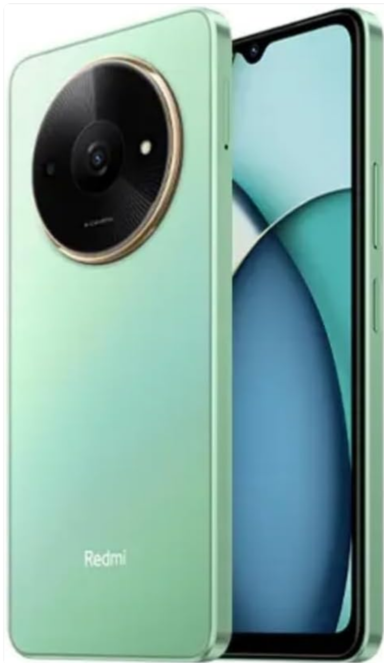
Figure 1.1: Xiaomi Redmi A3X in Aurora Green, highlighting its sleek design and prominent circular camera module.