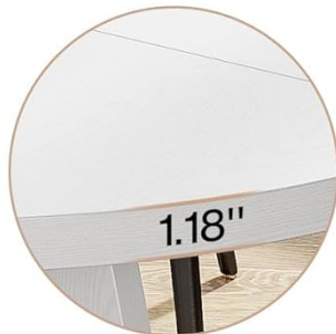
Thickened Table Board