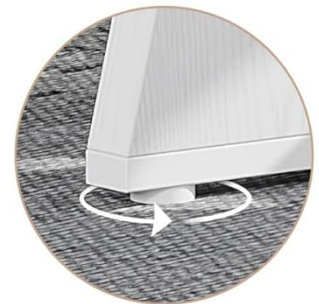
Adjustable Leg Pads

Image: Diagram illustrating the assembly of the table's wooden base structure.