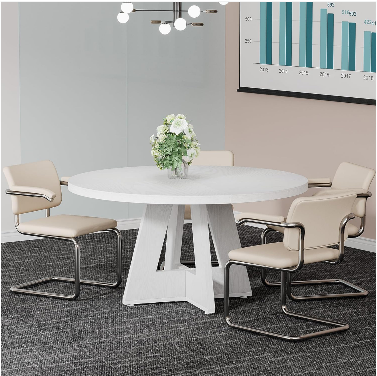
Image: The Tribesigns 47-inch round conference table in a contemporary office environment, showcasing its capacity for multiple users.