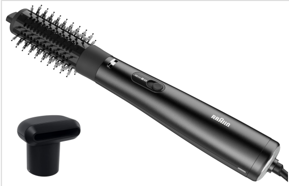
Image 3.1: Braun AS4.2 Hot Air Styler with its two main attachments.