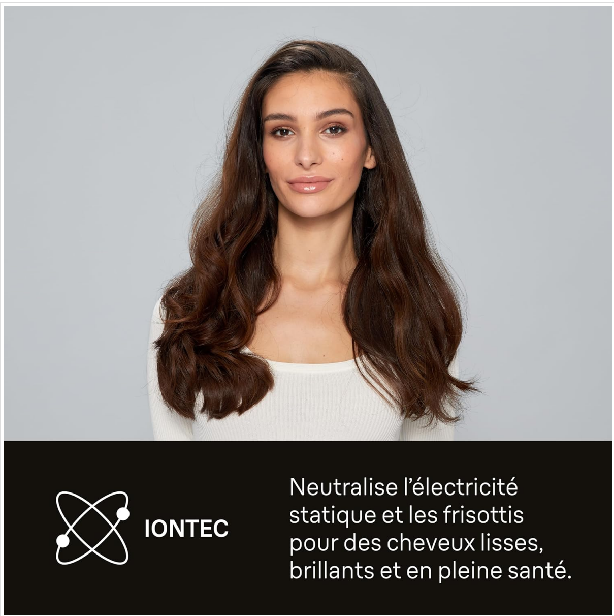
Image 3.5: Hair styled with IONTEC technology, appearing smooth and shiny.