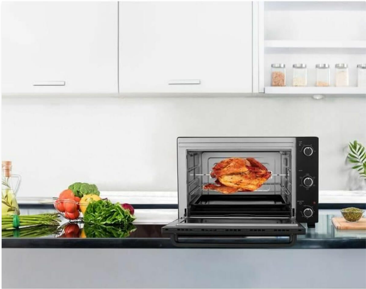
Figure 1.1: Continental Edison CEMF60B3 Electric Mini Oven in use.