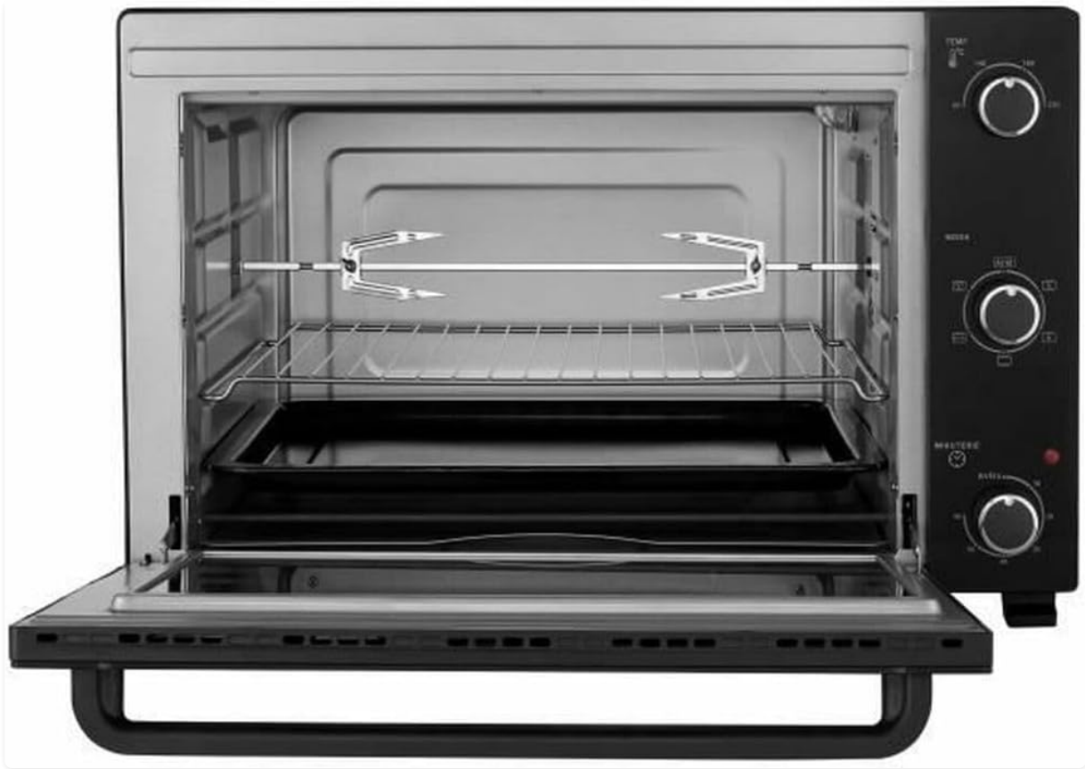
Figure 4.1: Oven Interior with Accessories.