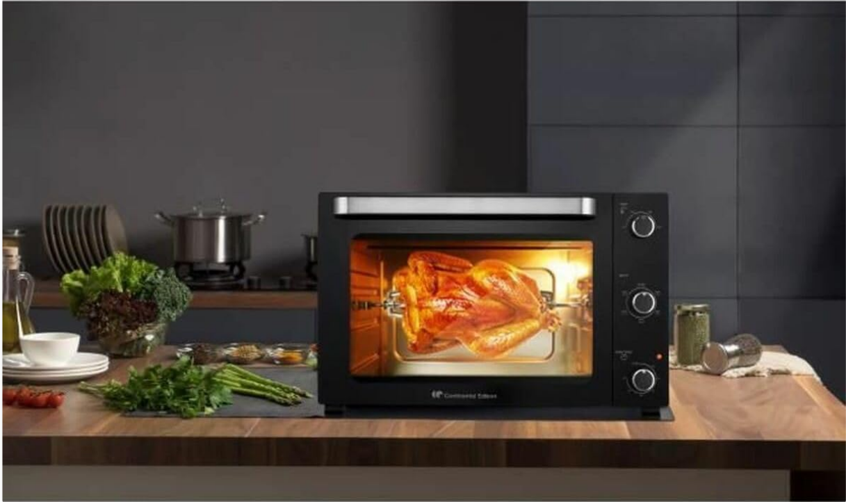
Figure 6.1: Rotisserie function in action.