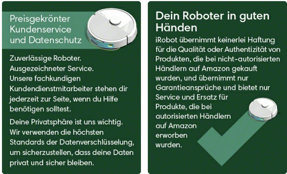
Image: Visual representations of iRobot's commitment to customer service, data privacy, and warranty policies for products purchased through authorized channels.

For the latest information and support, please visit www.irobot.com .