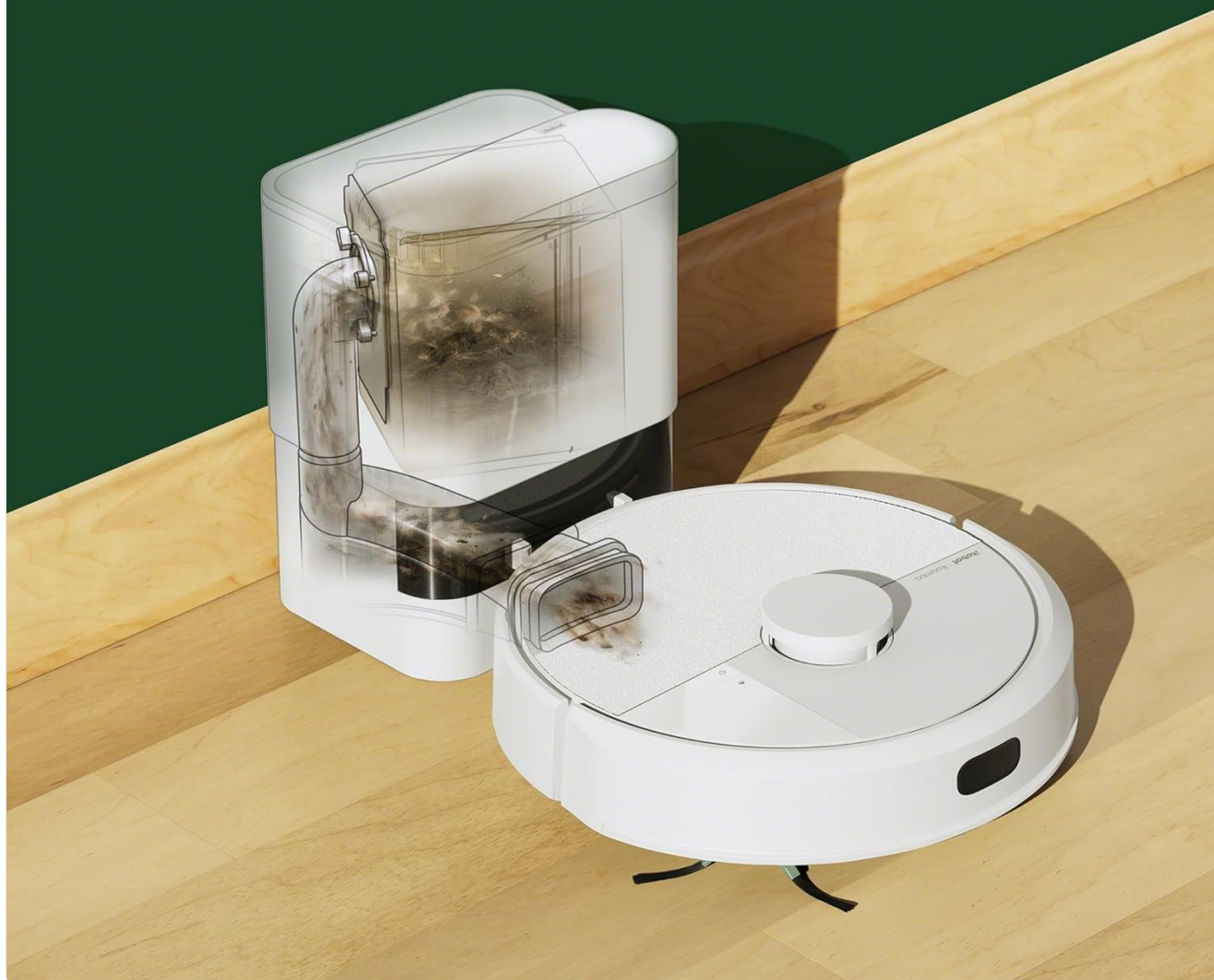
Image: A transparent view of the iRobot Roomba 105 Combo's AutoEmpty dock, illustrating how dirt and debris are collected and stored within the disposable bag.

Samlar upp skräp från upp till 75 dagar. ALLERGENLOCK™-PÅSAR FÅNGAR UPP 99 % AV ALLA POLLEN- OCH MÖGELALLERGENER.