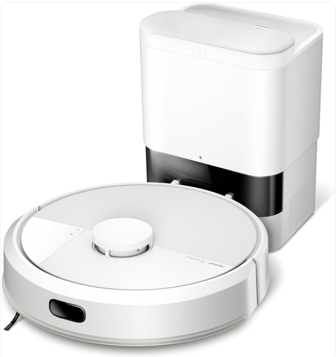
Image: The iRobot Roomba 105 Combo robot positioned next to its AutoEmpty dock, ready for operation.