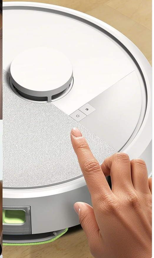
Image: Illustration showing the three primary methods of controlling the Roomba 105 Combo: voice commands via a smart assistant, direct interaction with the robot's physical buttons, and through the intuitive iRobot Home mobile application.