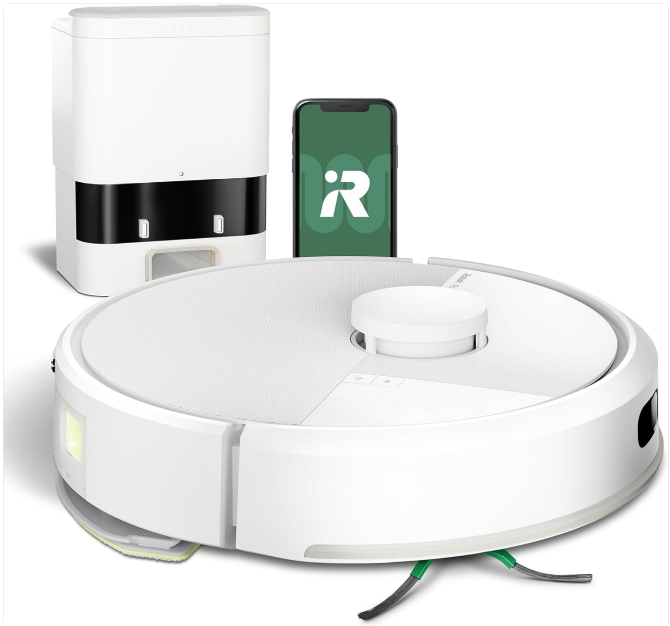
Image: The iRobot Roomba 105 Combo robot vacuum and mop, its AutoEmpty dock, and a smartphone displaying the iRobot Home app interface.