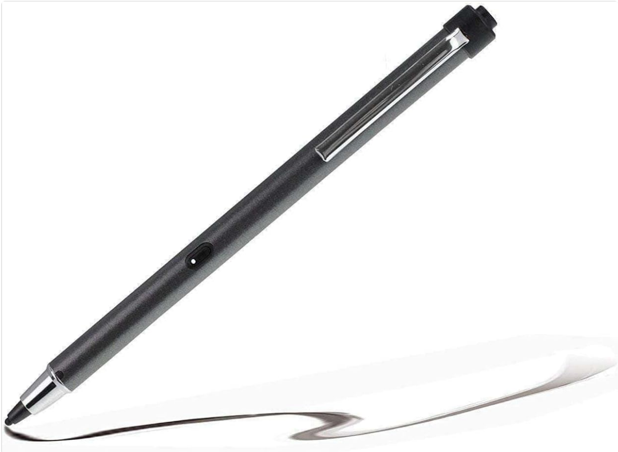
Figure 1: The Broonel Fine Point Digital Active Stylus Pen, showcasing its sleek design and fine tip.

This manual provides comprehensive instructions for the setup, operation, and maintenance of your Broonel Fine Point Digital Active Stylus Pen. Designed for precision and compatibility, this stylus enhances your interaction with compatible iOS and Android tablet PCs and smartphones, including the DOOGEE U11 11" Tablet.