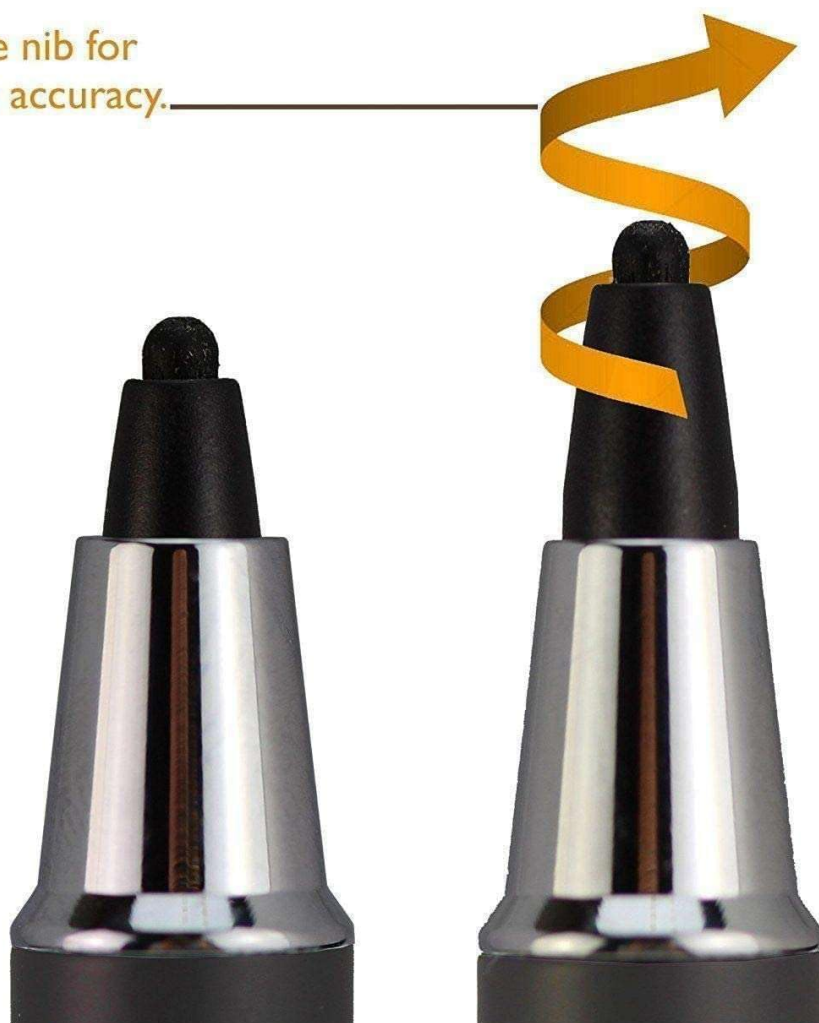
Figure 3: A detailed view of the stylus nib, illustrating the mechanism for adjustment to achieve maximum accuracy.