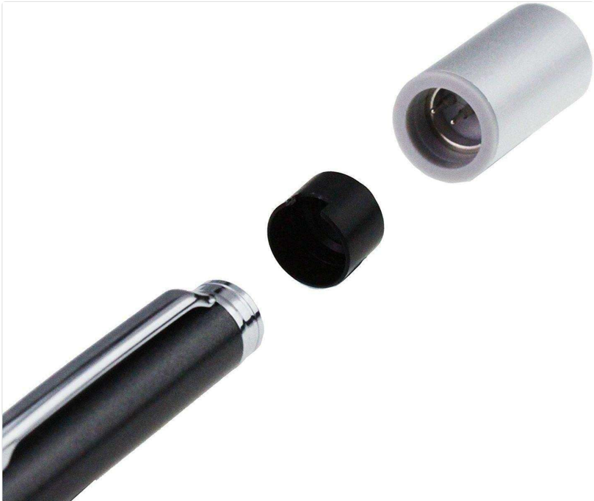
Figure 2: The stylus pen with its top cap detached, revealing the internal compartment for battery insertion.