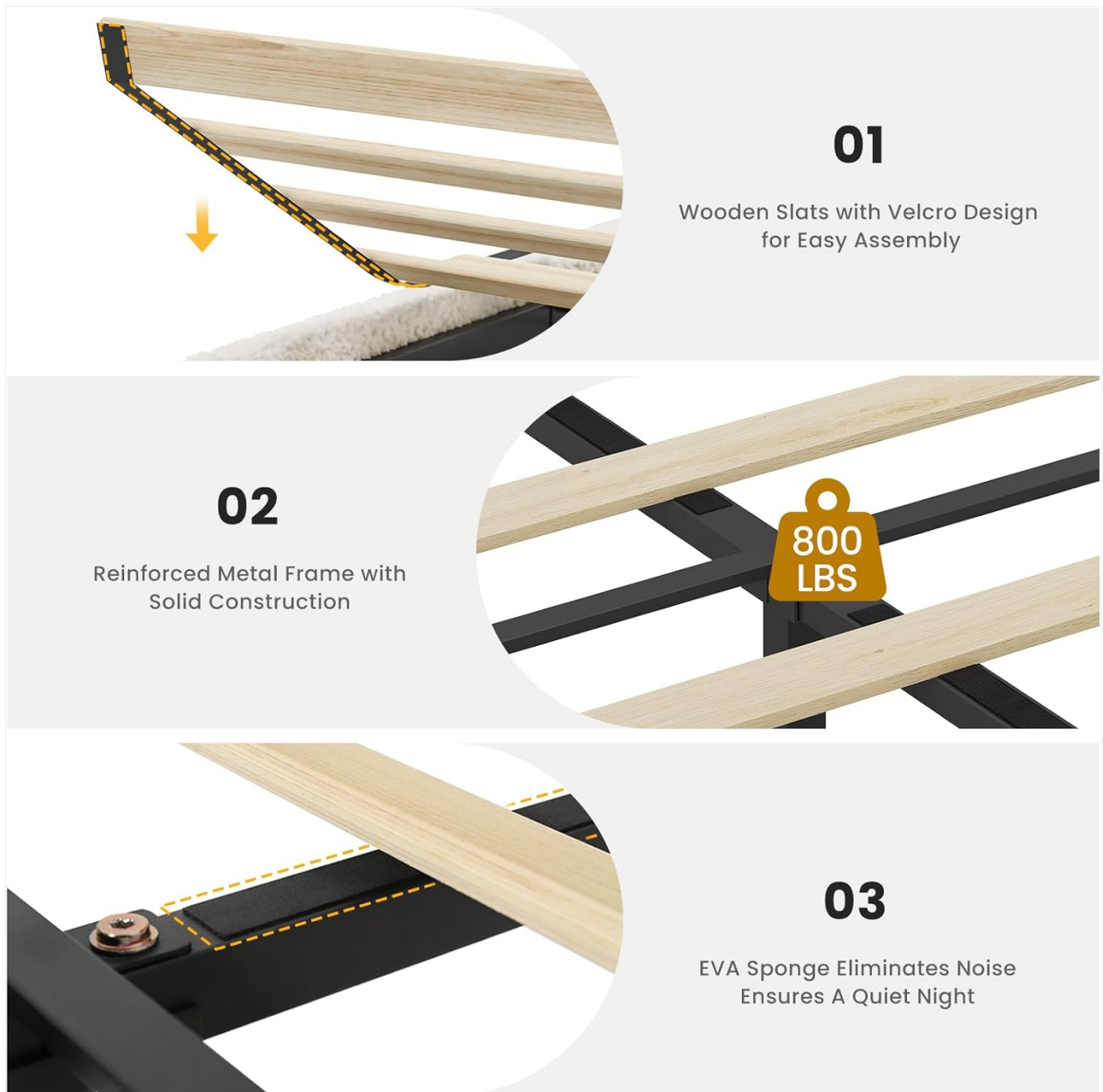
Figure 3: Details of the bed frame construction, including slats, metal frame, and noise-reducing EVA sponge.