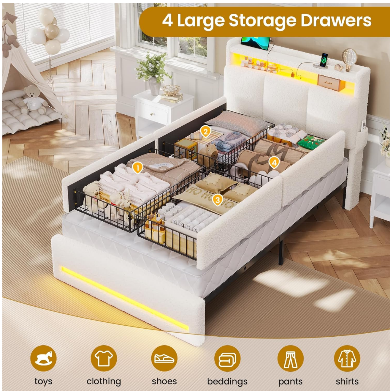
Figure 6: Four large storage drawers for organizing items.