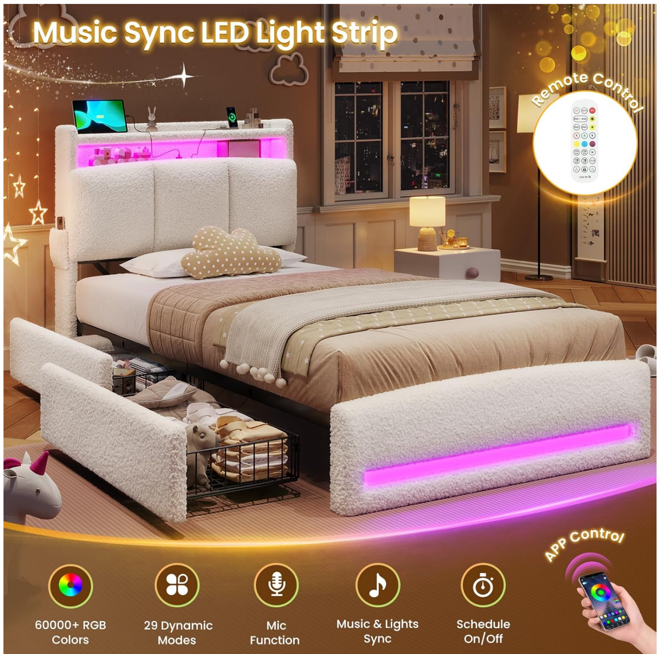
Figure 5: Music Sync LED Light Strip features and controls.