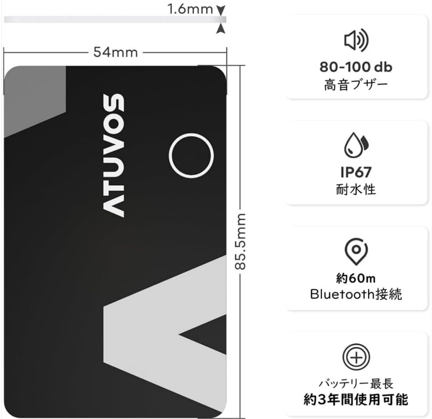
Image 4: Specifications and Features of the ATUVOS Tracker Tag. This graphic details the physical dimensions (54mm x 85.5mm x 1.6mm) and highlights key functional specifications such as the 80-100dB buzzer, IP67 water resistance rating, approximately 60m Bluetooth connection range, and a battery life of up to 3 years.