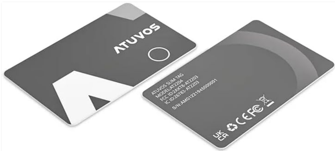
Image 2: Front and back view of the ATUVOS Bluetooth Tracker Tag. One card displays the front design, while the other shows the reverse side with product information including the model number AT2204 and various regulatory compliance symbols.