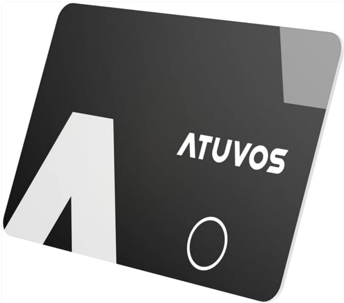
Image 1: Front view of the ATUVOS Bluetooth Tracker Tag. This image shows the sleek, black card-shaped tracker with the ATUVOS brand name and a subtle circular design element.