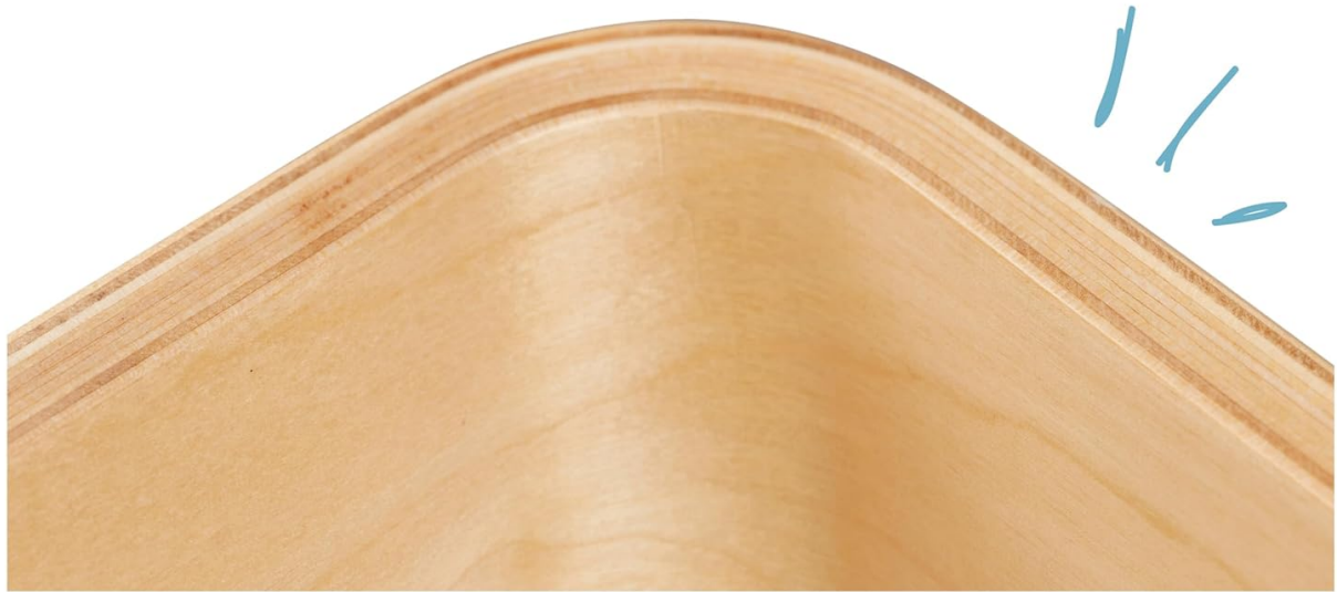
Image 5.1: A close-up detail of the bentwood construction, highlighting the durable birch plywood and long-lasting finish designed to resist scratching.