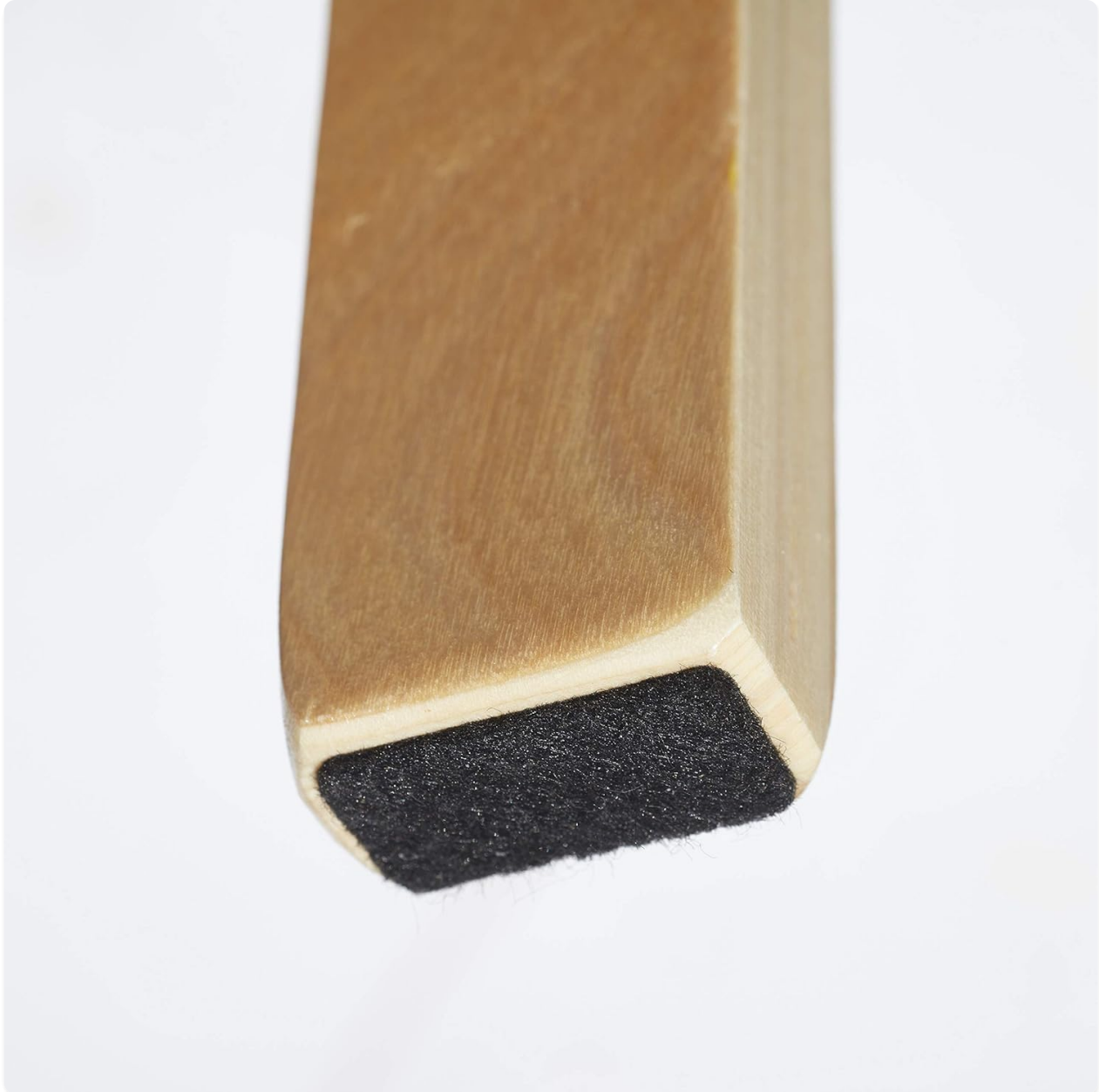
Image 3.1: A close-up view of a furniture leg, showing the felt glide attached to its base. These glides are designed to protect flooring from scratches and scuffs.