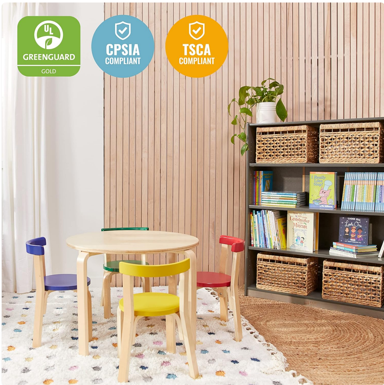
Image 1.4: The table and chairs set in a classroom or playroom setting, accompanied by badges indicating UL GREENGUARD Gold, CPSIA, and TSCA compliance, emphasizing product safety and environmental standards.