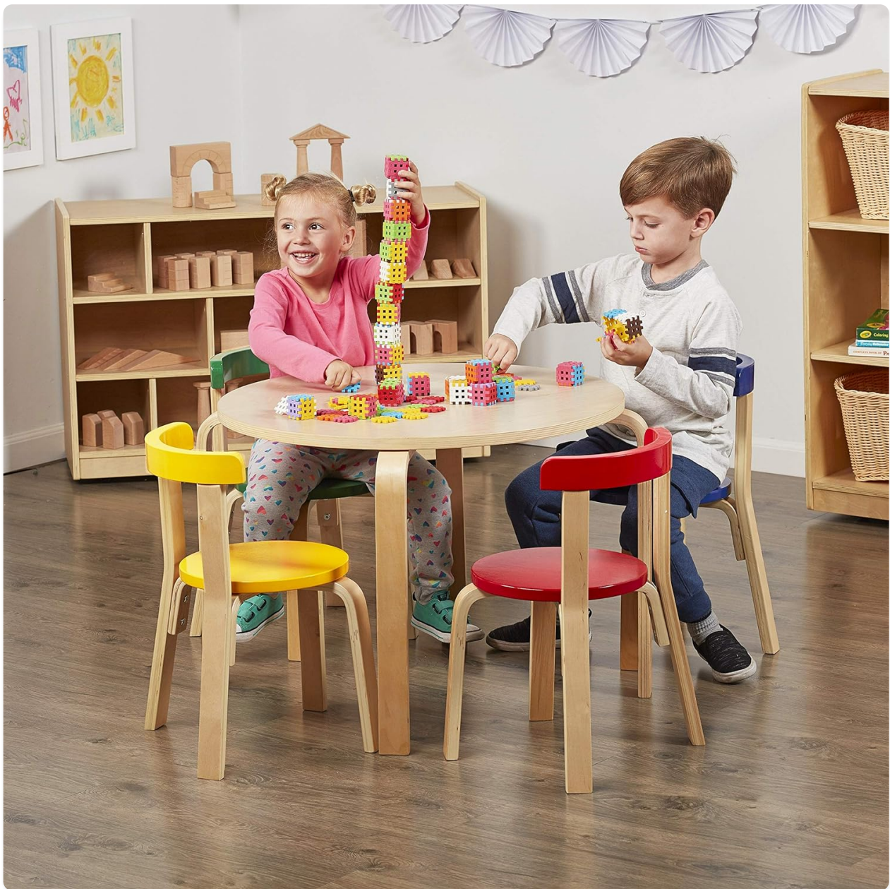
Image 4.2: Two children playing with colorful building blocks at the table, showcasing its suitability for collaborative play and various activities.