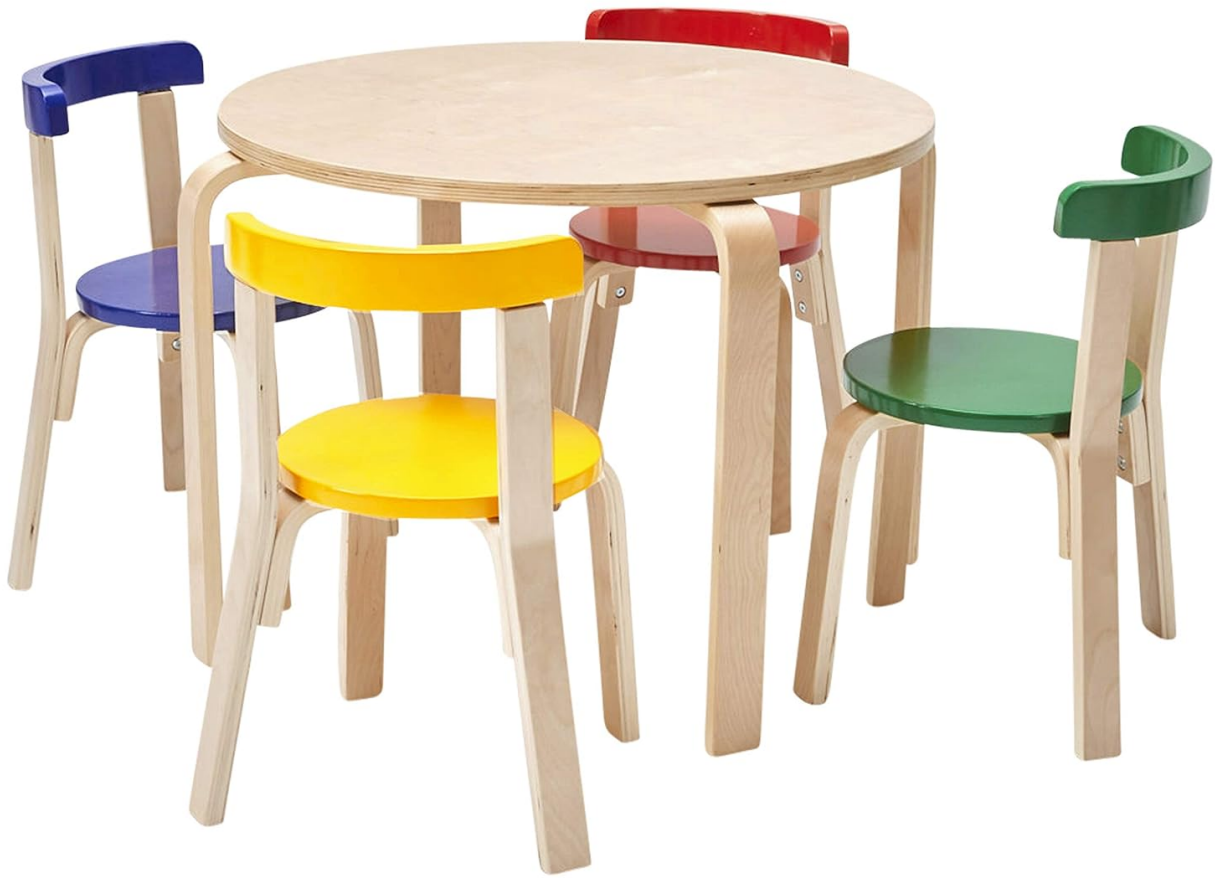
Image 1.1: The ECR4Kids Bentwood Table and Curved Back Chair Set, featuring a natural wood table and four chairs with blue, yellow, red, and green seats and backrests.