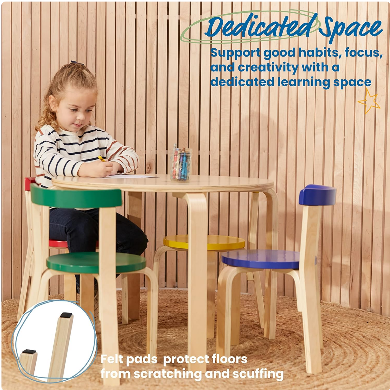
Image 4.1: A young girl engaged in drawing at the table, demonstrating how the set provides a dedicated space for creative and learning activities.