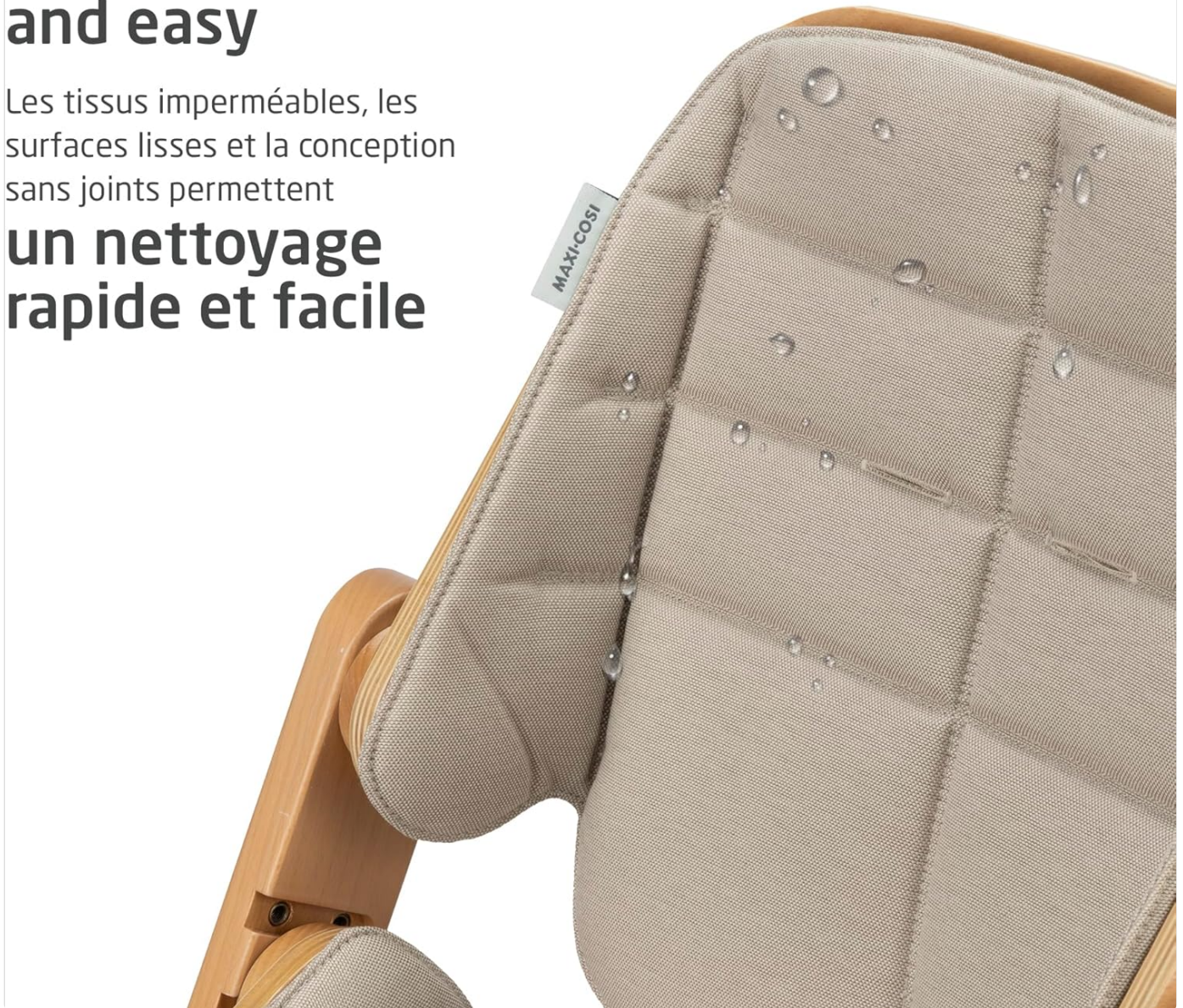
Figure 5.1: The water-repellent fabric of the Nesta high chair, designed to resist spills and simplify cleaning.