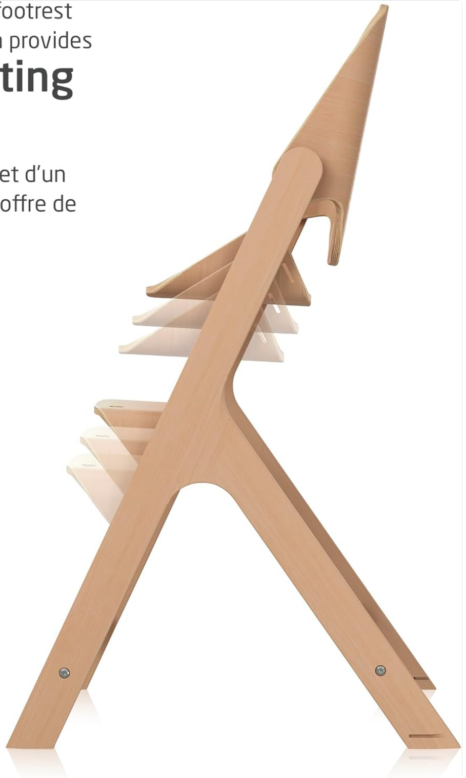
Figure 4.3: The adjustable footrest of the Nesta high chair, illustrating how it can be positioned to provide optimal support for different ages.