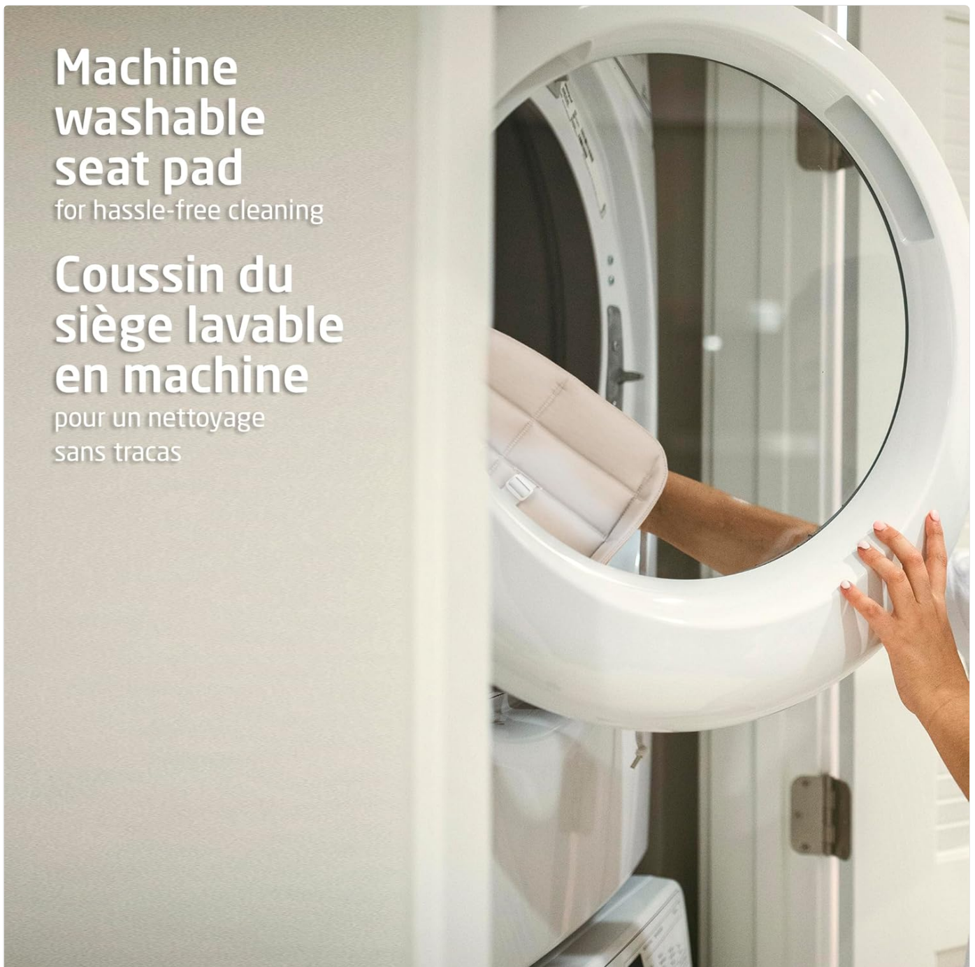
Figure 5.2: The machine-washable seat pad of the Nesta high chair, allowing for thorough and convenient cleaning.