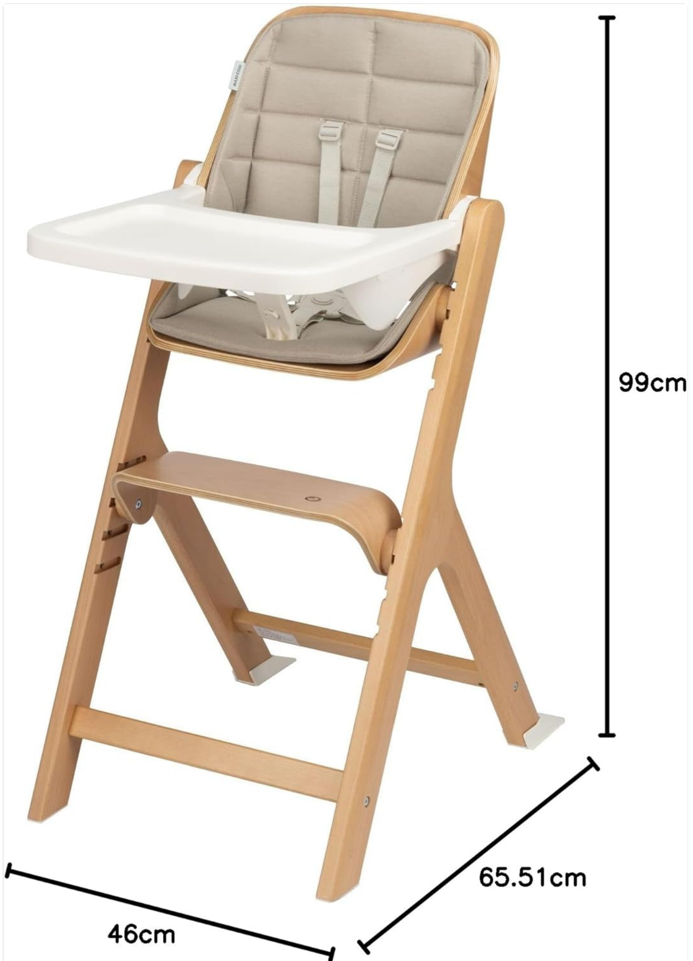
Figure 7.1: Key dimensions of the Nesta high chair for reference.