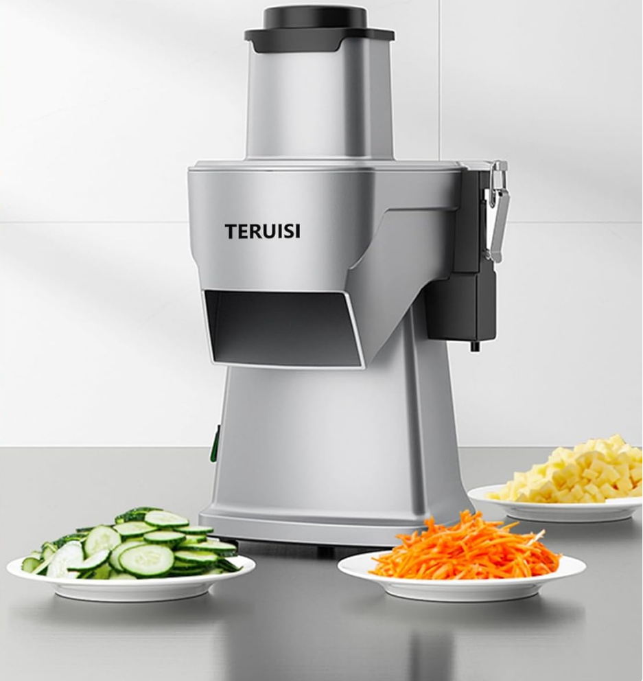
Image: A detailed view of the chopper's safety features, including the stainless steel safety clips, the design of the hidden blades for user protection, and the waterproof power switch, emphasizing safe operation.