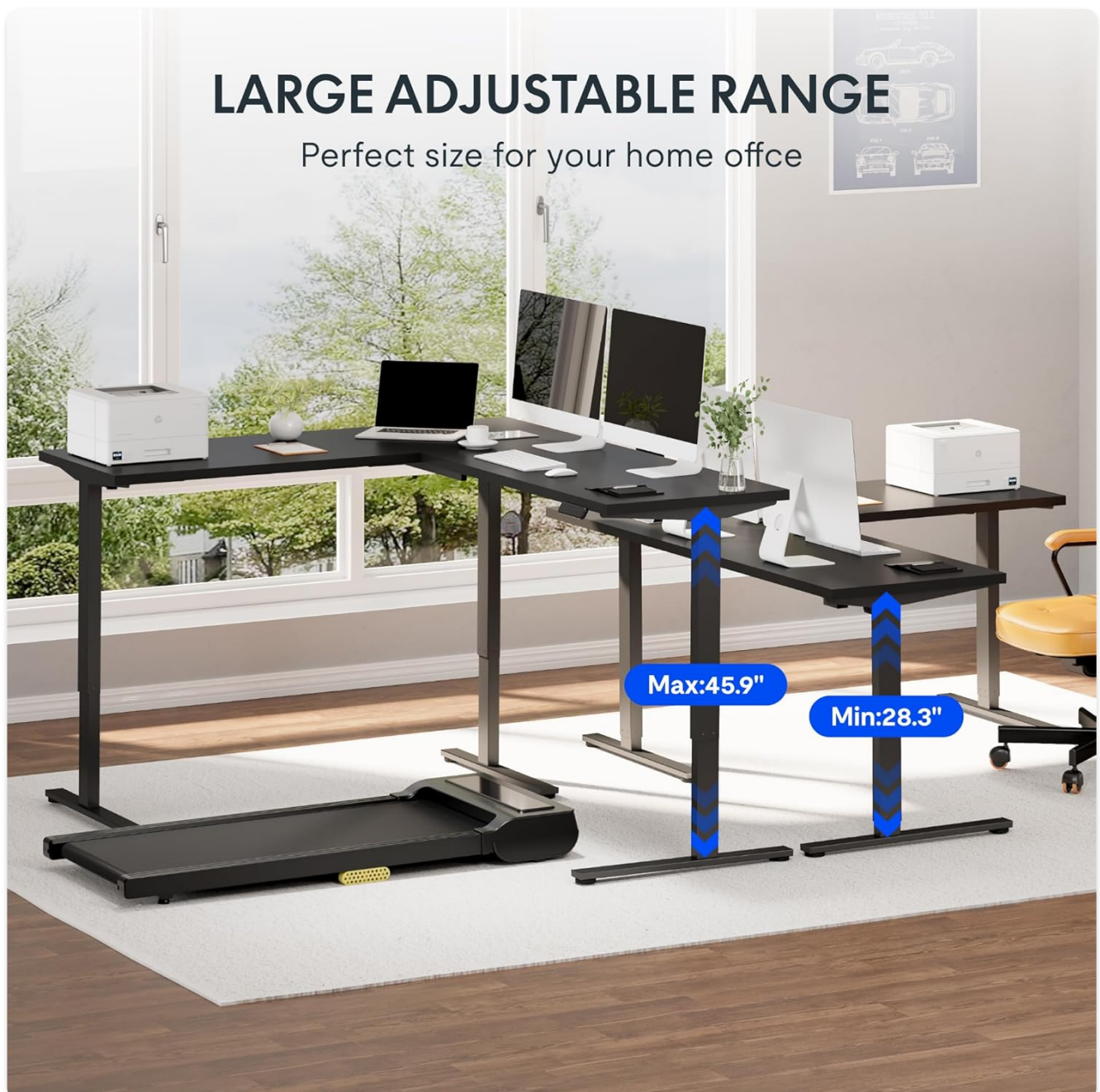
Figure 8: The desk's large adjustable height range.

Use the up and down arrow buttons on the LED control panel to adjust the desk to your desired height. The desk offers a large adjustable range, from a minimum height of 28.3 inches to a maximum height of 45.9 inches, accommodating both sitting and standing positions comfortably.