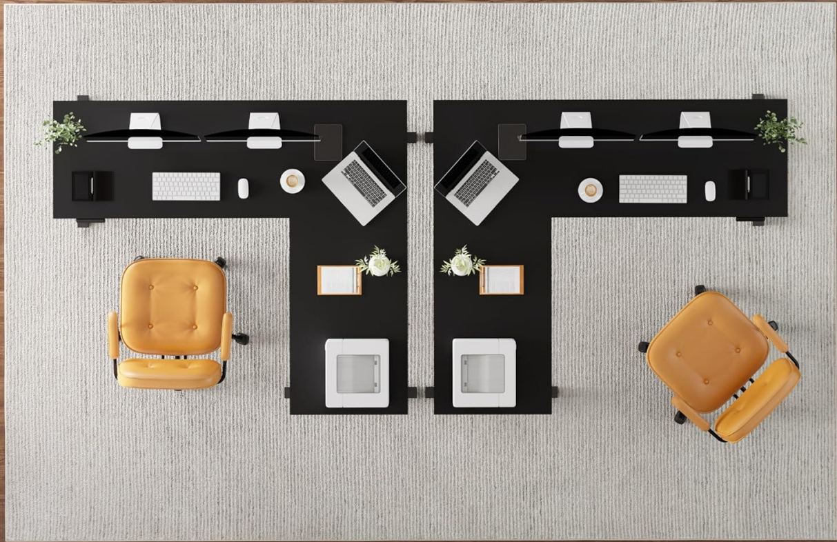
Figure 4: The desk's flexible right/left orientation options.

L-shaped standing desk can be left-sided or right-sided, allowing for even more flexibility