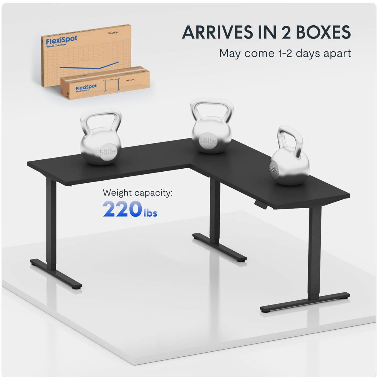
Figure 5: Demonstration of the desk's 220 lbs weight capacity.