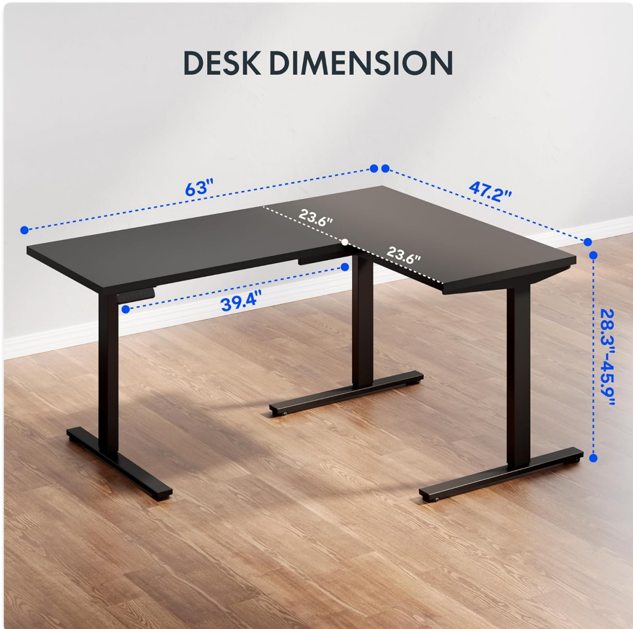
Figure 2: Detailed dimensions of the L-shaped desktop and height range.

The expansive L-shaped work surface is seamlessly crafted with environmentally sourced splice board, measuring 63.0" x 47.2". It provides ample space for ongoing projects and office supplies. The desktop is 1 inch thick, providing a commercial-grade surface suitable for monitor mounts.