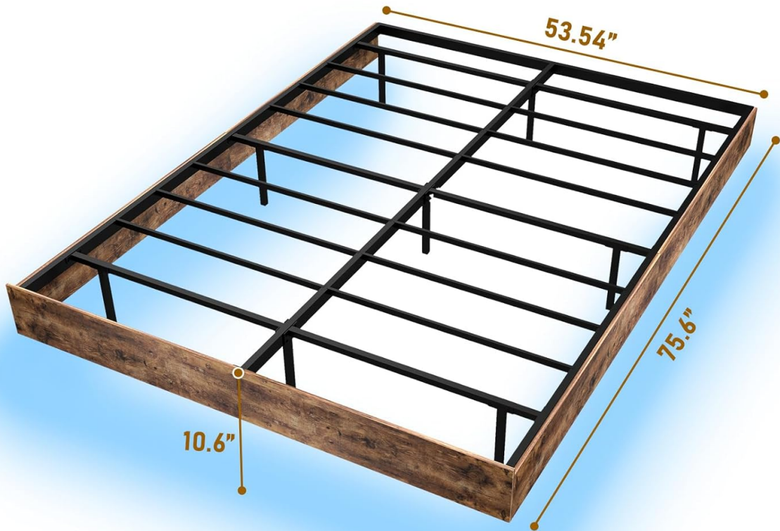
Image: A diagram illustrating the full size dimensions (L x W x H) and weight capacity of the bed frame.