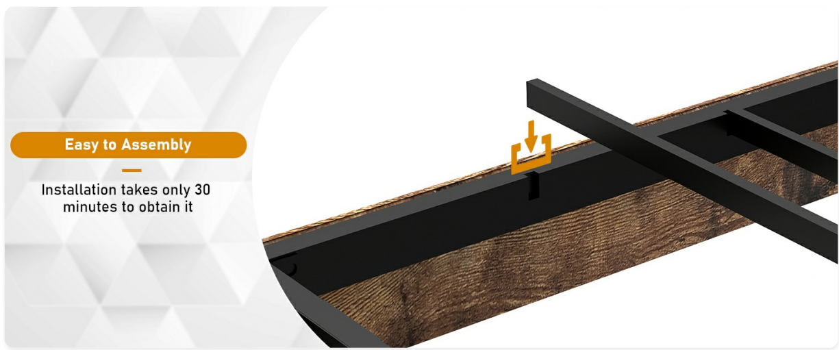
Image: A close-up view of a connection point on the bed frame, illustrating the easy assembly process with U-shaped grooves.