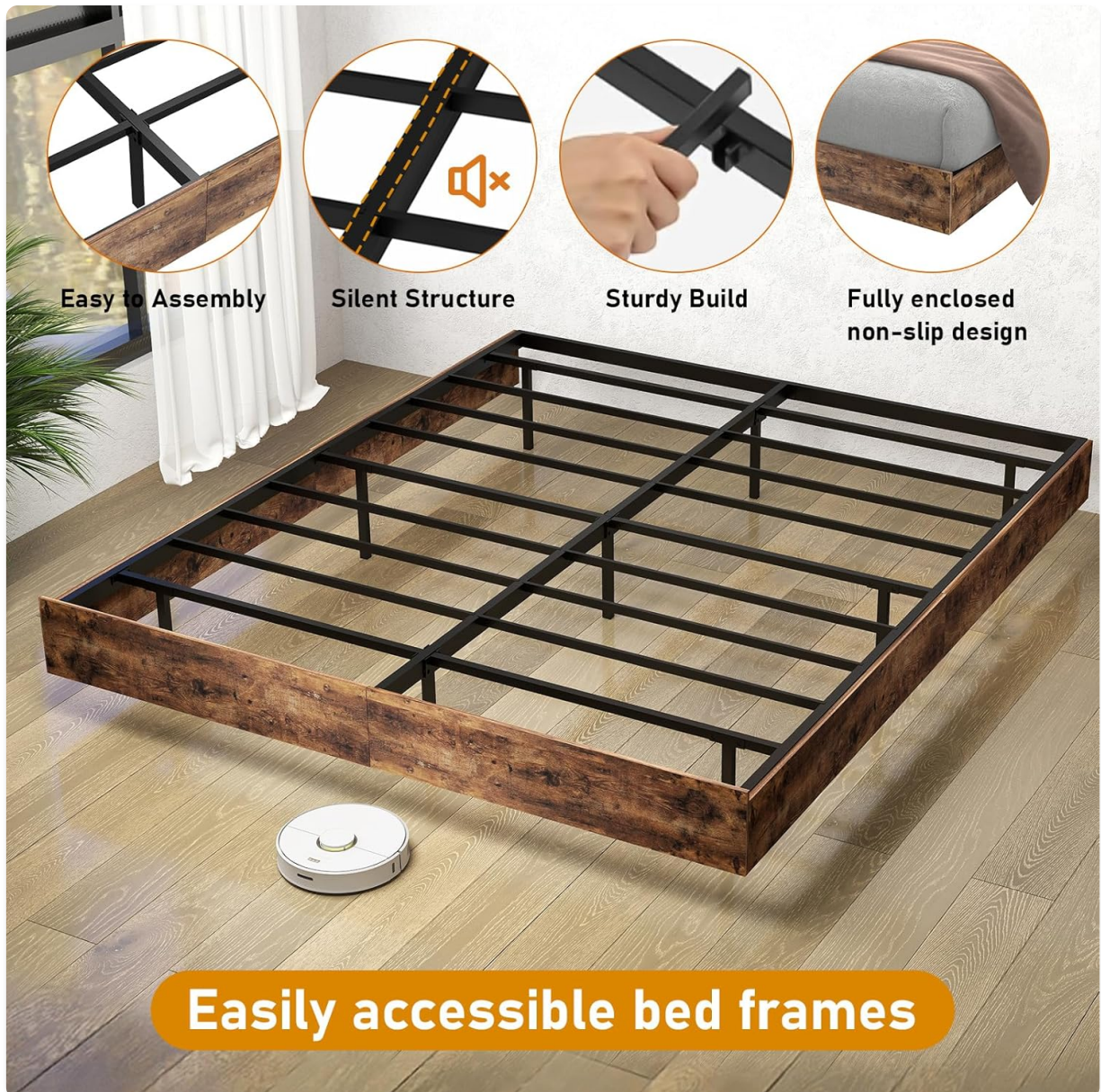
Image: Internal structure of the RVONOW Floating Bed Frame, highlighting the metal slats and support legs for stability.