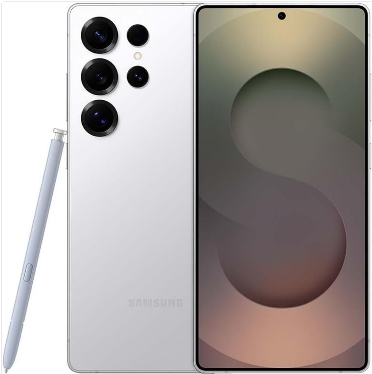
Image 1.1: Front and back view of the SAMSUNG Galaxy S25 Ultra, showcasing its design and the included S Pen.