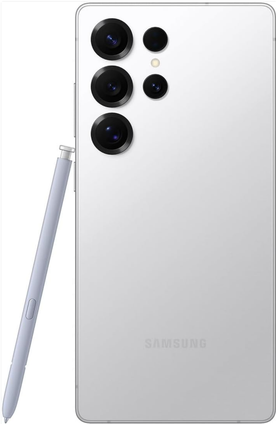
Image 2.1: Back view of the SAMSUNG Galaxy S25 Ultra, highlighting the camera module and S Pen slot.