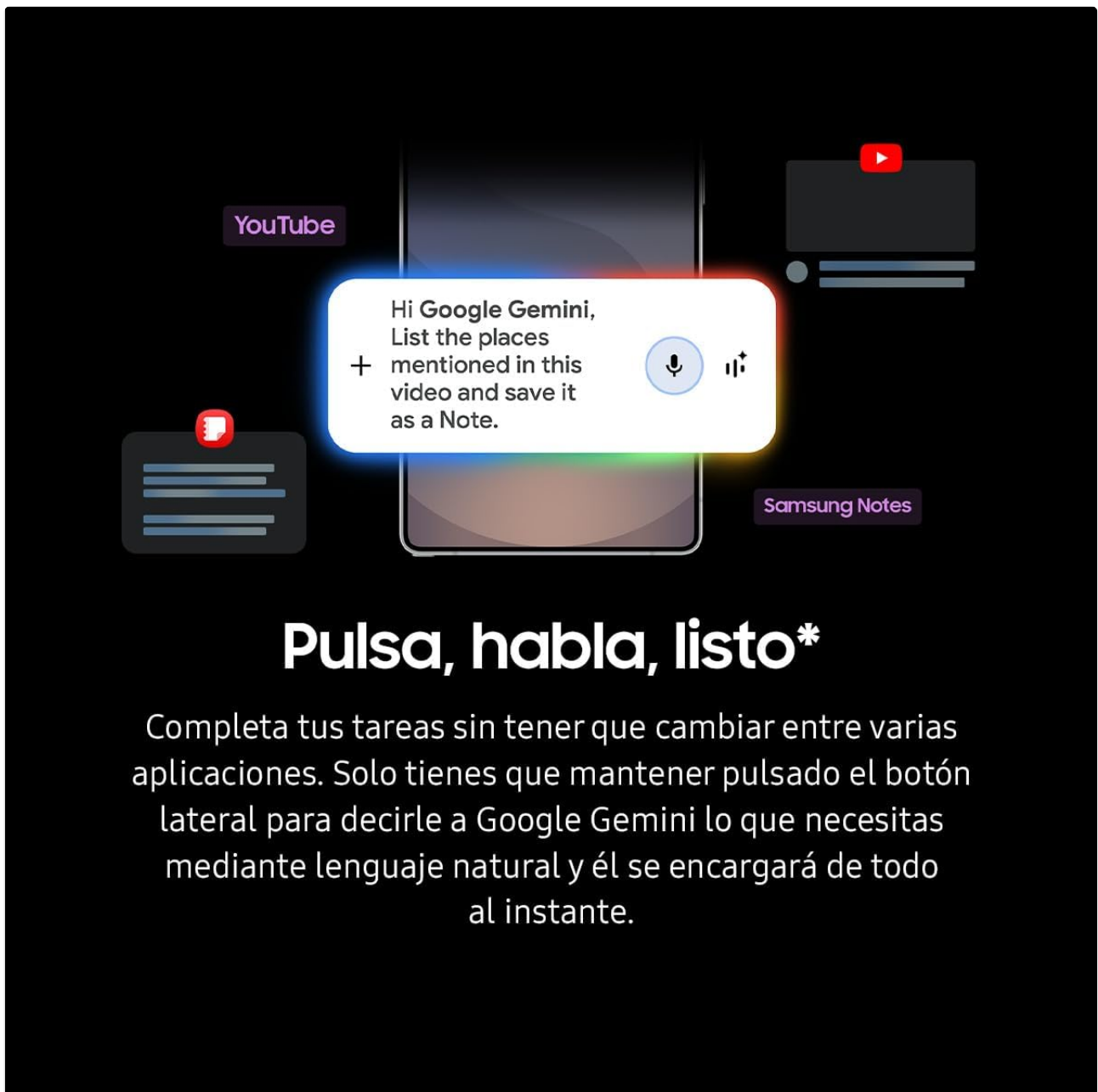
Image 3.1: Illustration of the AI feature, allowing users to interact with Google Gemini by pressing and holding the side button to complete tasks without switching applications.