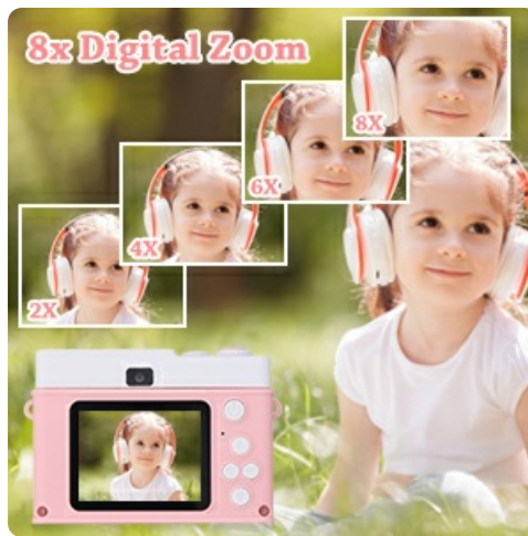
Image: Visual representation of the 8X digital zoom capability.