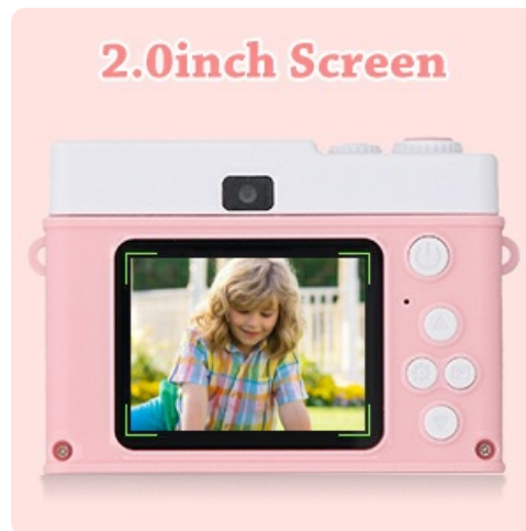
Image: The camera's 2.0-inch TFT HD screen, which restores real colors for charming pictures.