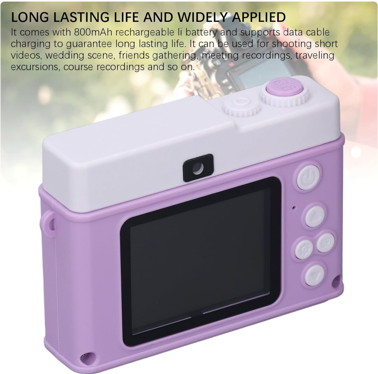
Image: Rear view of the GOWENIC Compact Digital Camera, highlighting the screen and control layout.

It comes with 800mAh rechargeable li battery and supports data cable charging to guarantee long lasting life. It can be used for shooting short videos, wedding scene, friends gathering, meeting recordings, traveling excursions, course recordings and so on.