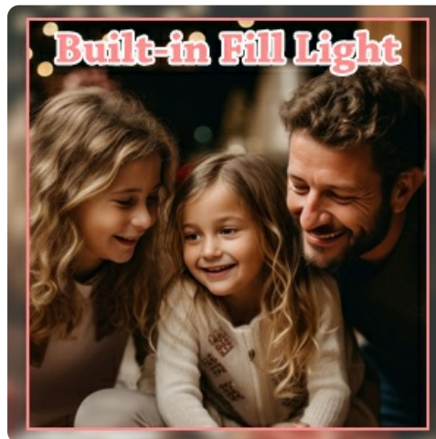
Image: The built-in fill light enhances visibility in dark environments.