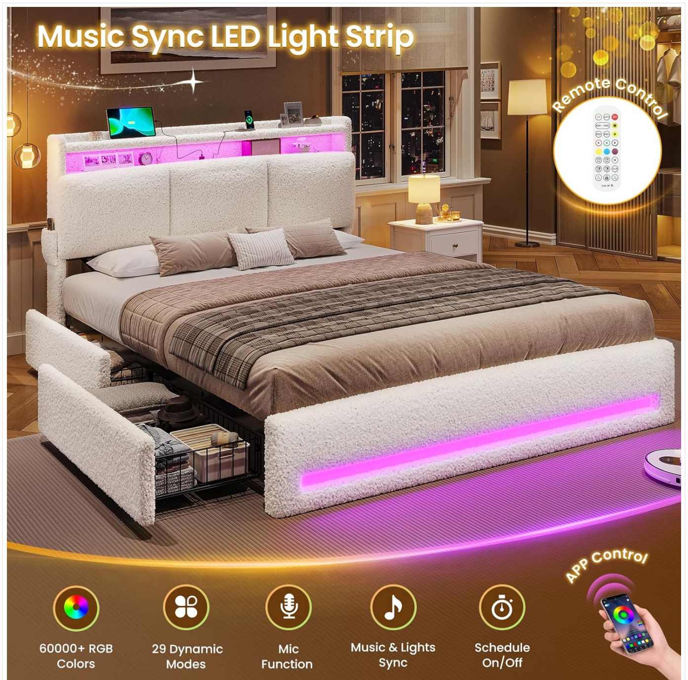
Image: The bed frame with its Music Sync LED Light Strip, highlighting remote and app control options, 60,000+ RGB colors, and dynamic modes.