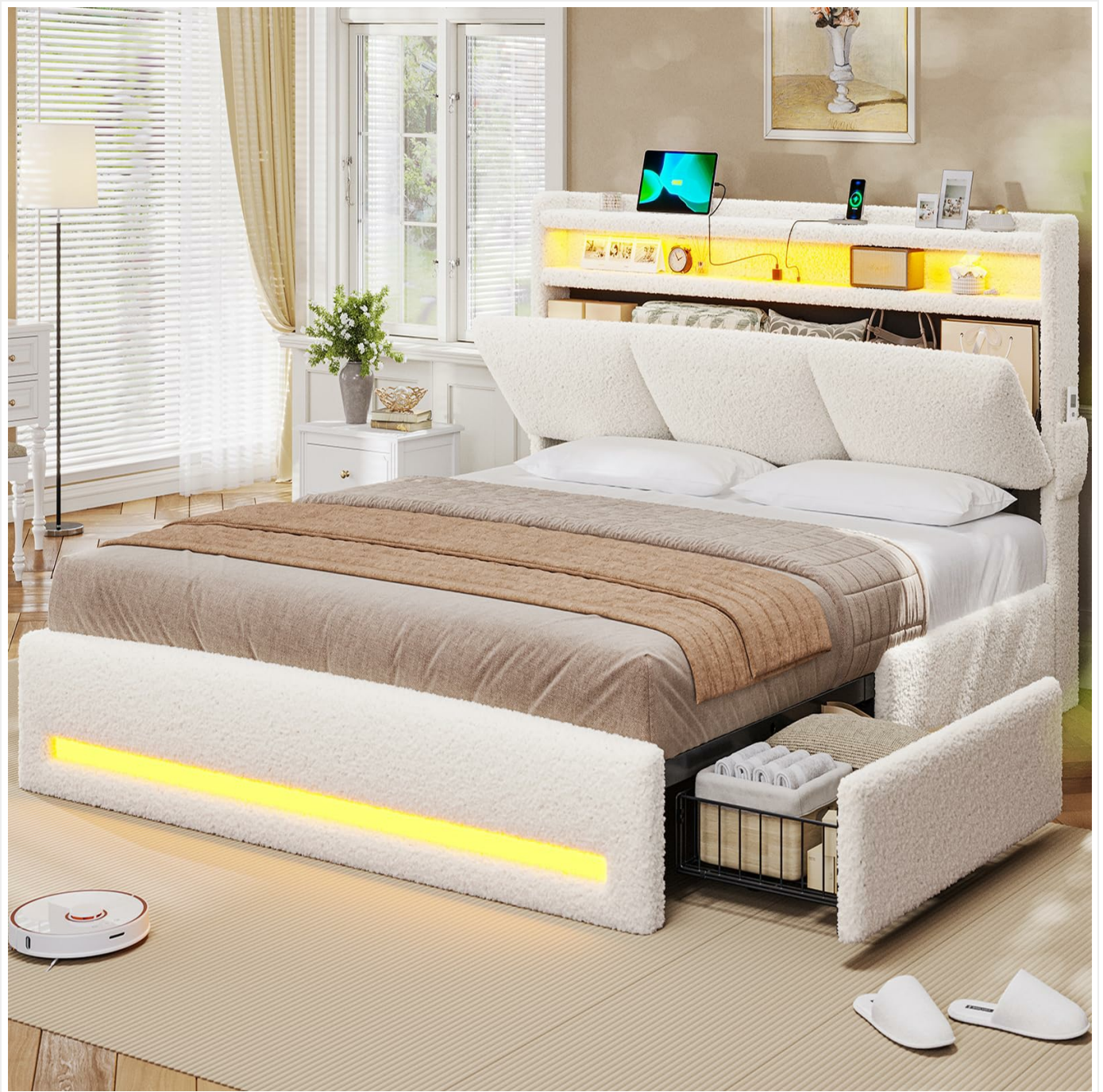
Image: Overview of the VIAGDO Queen Boucle Upholstered Bed Frame in cream white.