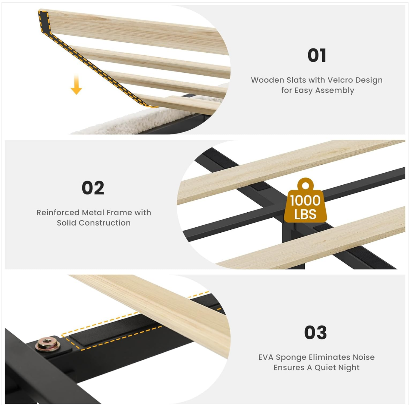
Image: Illustration of wooden slats with Velcro for easy assembly, reinforced metal frame for stability, and EVA sponge for noise elimination.