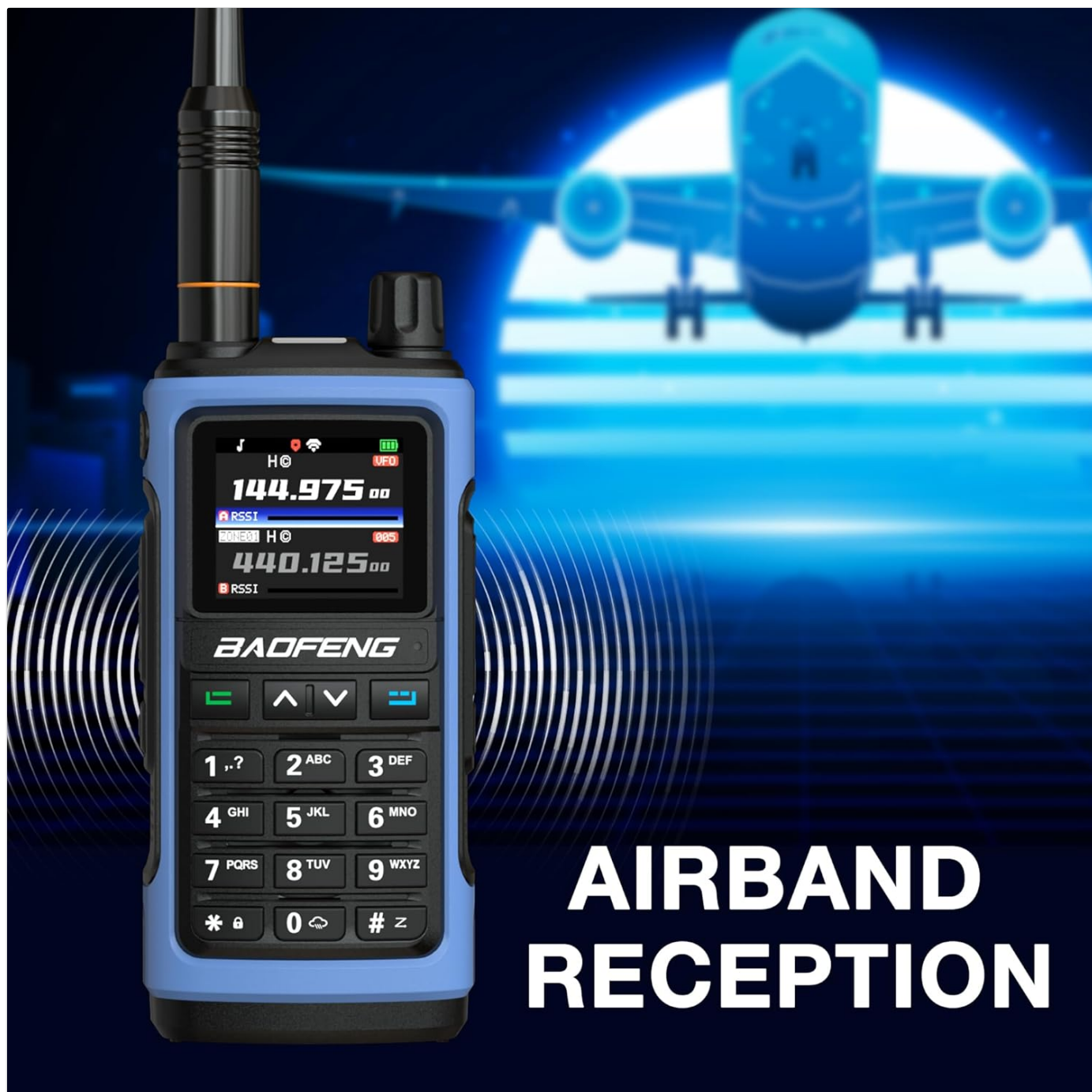
Figure 6: Airband reception capability of the UV-7B.