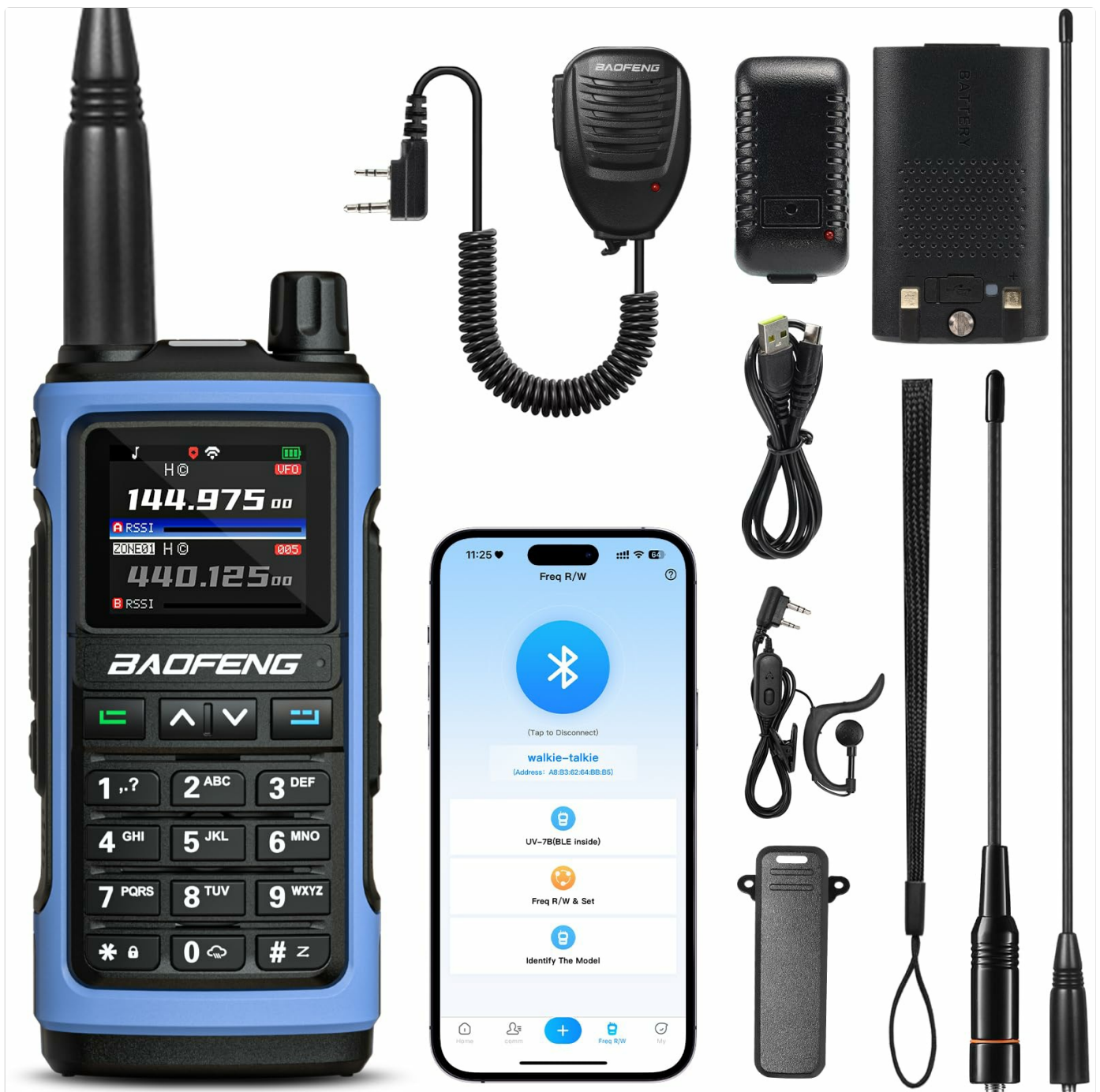
Figure 2: Navigating channels and frequencies on the UV-7B display.