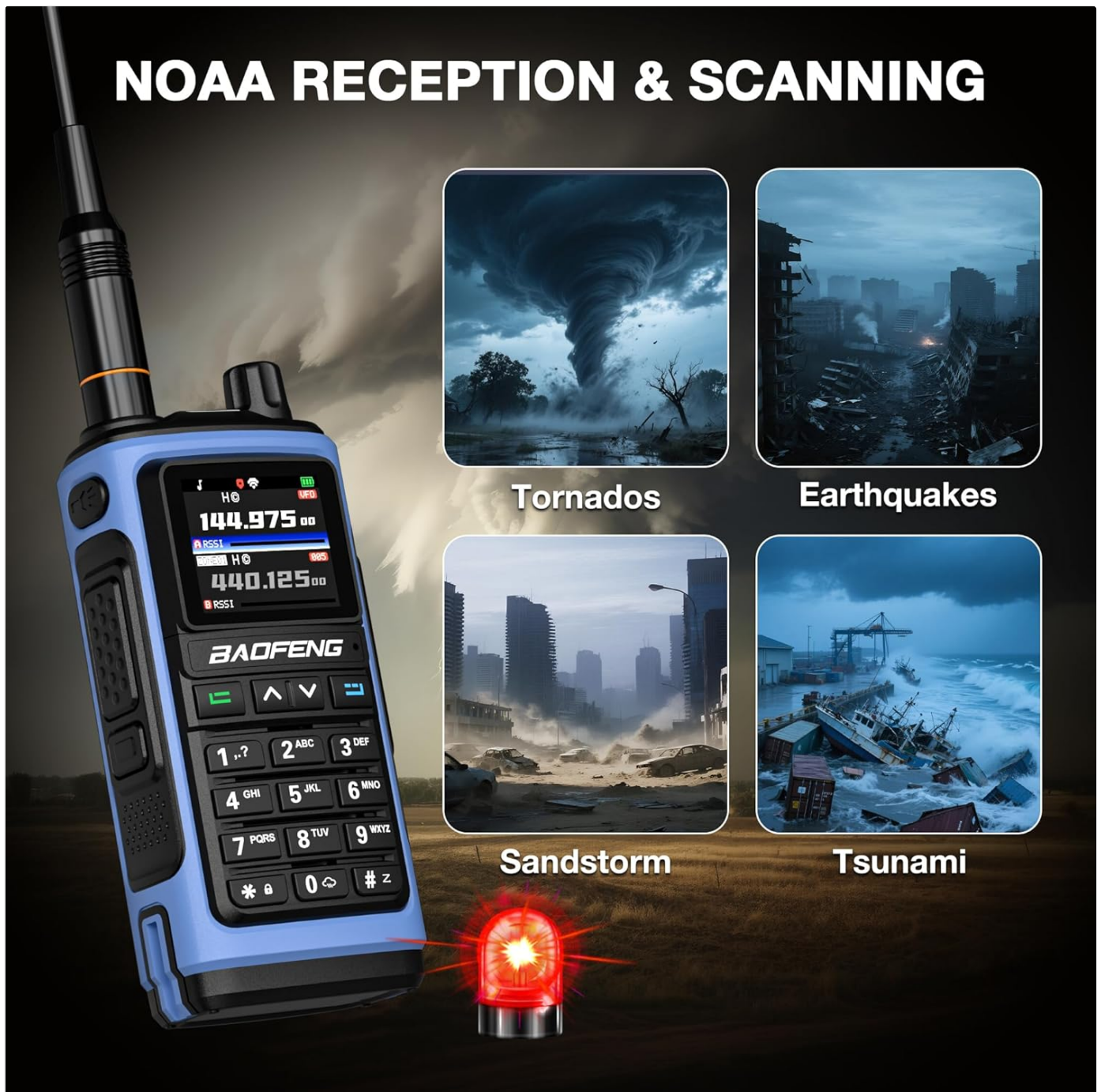
Figure 7: NOAA weather reception for emergency preparedness.