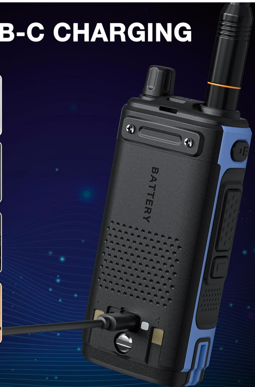
Figure 8: USB-C charging options for the UV-7B.