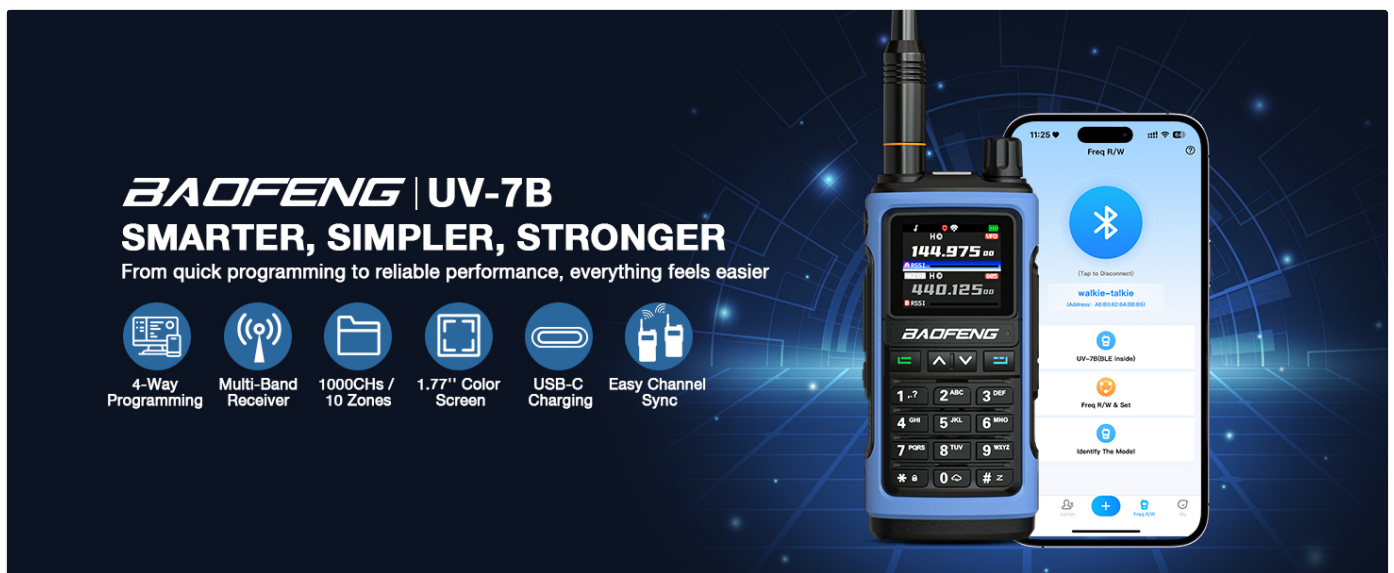
Figure 4: Overview of available programming methods.