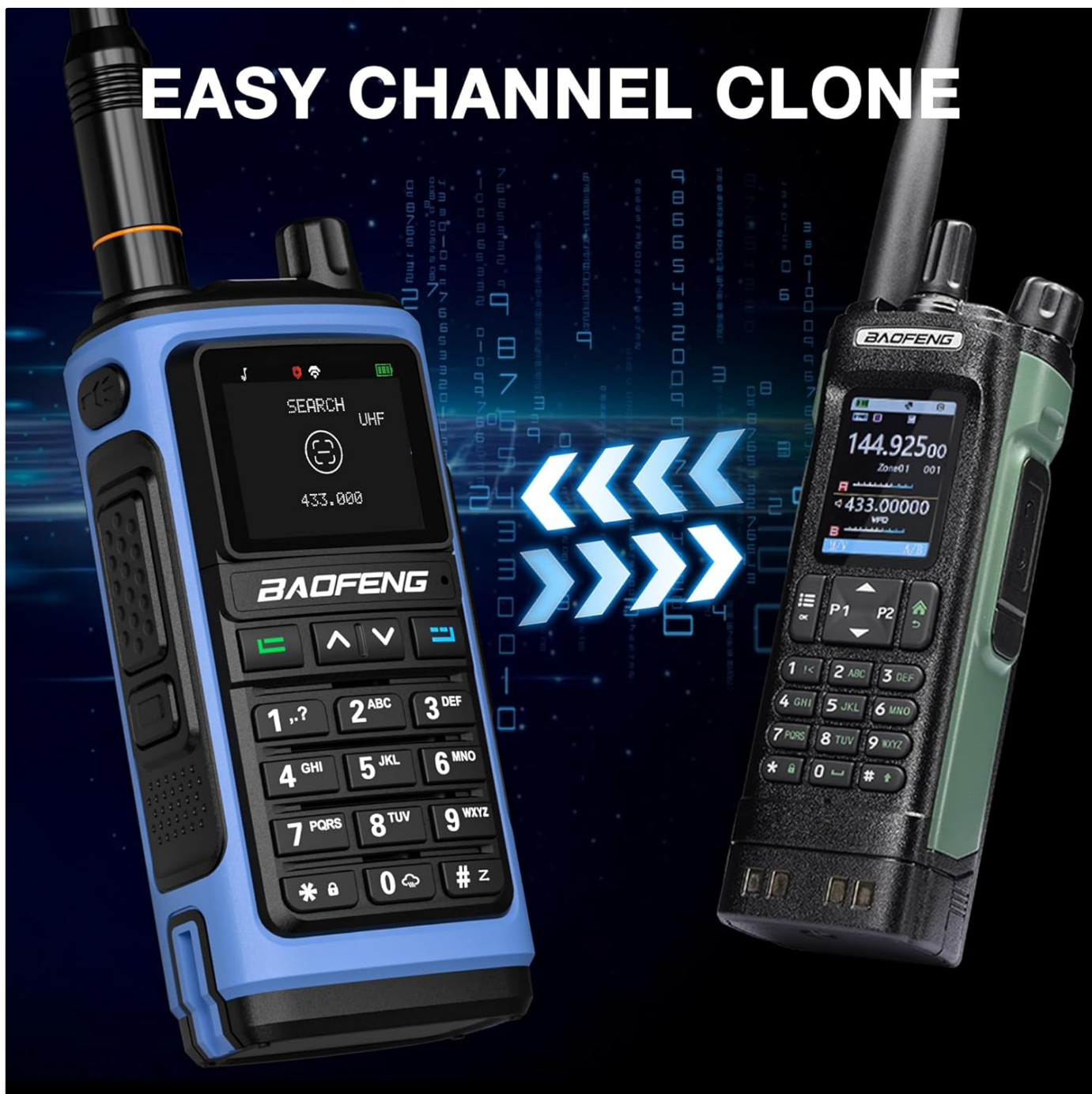
Figure 5: Demonstrating the easy channel copy feature.