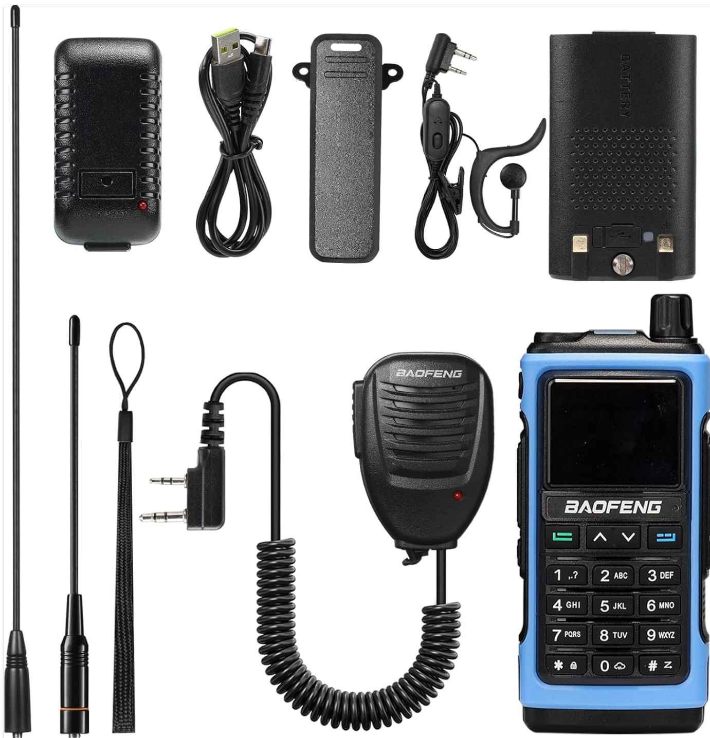
Figure 1: Included components of the BAOFENG UV-7B package.