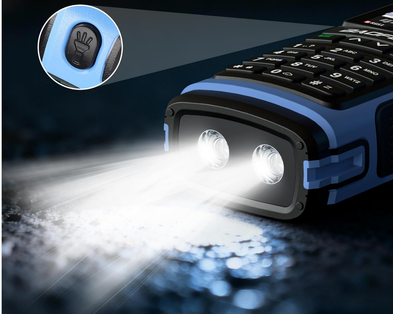
Figure 3: The integrated LED flashlight in operation.