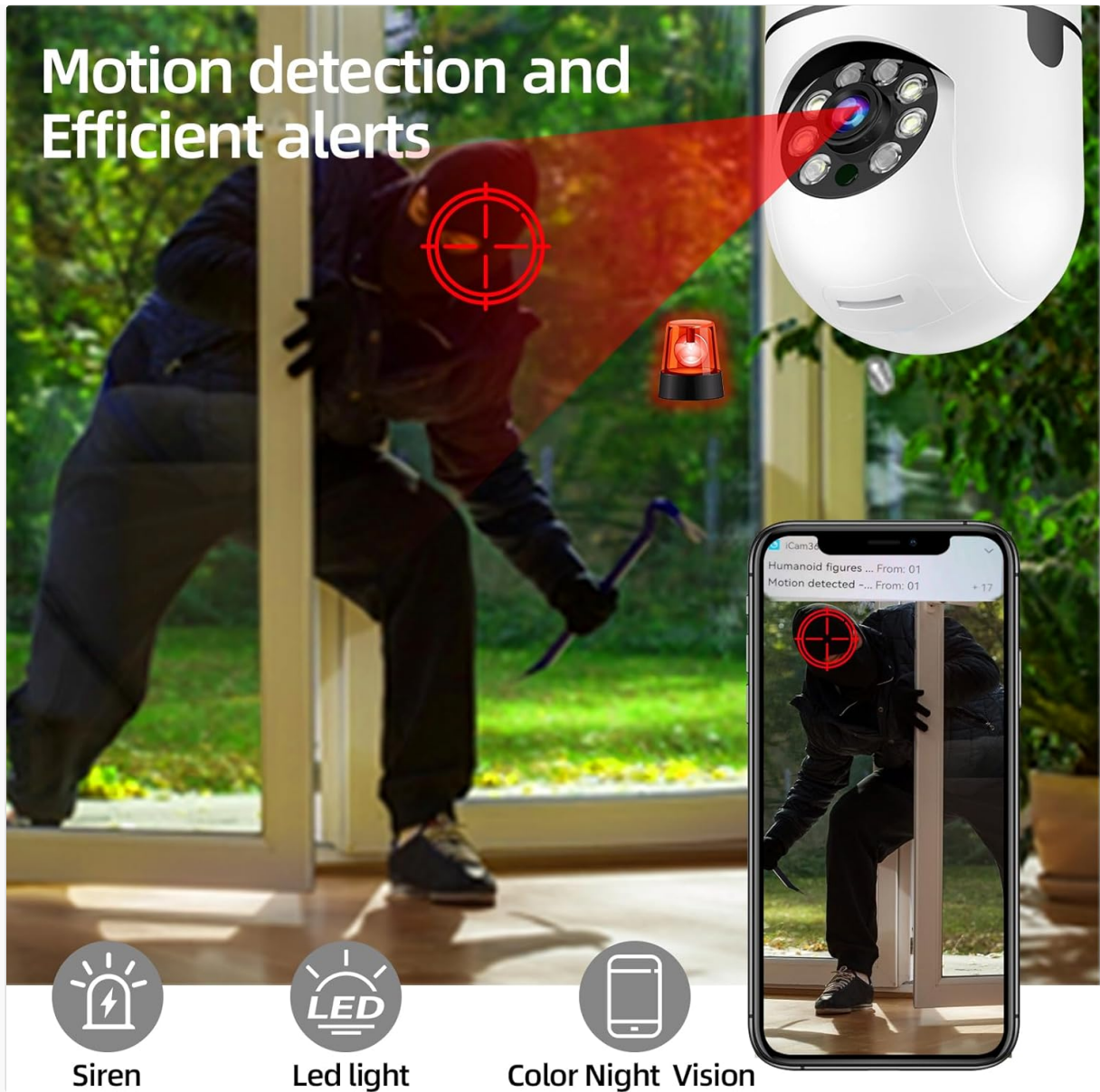
Figure 6.3: Motion Detection and Efficient Alerts.

This image illustrates the camera's motion detection capabilities, showing how it identifies movement and triggers alerts, including siren, LED light, and color night vision, with notifications sent to a smartphone.