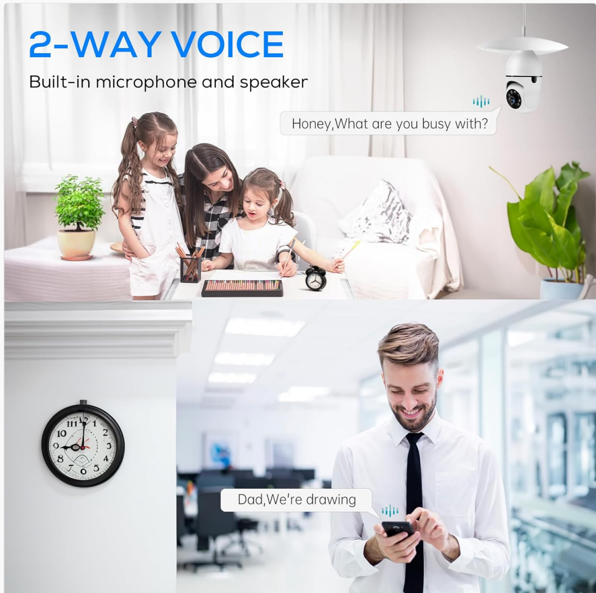
Figure 6.1: Two-Way Voice Communication Feature.

The camera features a built-in microphone and speaker, enabling real-time two-way audio communication. This allows you to speak with visitors or family members through the camera via the iCam365 app, and hear their responses.