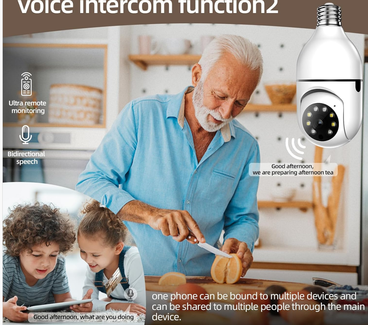
Figure 6.2: Remote Control and Multi-User Sharing.

This image highlights the camera's remote control and two-way voice intercom capabilities, along with the ability to bind multiple devices to one phone and share access with multiple users.