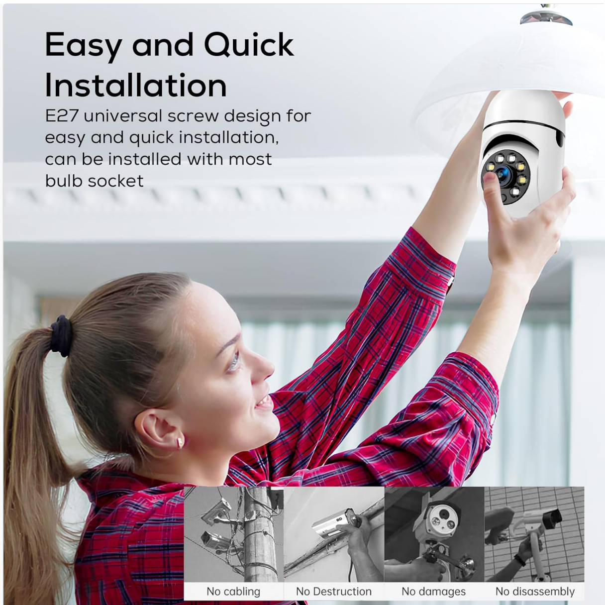
Figure 5.1: Easy and Quick Installation into an E27 Socket.

E27 universal screw design for easy and quick installation, can be installed with most bulb socket