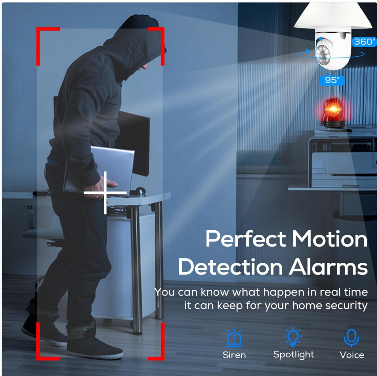
Figure 6.4: Perfect Motion Detection Alarms.

This image visually represents the camera's precise motion detection, showing how it identifies activity and can trigger alarms, spotlights, or voice alerts to enhance home security.