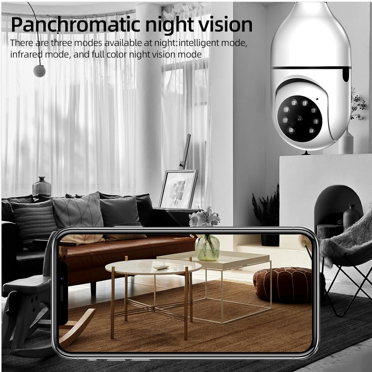
Figure 6.5: Panchromatic Night Vision.

There are three modes available at night: intelligent mode, infrared mode, and full color night vision mode