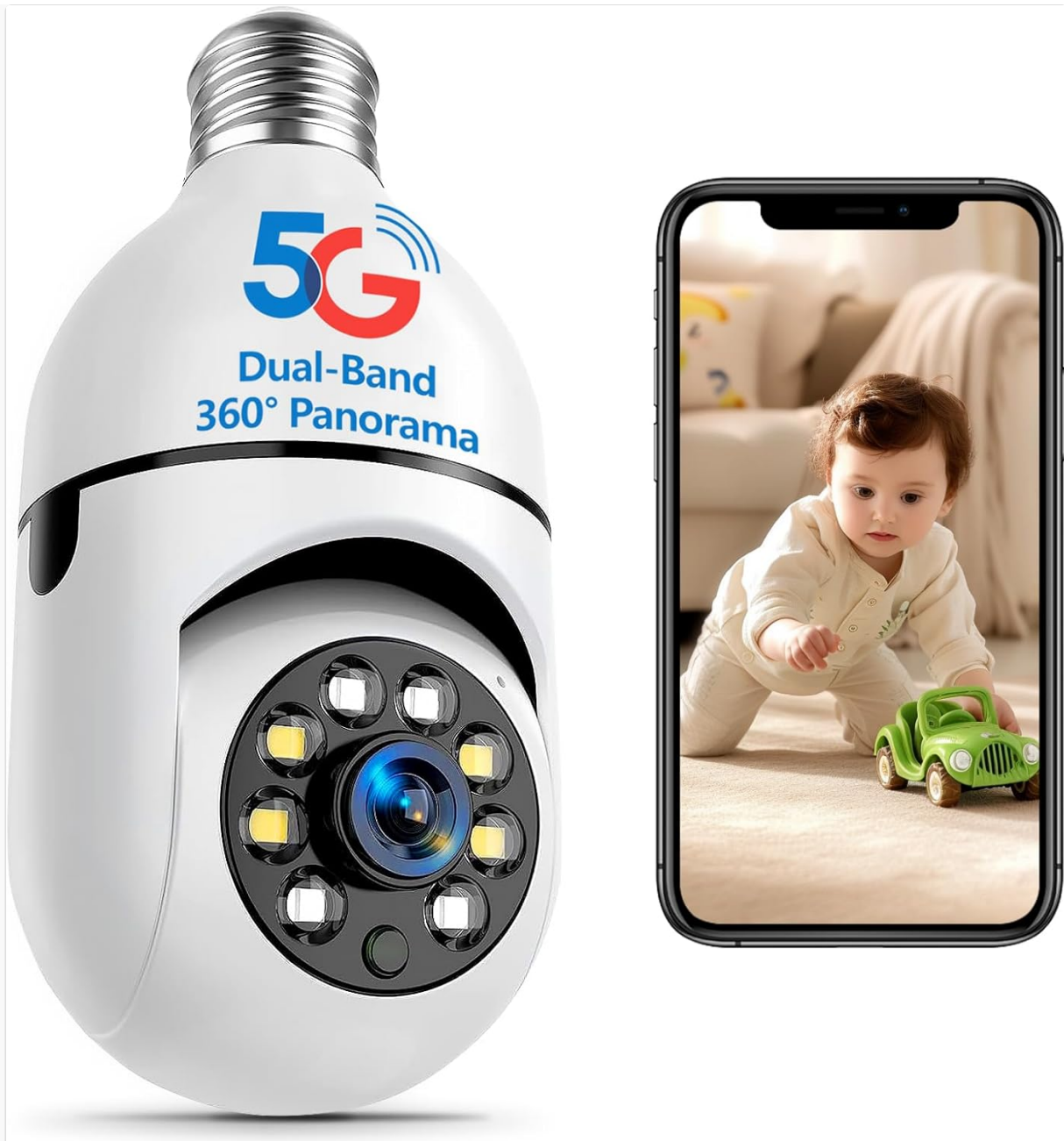
Figure 4.2: QAMY Light Bulb Security Camera and Live View on Smartphone.

This image illustrates the camera's design, highlighting its 5G dual-band capability and 360-degree panoramic view, alongside a smartphone showing a live feed, demonstrating its remote monitoring feature.