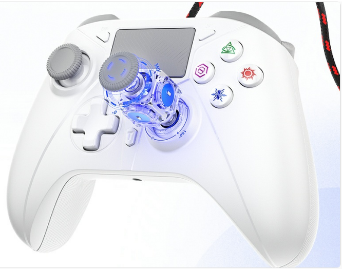
Image: This image details the new joystick design, engineered for improved accuracy and reduced errors during gameplay.

The newly designed joystick provides better accuracy and reduces errors.