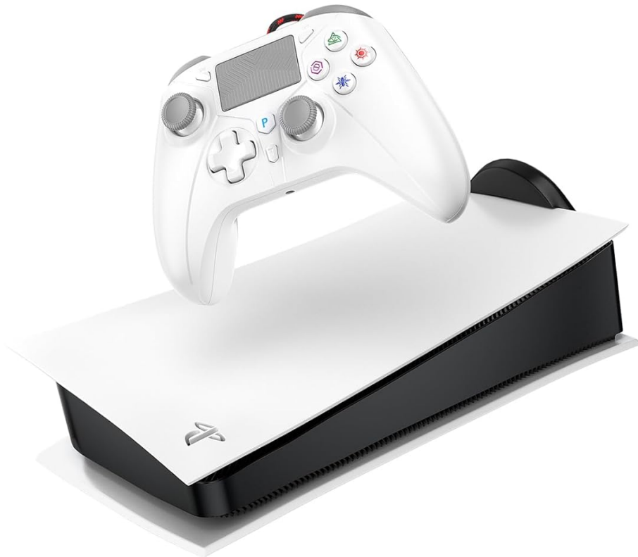
Image: Dinosoo wired controller connected to a PlayStation 5 console, emphasizing the critical setting change required on the PS5 to 'Use USB Cable' for proper functionality.

Setting path: Enter the PS5 system settings > Accessories > Controller (General) > Communication Metho > Use USB Cable