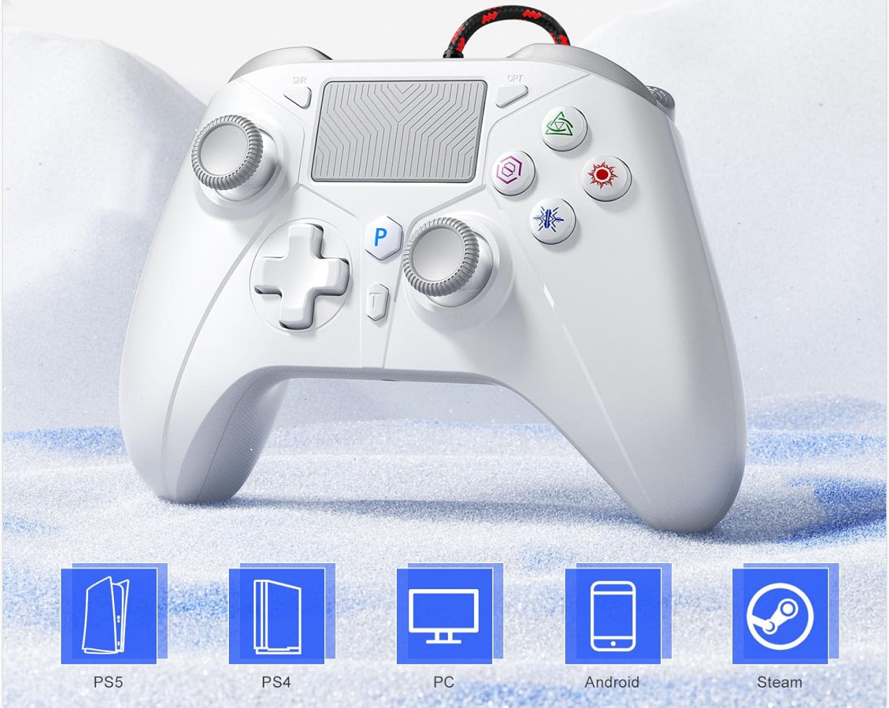
Image: This image illustrates the broad compatibility of the Dinosoo wired controller, showing icons for PlayStation 5, PlayStation 4, PC, Android, and Steam, highlighting its plug-and-play functionality.

No Space Constraint with the 10 ft Cable