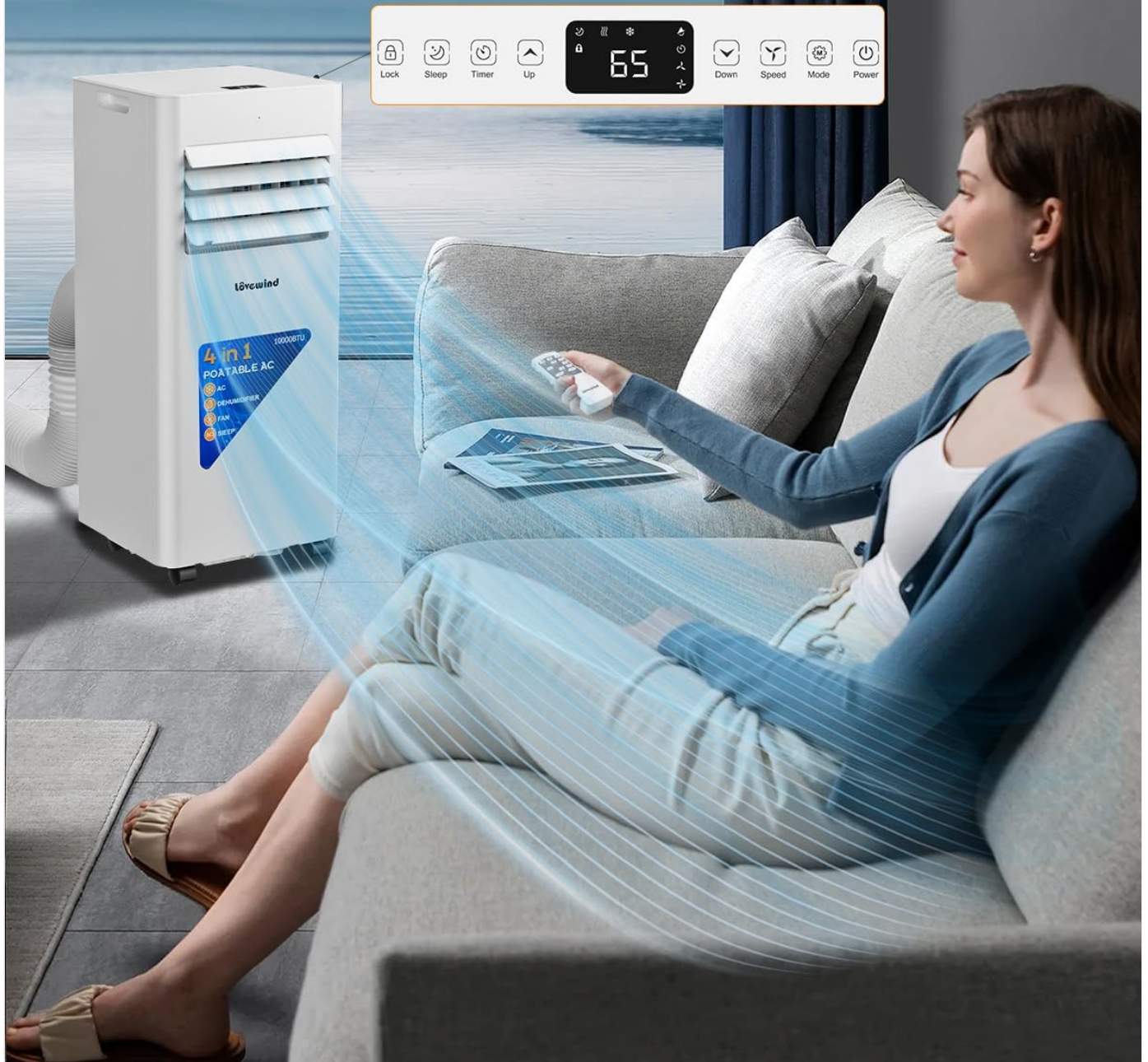
Figure 7: Depiction of the two control methods for the Lovewind portable air conditioner: the 50M infrared remote control and the intuitive touch panel control on the unit itself.

50M Infrared Remote Control & Touch Panel Control