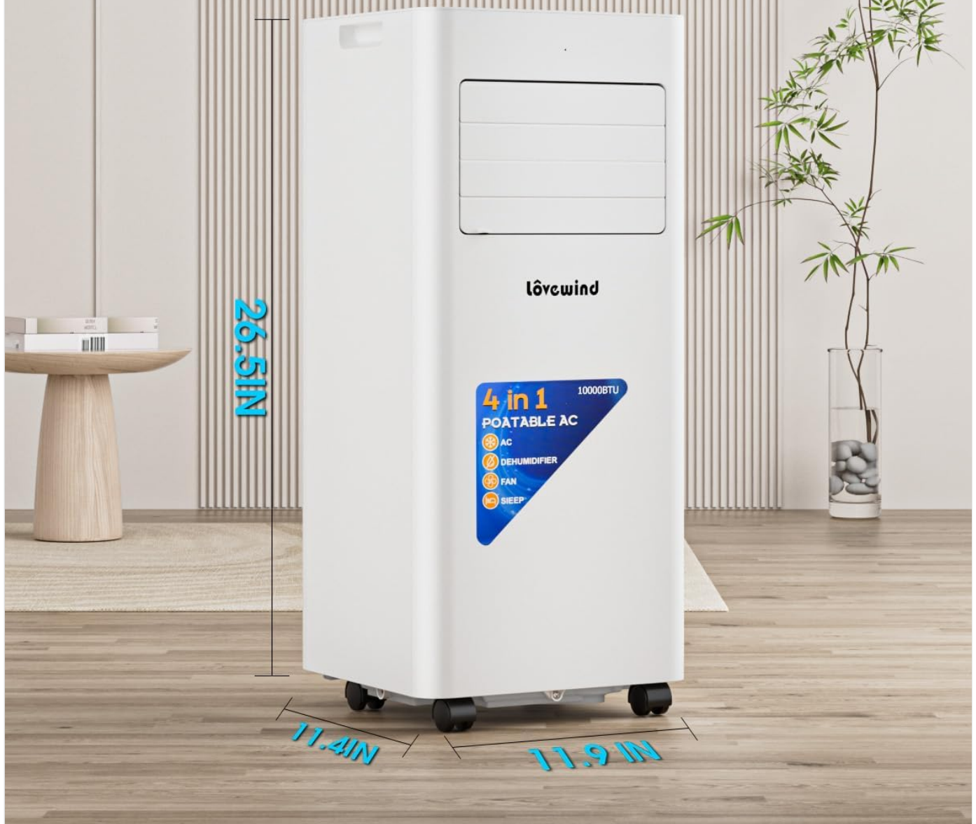
Figure 2: Detailed dimensions of the Lovewind portable air conditioner, showing its height, width, and depth, along with the lengths of the power cord, exhaust pipe, and drain pipe.

Power cord length: 70.9 IN Exhaust pipe length: 39.37 IN Drain pipe length: 25.6 IN Weight: 48.5 LB