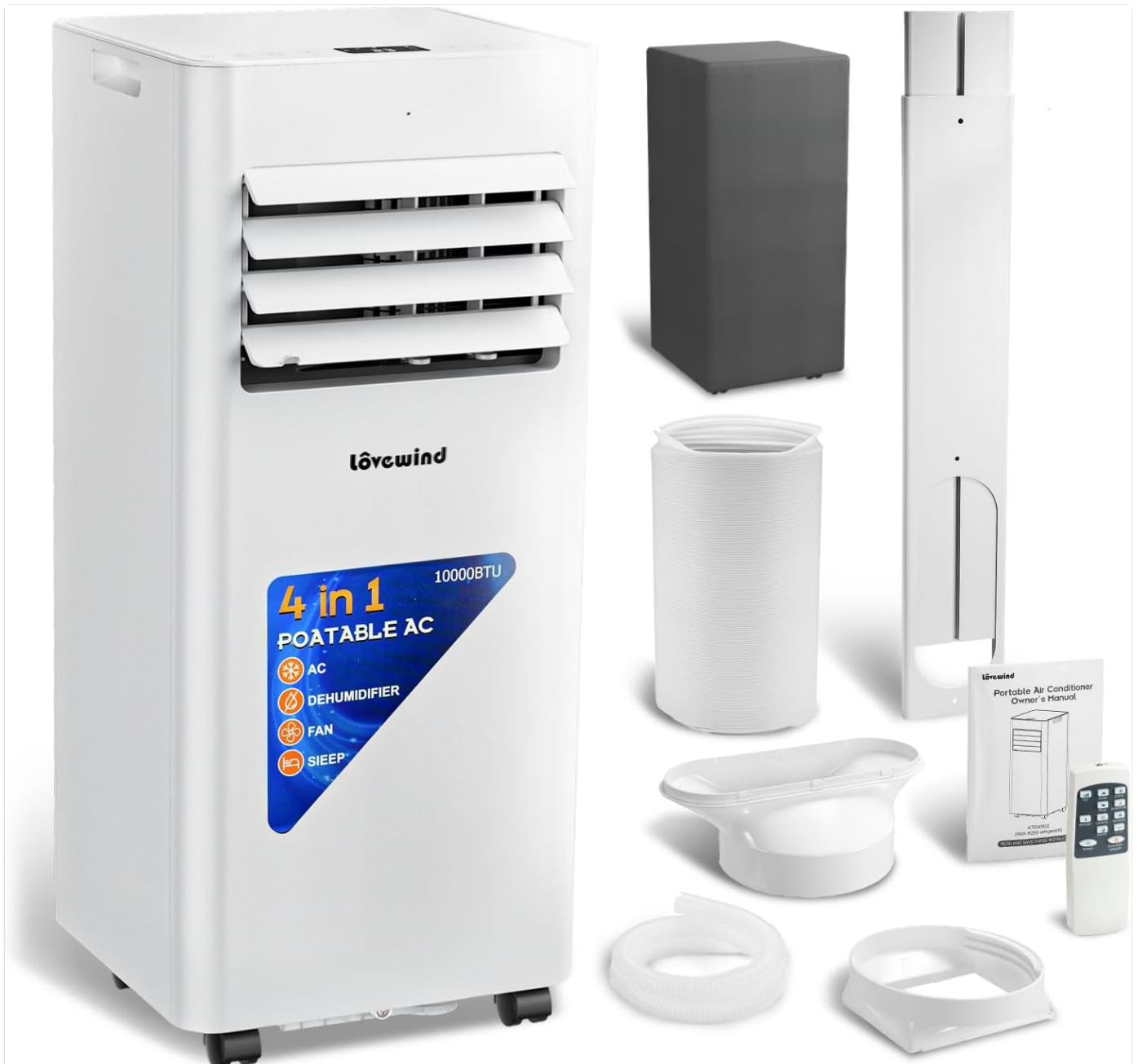
Figure 1: The Lovewind portable air conditioner shown with all its included components, including the main unit, exhaust hose, window kit, remote control, and drain pipe.