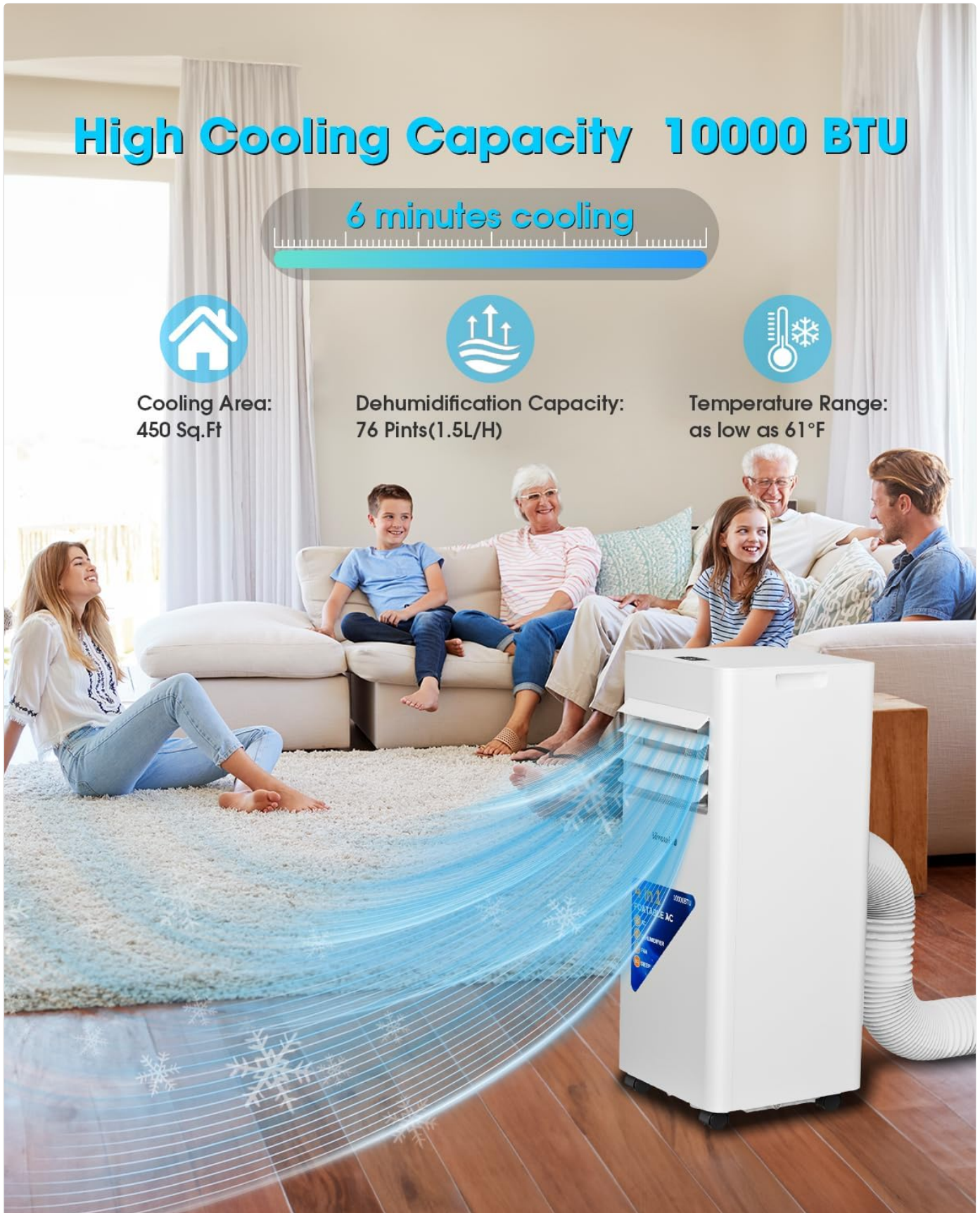
Figure 3: An illustration demonstrating the high cooling capacity of the 10,000 BTU Lovewind portable AC, showing its effectiveness in cooling a living room area of up to 450 sq. ft. and its dehumidification capability.