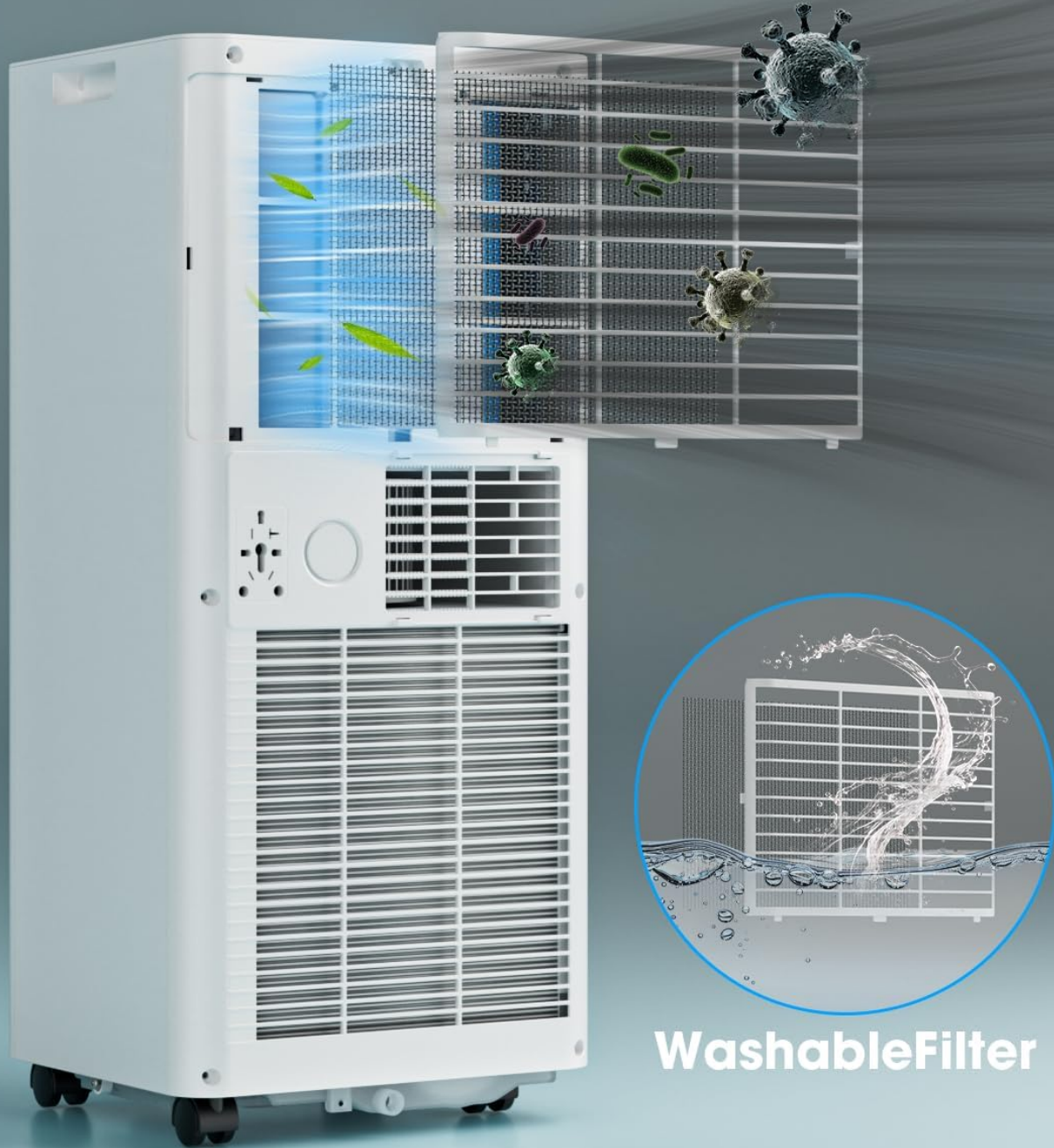
Figure 8: Illustration of the double high-density filtration system in the Lovewind portable air conditioner, showing how the washable filter blocks hair and large dust particles for improved air quality.