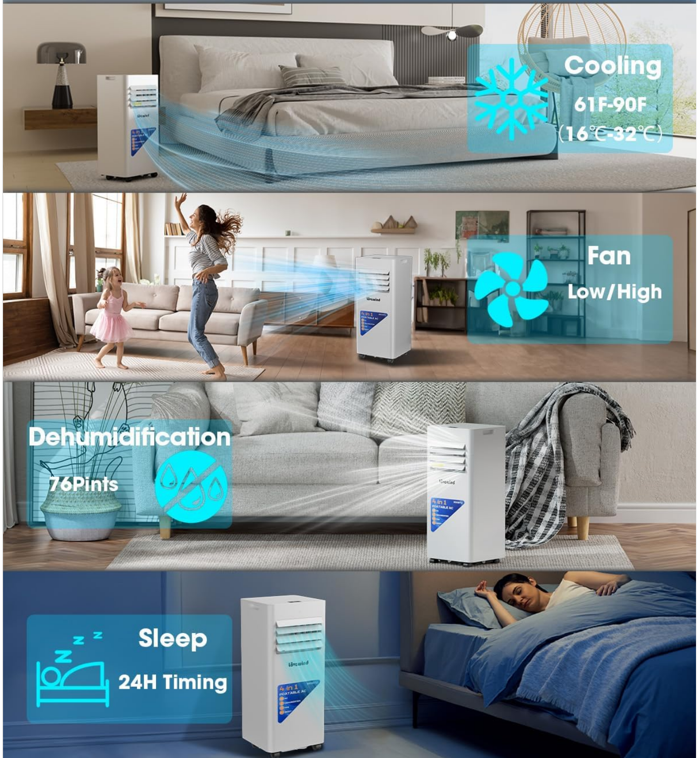
Figure 4: Visual representation of the four operating modes of the Lovewind portable air conditioner: Cooling, Fan, Dehumidification, and Sleep mode, illustrating their respective functions.