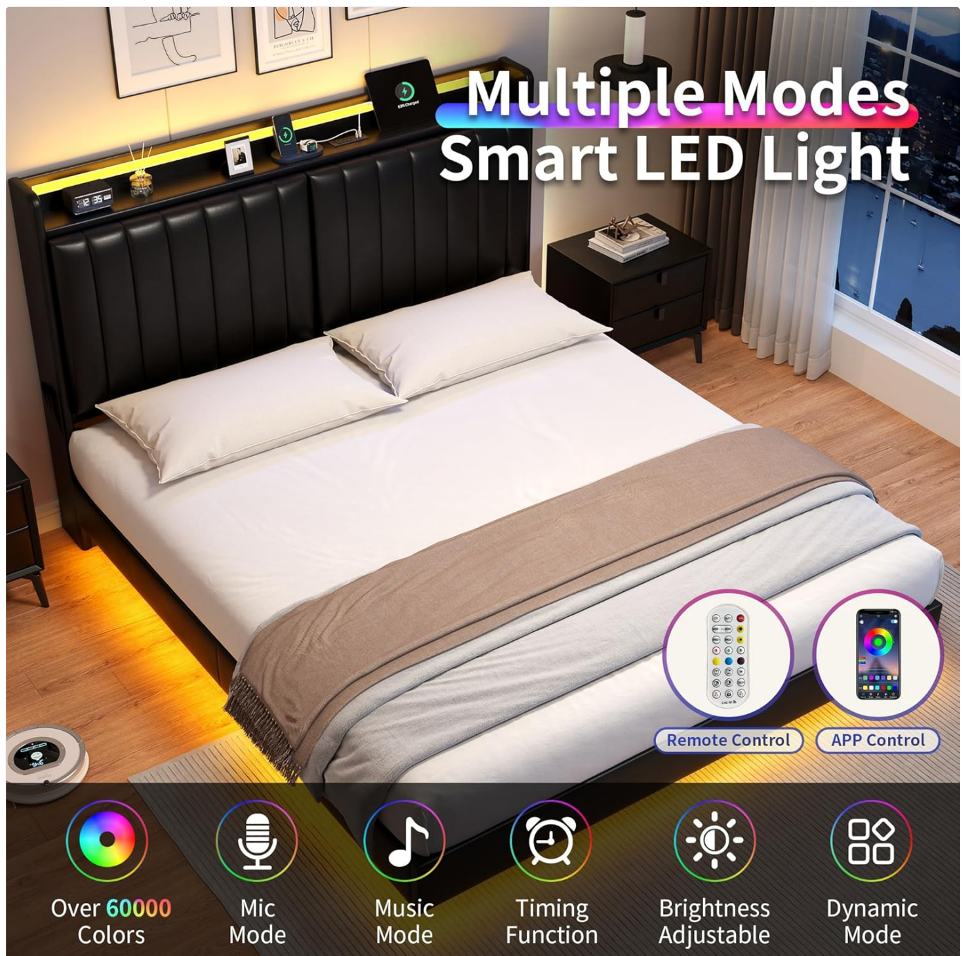
Image 4.3: Overview of the Smart RGB LED light features, including remote and app control options.