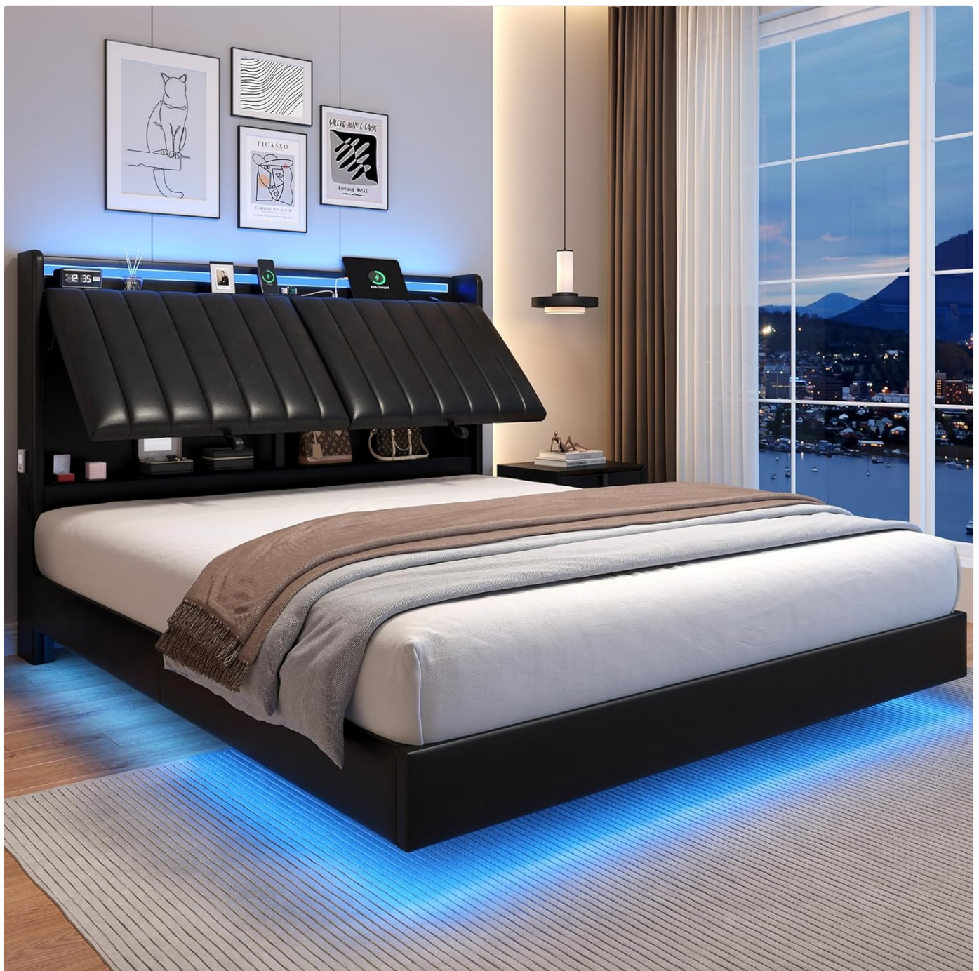
Image 1.1: Jocoevol Full Size Floating Bed Frame with integrated LED lighting and hidden headboard storage.