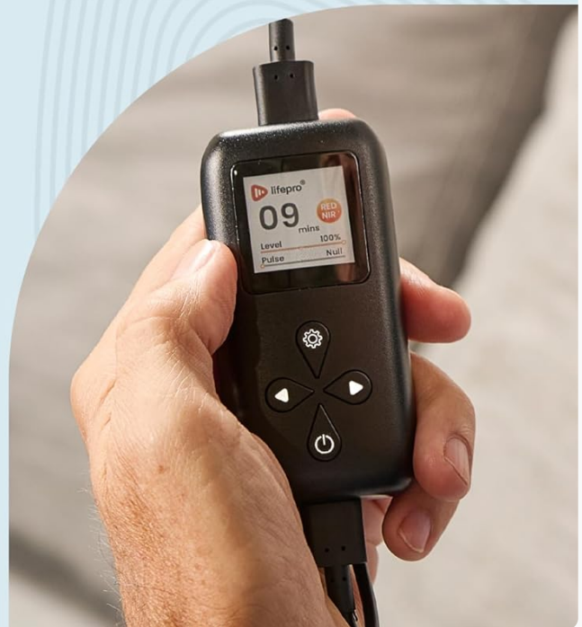
Image: A man holding the remote control for the Lifepro Red Light Therapy Belt, demonstrating its ease of use for adjusting settings.

Adjust time, intensity and mode in one click.