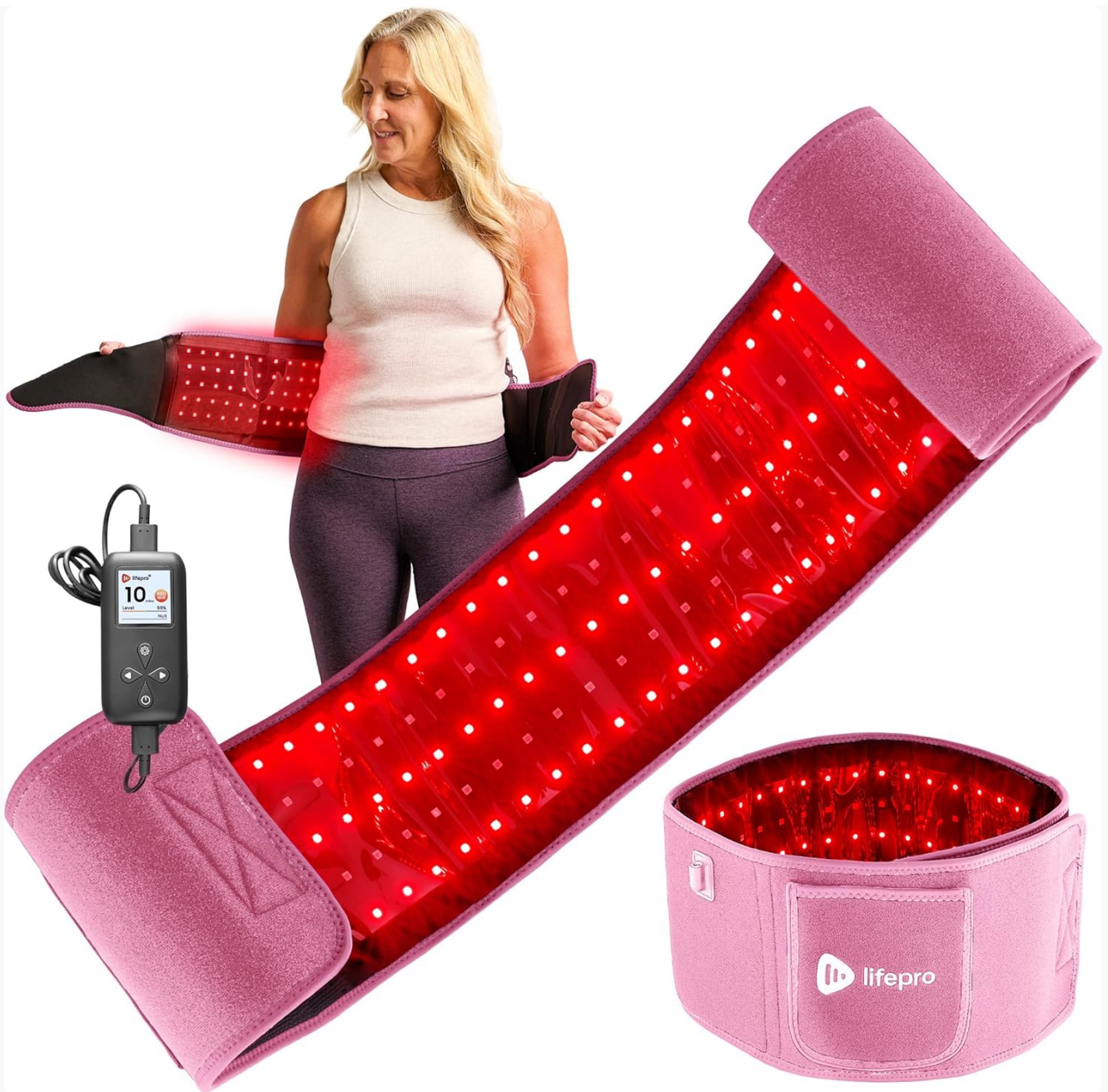
Image: The Lifepro Red Light Therapy Belt laid out, showing the LED panel and the attached remote control. A smaller, rolled-up belt is also shown, indicating its flexible nature.