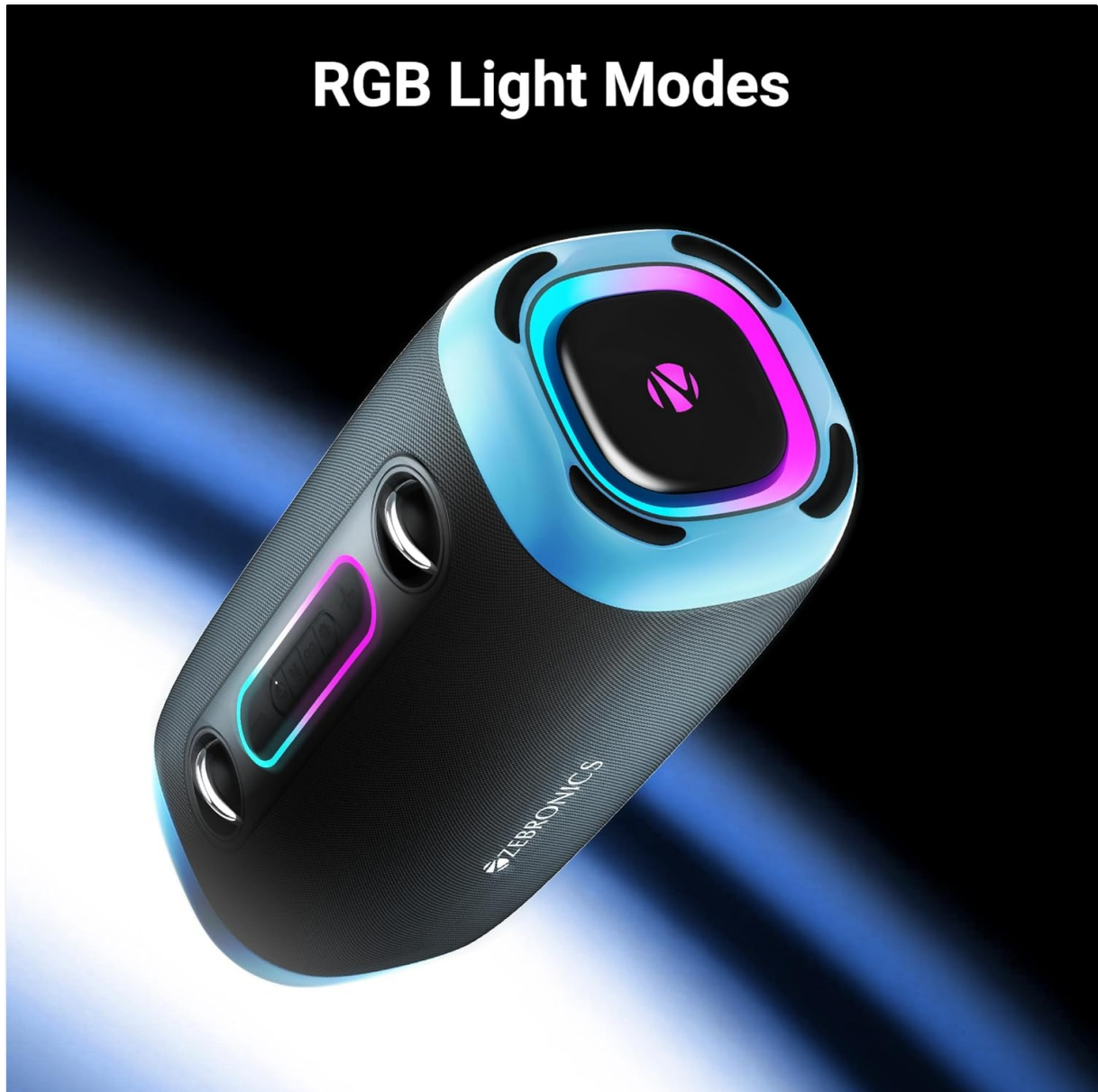
Image: Speaker showcasing its RGB LED light modes.

The speaker features multiple RGB LED light modes.