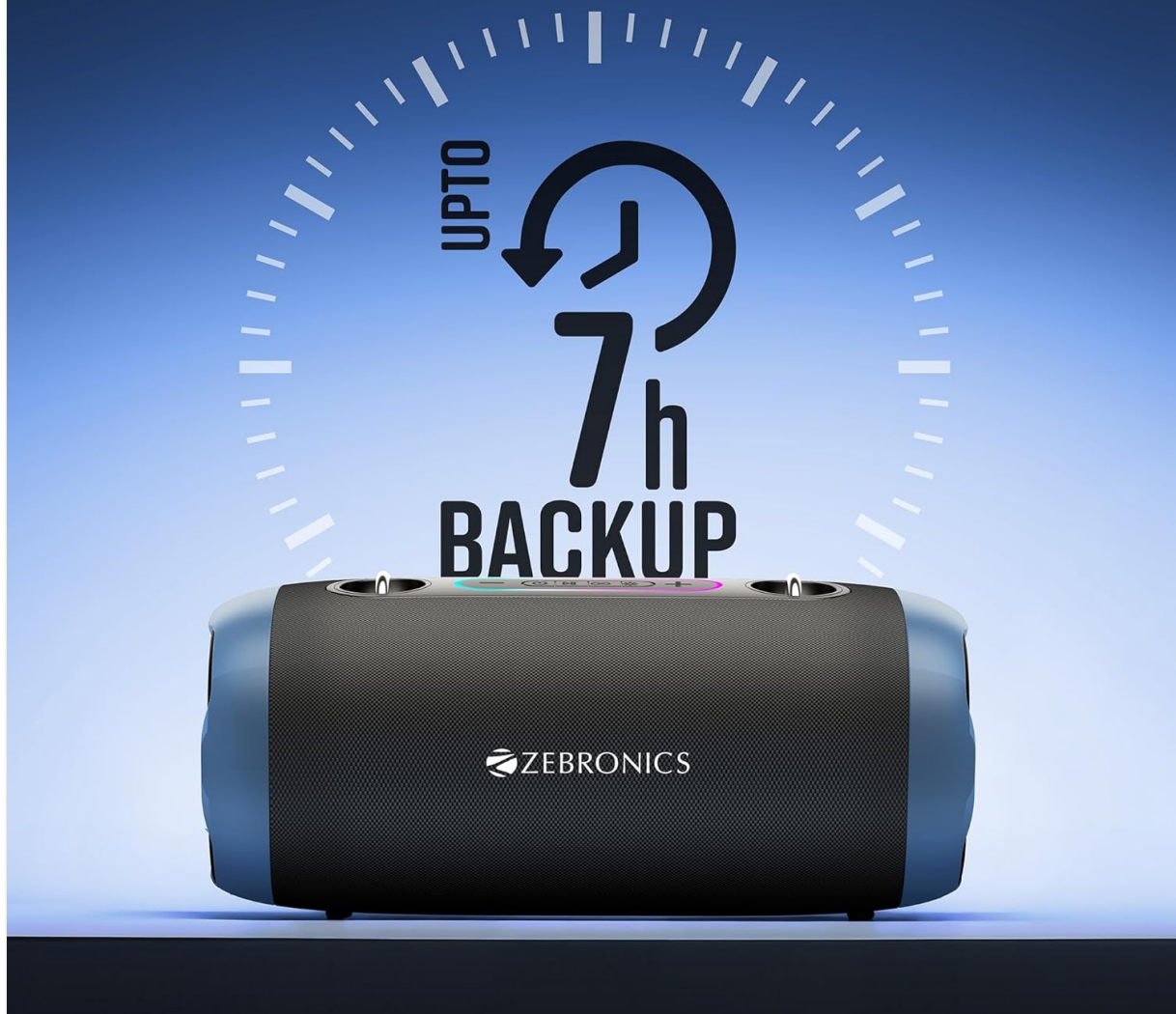
Image: Speaker highlighting up to 7 hours of battery backup.