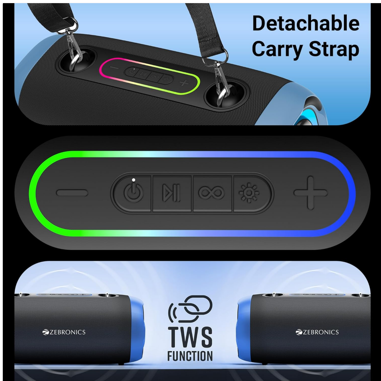
Image: Two speakers illustrating the TWS function.