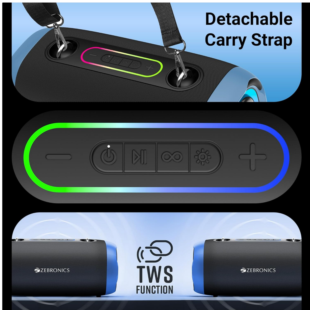
Image: Top panel showing control buttons and carry strap attachment points.