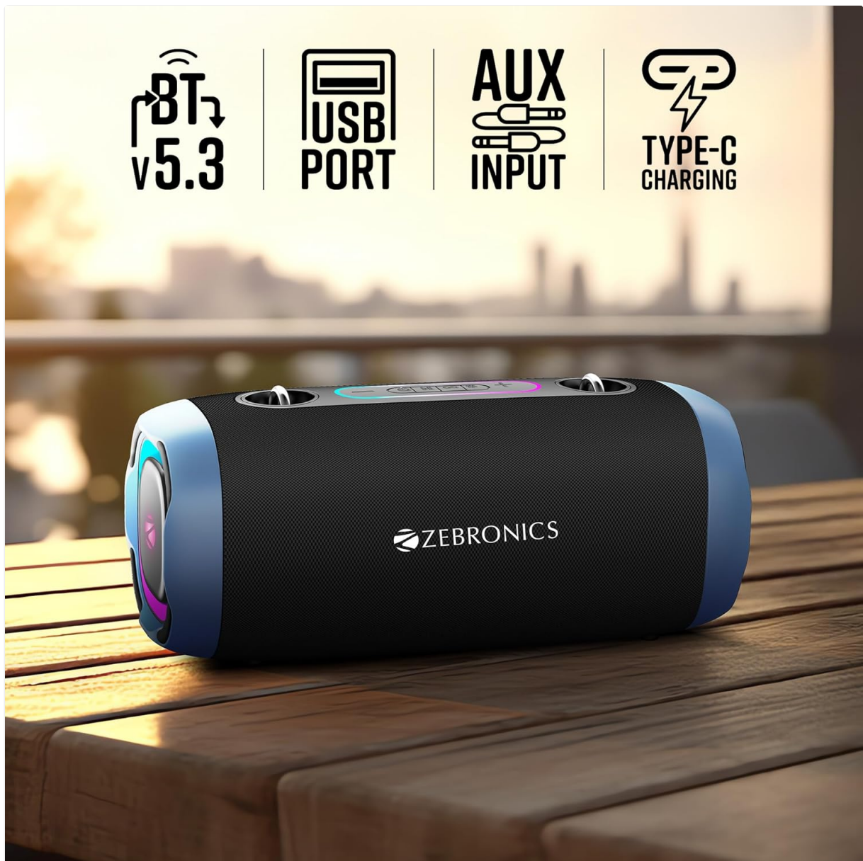
Image: Side panel displaying connectivity ports: Bluetooth v5.3, USB, AUX, and Type-C charging.