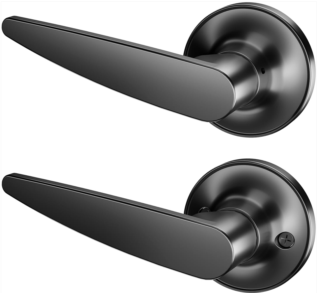
Image: Overview of the OKIBB Keyless Entry Door Lock components.