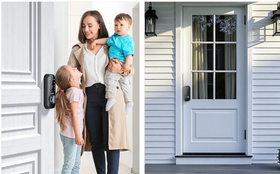
Images: Examples of the OKIBB Keyless Entry Door Lock installed on different door types.