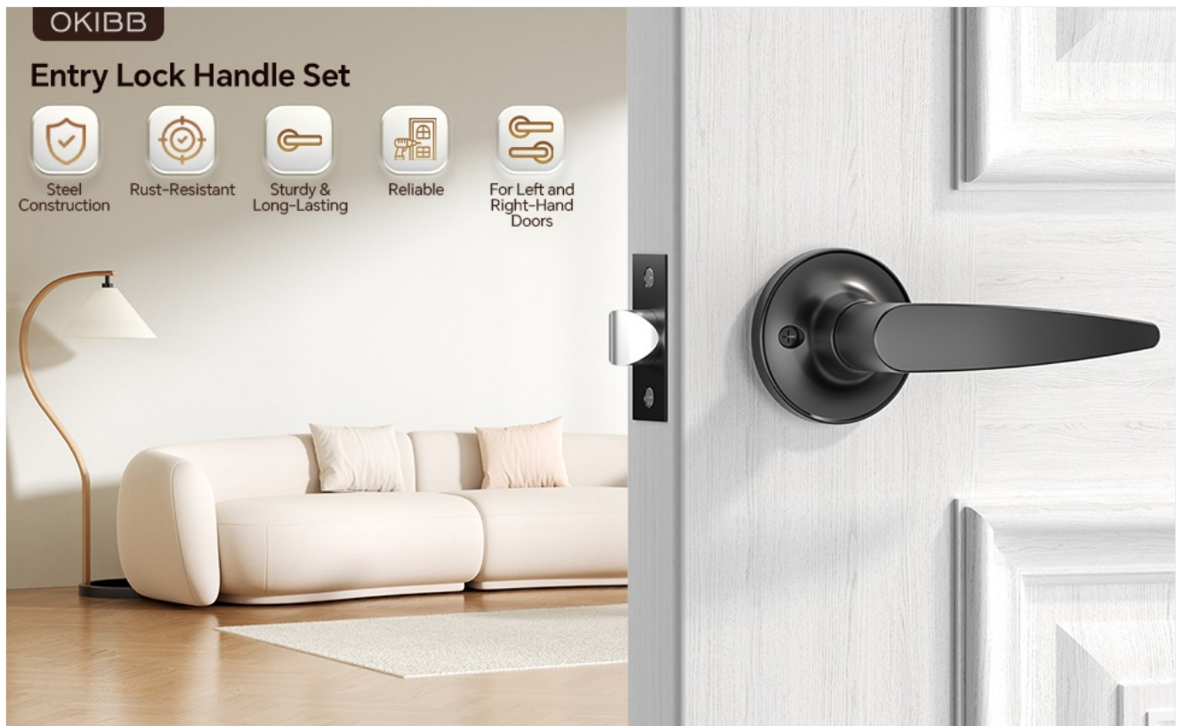
Image: The OKIBB Entry Lock Handle Set, highlighting its steel construction, rust-resistance, durability, and compatibility with left and right-handed doors.