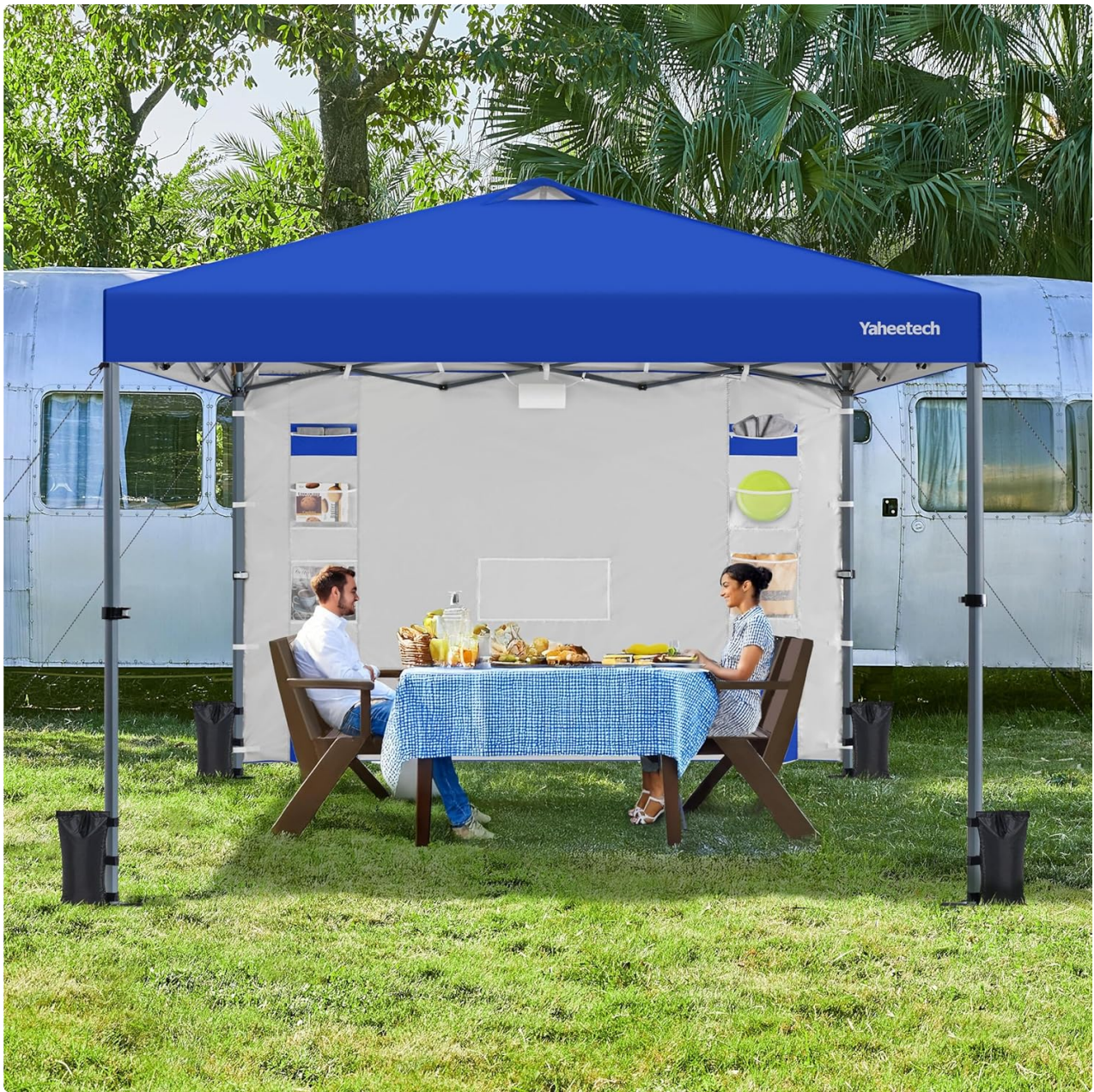
Image: The Yaheetech 10x10 Pop-up Canopy Tent set up outdoors, providing shade for two people seated at a table. The blue canopy top and white sidewalls are visible, with storage pockets on the sidewall.