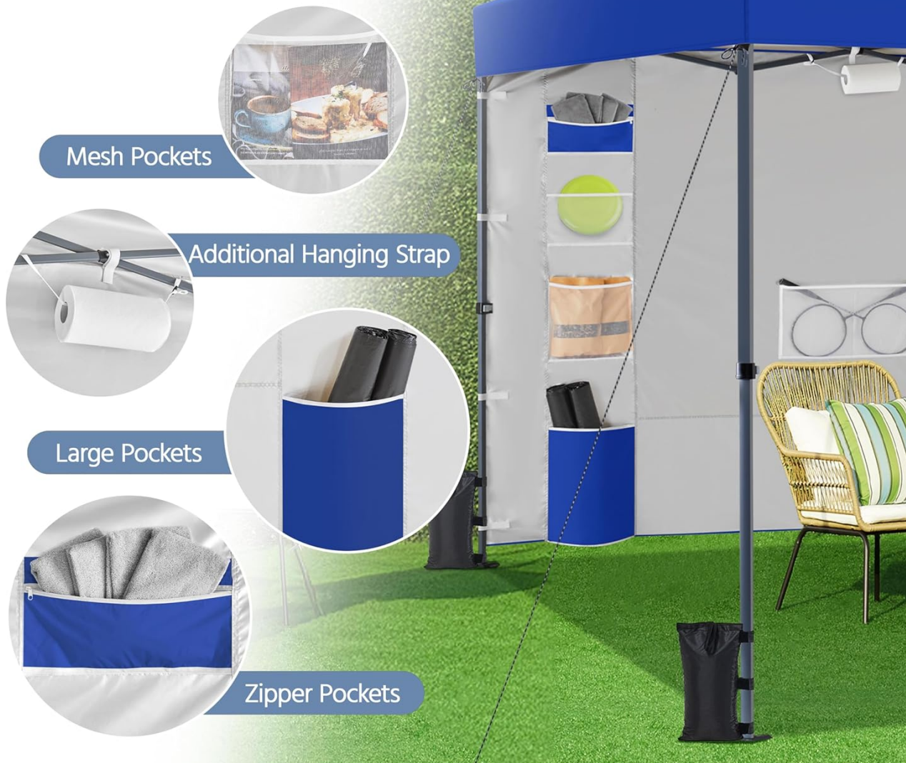
Image: A close-up view of the versatile sidewall, illustrating its various storage options including mesh pockets, large pockets, zipper pockets, and an additional hanging strap for organizing items.

Ample Extra Storage Space with 9 Varied-Sized Pockets