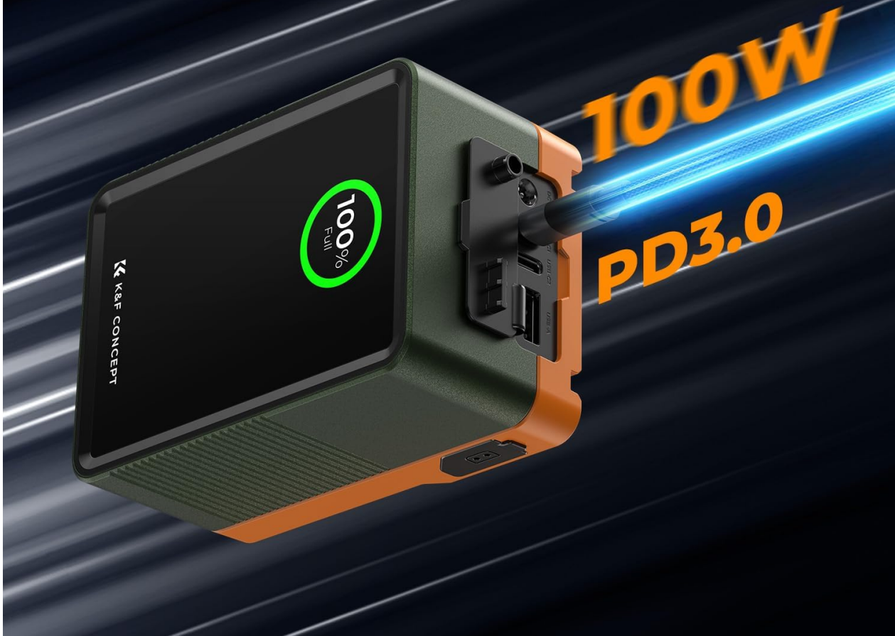
Image: The K&F CONCEPT KF-V99 Pro 99Wh V-Mount Battery.

Fully charge in 2 hours, support Charging and Discharging simultaneously