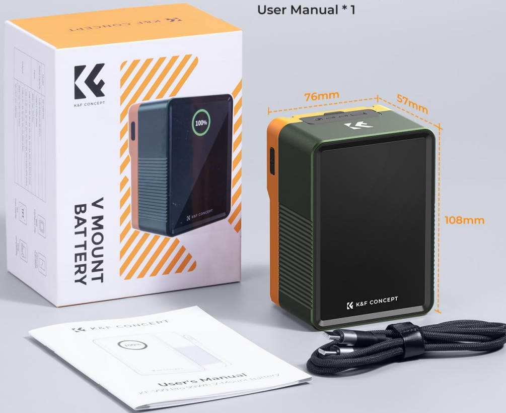
Image: The K&F CONCEPT V-Mount Battery, 240W USB-C charging cable, and user manual, shown next to the product packaging.

K&F Concept V99 Pro V Mount Battery * 1 240W USB-C Charging Cable (39.3") * 1 User Manual * 1