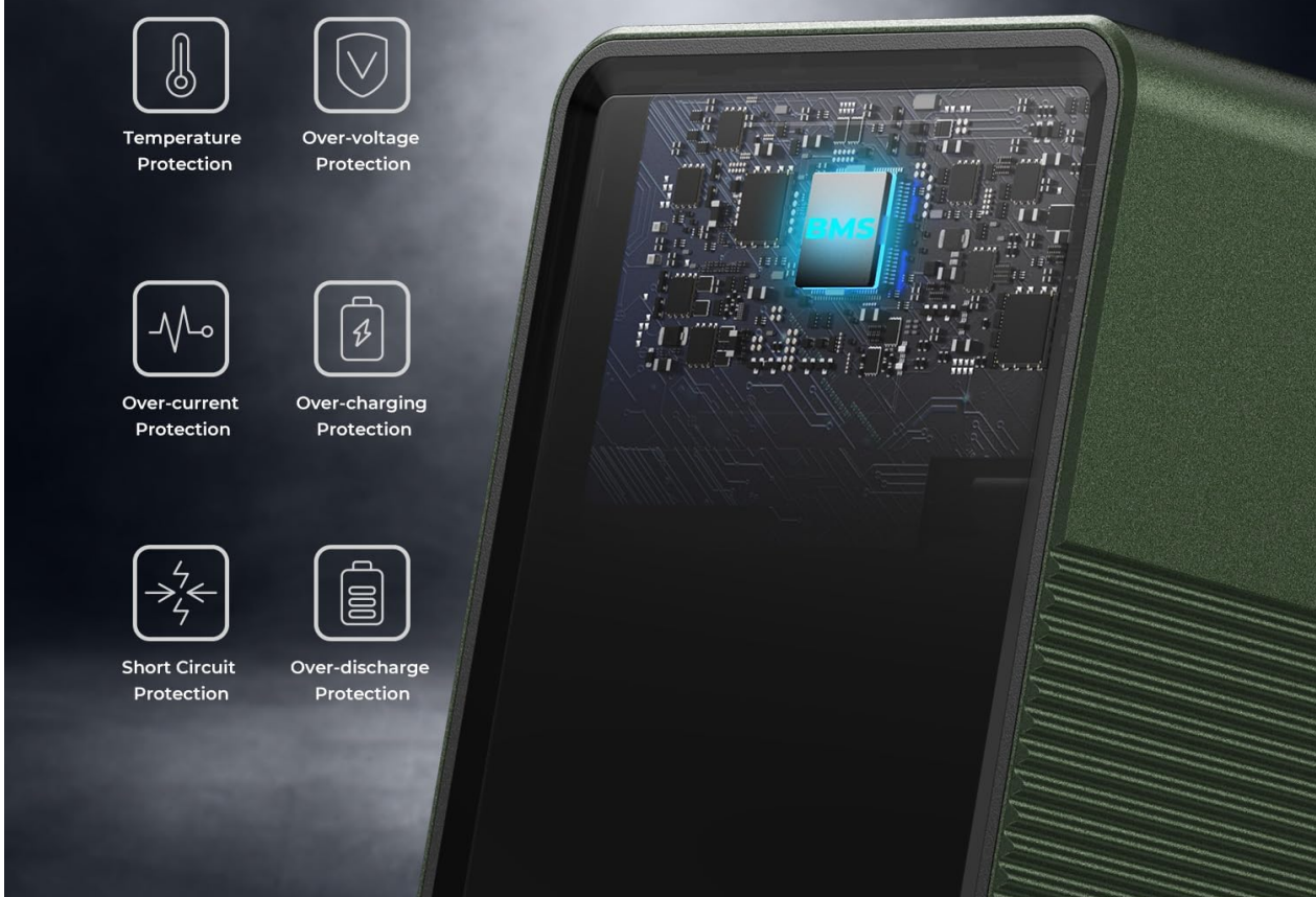
Image: A visual representation of the K&F CONCEPT V-Mount Battery's built-in safety features, including temperature, over-voltage, over-current, over-charging, short-circuit, and over-discharge protection.

Built-in BMS intelligent battery management system protects and optimizes battery performance