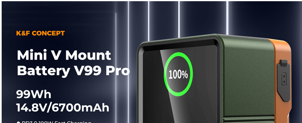
Image: The K&F CONCEPT V-Mount Battery providing 100W output, charging both a laptop and a camera.

Alternatively, use a D-Tap charger (not included) connected to the D-Tap port for charging.