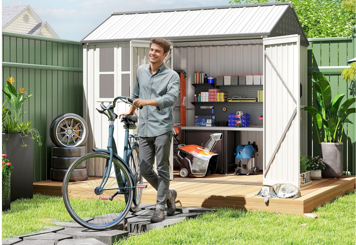
Figure 4: The shed's window, designed to provide natural illumination for the interior.