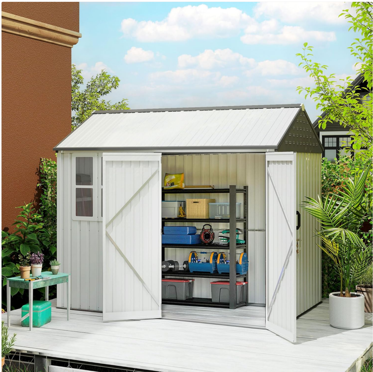
Figure 1: Assembled Outsunny 8' x 6' Metal Garden Storage Shed.