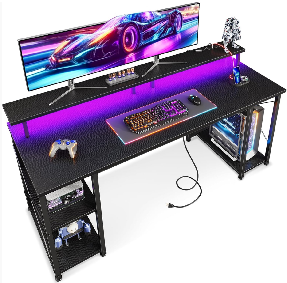
Figure 1.1: The ODK 63 Inches Gaming Desk, showcasing its spacious design, integrated LED lighting, and monitor stand.