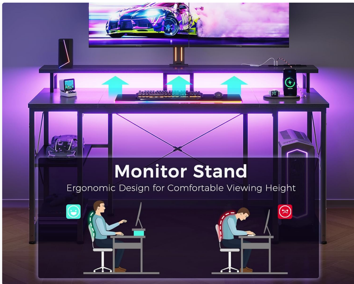
Figure 3.4: The ergonomic monitor stand helps maintain proper posture and comfortable viewing height.