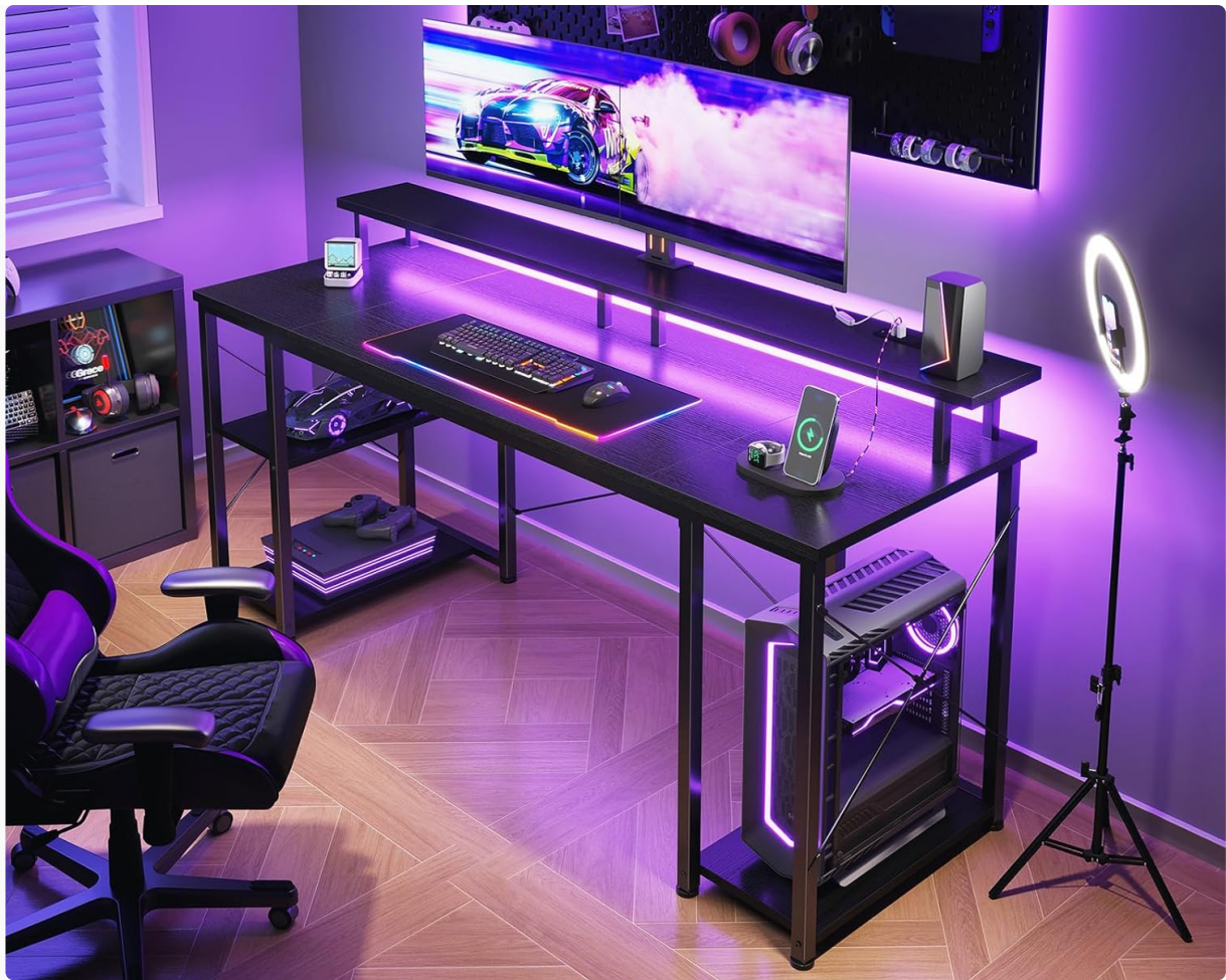
Figure 3.3: The integrated recessed power strip provides easy access to power outlets and USB charging ports for your devices.