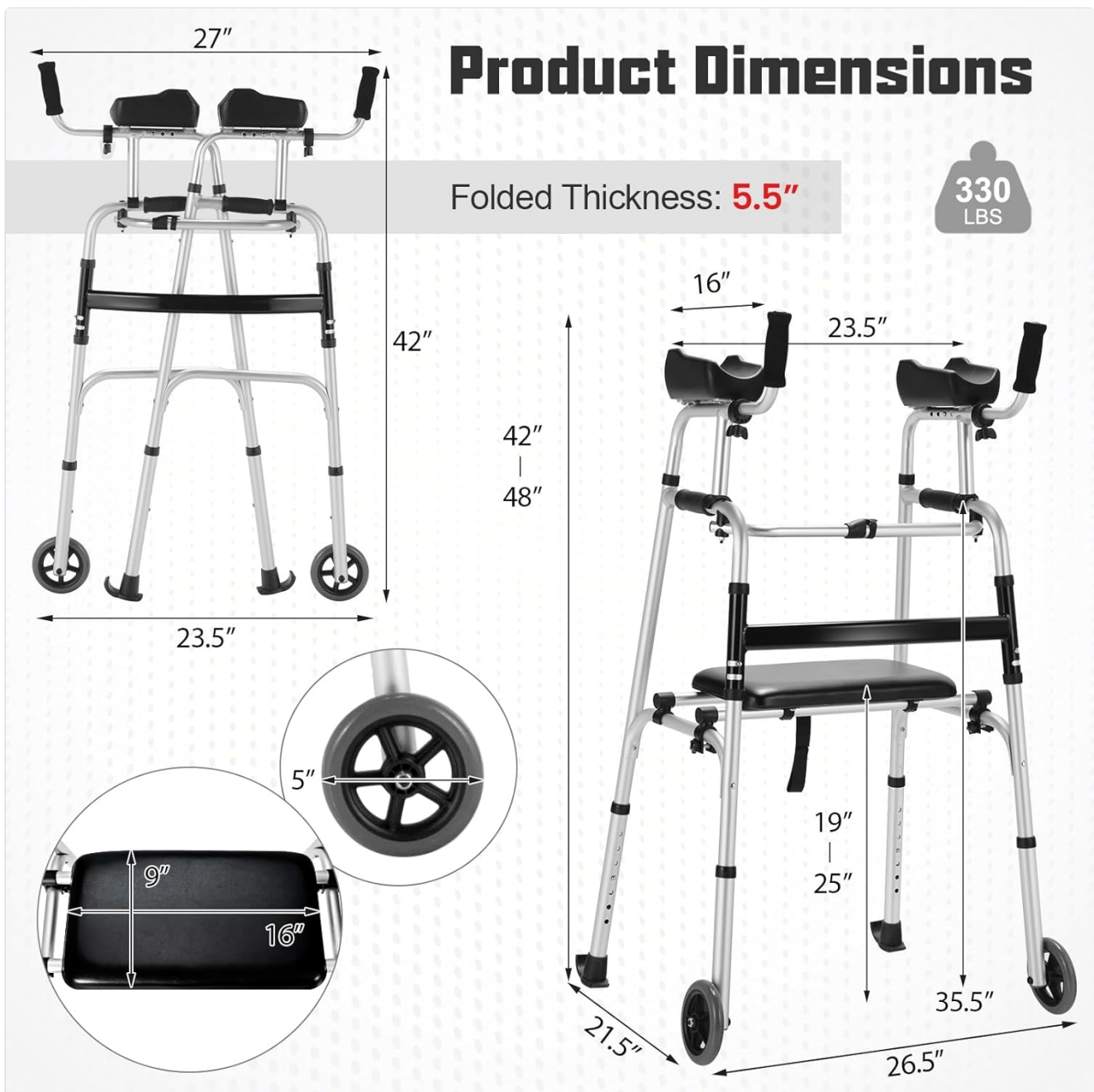
Image: Detailed product dimensions are provided, showing the walker's overall size, folded thickness of 5.5 inches, seat dimensions (16"x9"), and wheel size (5"). The maximum weight capacity is indicated as 330 lbs.