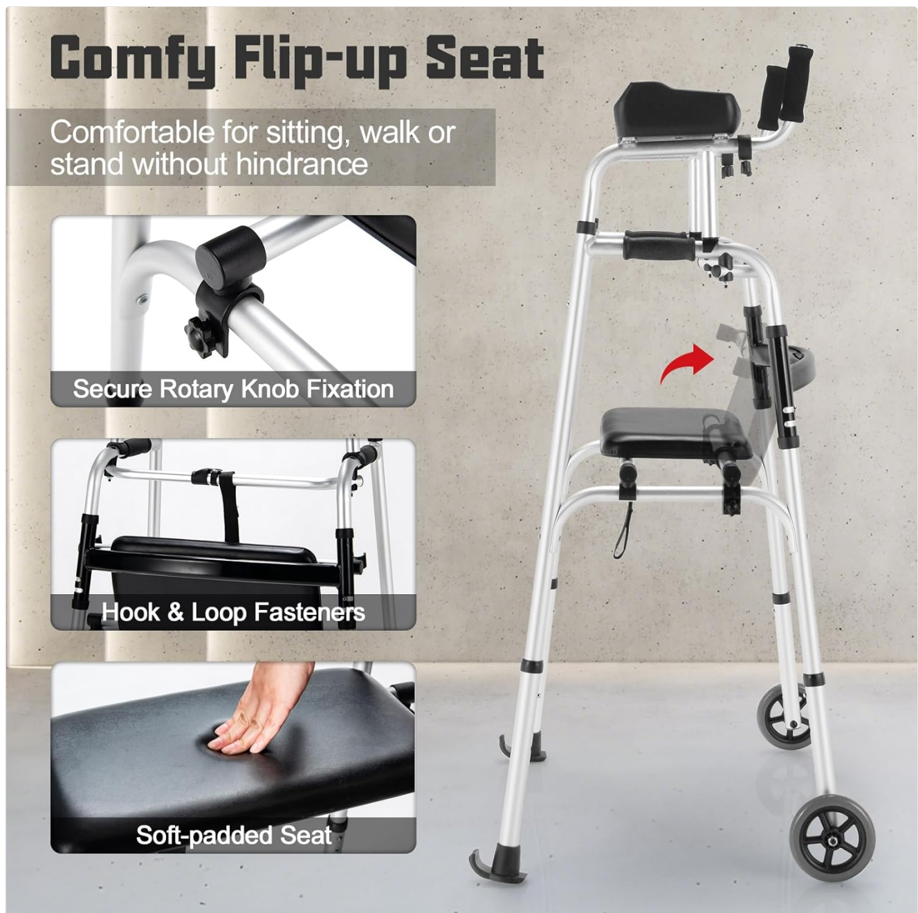
Image: Details of the comfortable flip-up seat, highlighting the secure rotary knob fixation, hook and loop fasteners for securing the seat in the upright position, and the soft-padded surface.