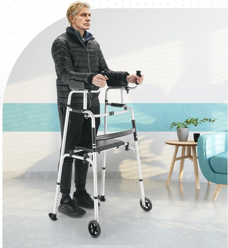
Image: The walker shown in two modes: as an upright walker with armrests for standing straight, and as a standard walker without armrests for a lower center of gravity.