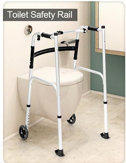
Image: The walker serving as a reliable aid for multiple scenarios, including assisting a person in getting up from a chair, supporting an elderly couple during a walk, and functioning as a toilet safety rail.