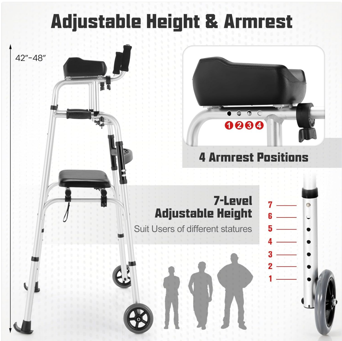
Image: The walker's height is adjustable from 42" to 48" with 7 distinct levels. An inset highlights the 4 adjustable positions for the armrests.