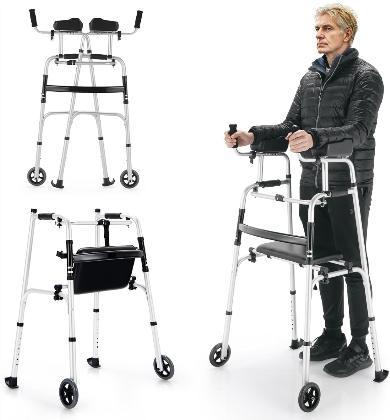
Image: An overview of the Toolsempire Folding Upright Walker, illustrating its design, folded state, and a user demonstrating its upright posture support.