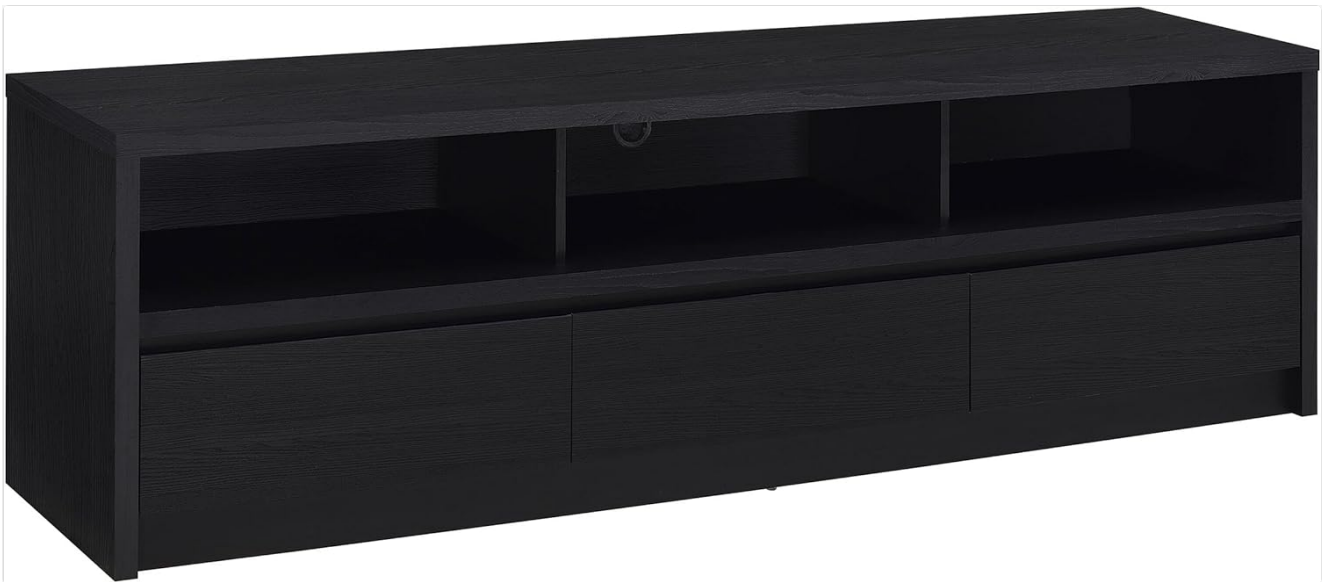
Figure 11.1: Front View. A clear front view of the black Rutland TV Stand, highlighting its sleek design and open compartments.