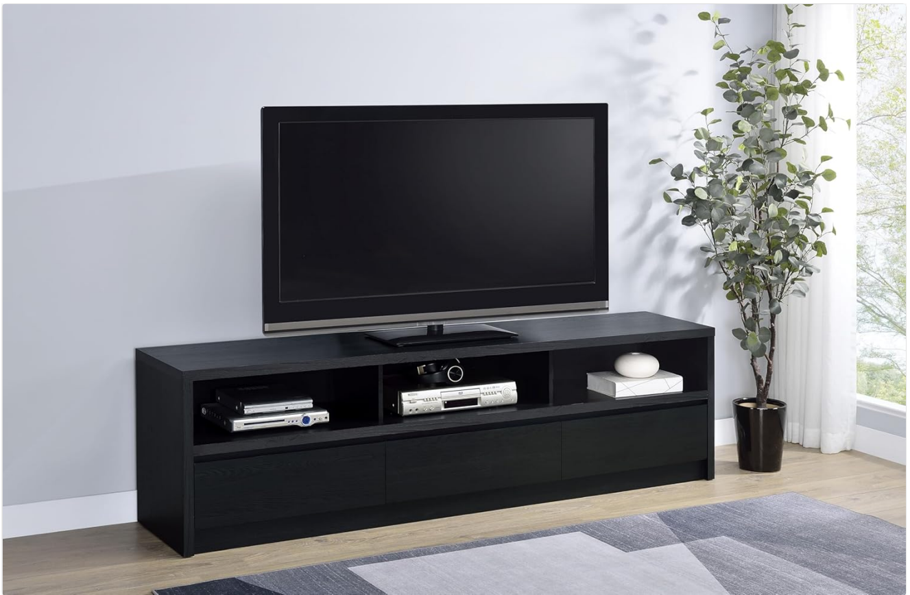
Figure 4.1: Rutland TV Stand in Use. This image shows the 78-inch black TV stand positioned in a living room, holding a television, media devices in its open shelves, and decorative items.