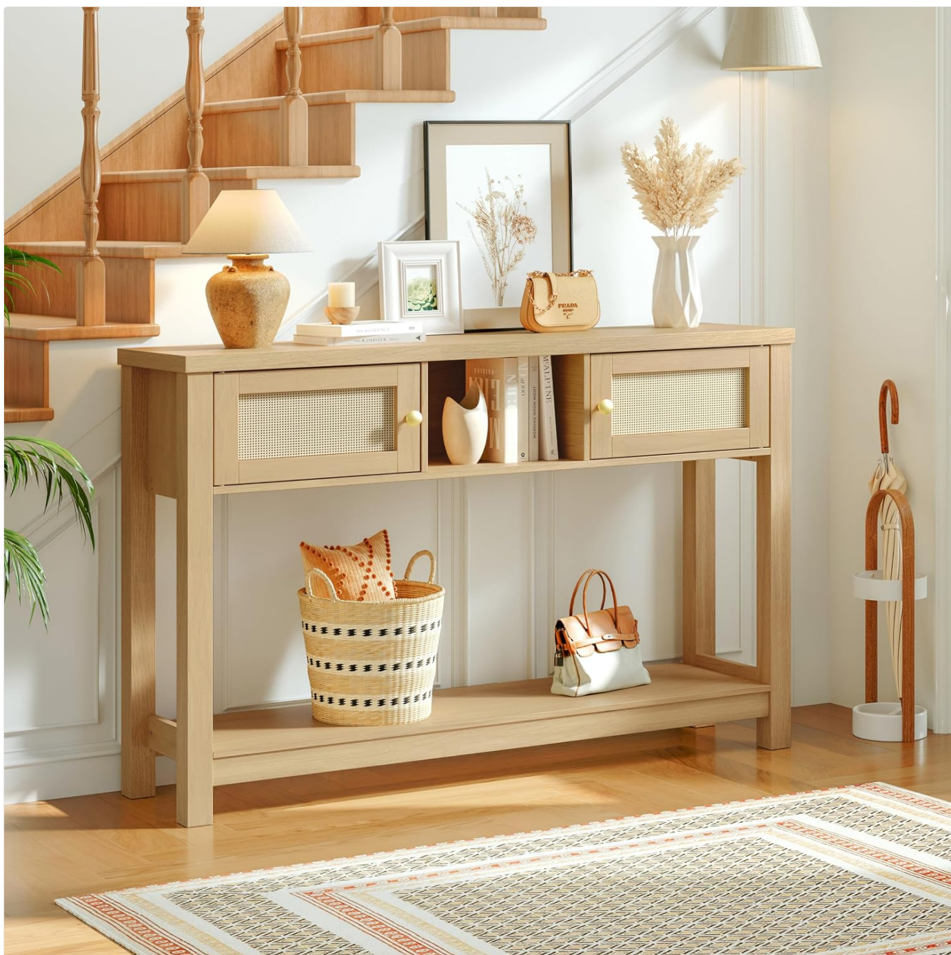
Image 1.1: The HOOBRO Console Table NL34XG01 positioned in an entryway, showcasing its storage and display capabilities with decorative items.