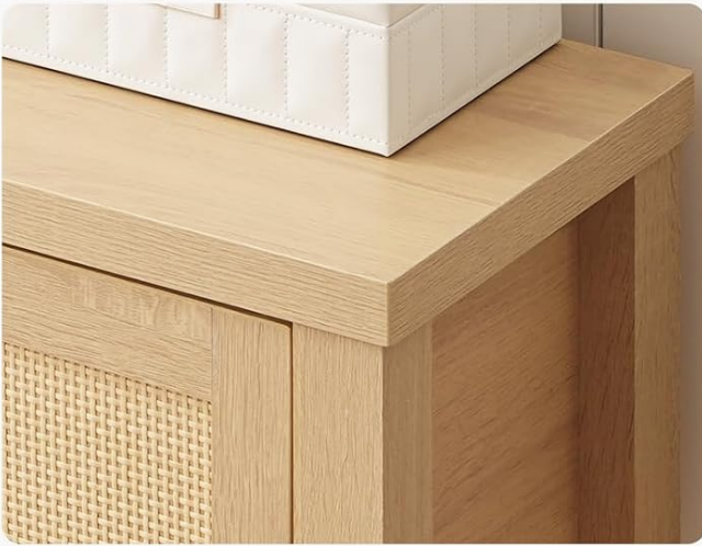
01 Robust Construction