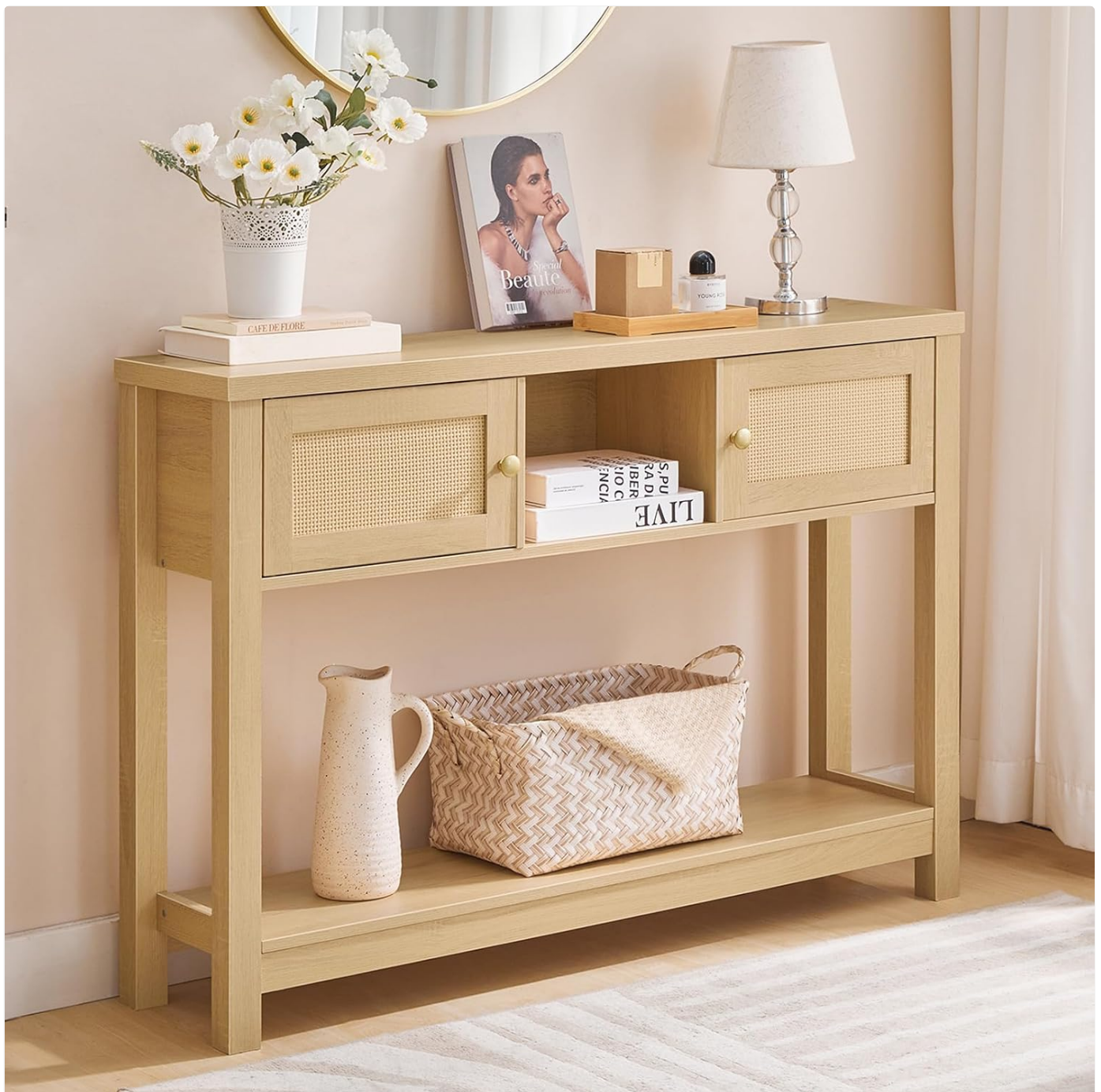
Image 3.1: The console table integrated into a living room, demonstrating its versatile design and aesthetic appeal.