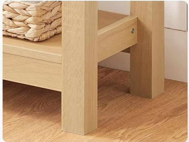
04 Strong Table Legs

Image 6.2: The open central area and bottom shelf of the console table, suitable for quick access items and larger storage solutions like boxes and baskets.