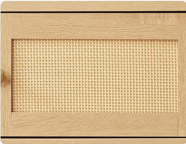
03 Rattan-Like Weaving Style