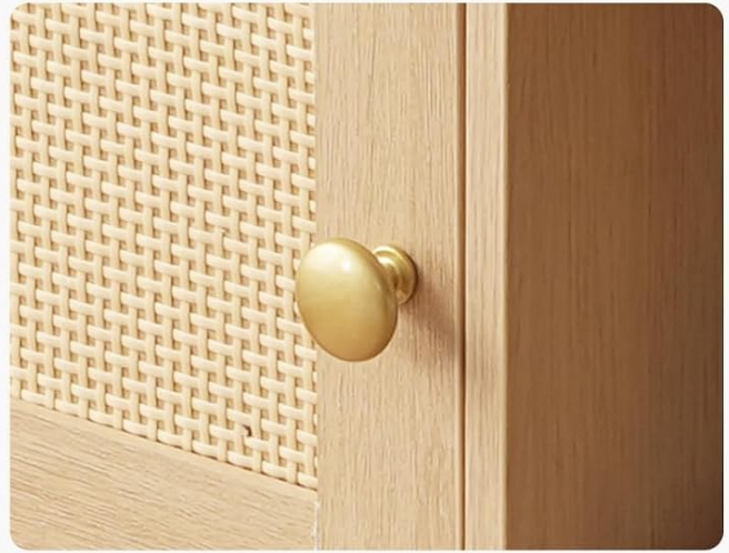
02 Quality Metal Knobs