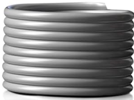
5m/16.4ft Water Hose