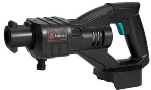
Cordless Pressure Washer