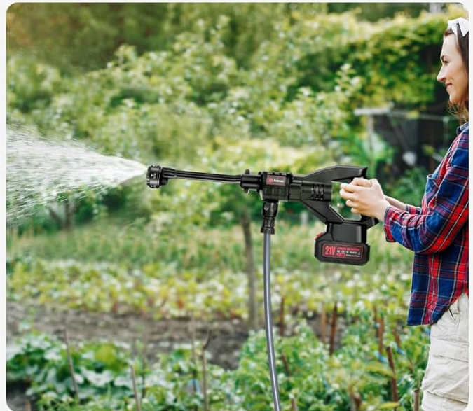
Image: Shows the pressure washer being used for cleaning fences, patios, bicycles, and garden areas.

Your browser does not support the video tag.