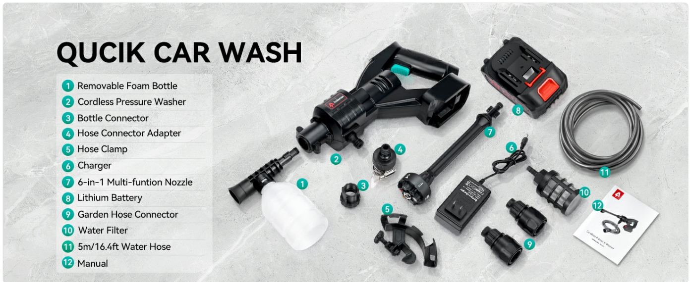
Image: Visual guide for connecting the battery, nozzle, and hose adapter.