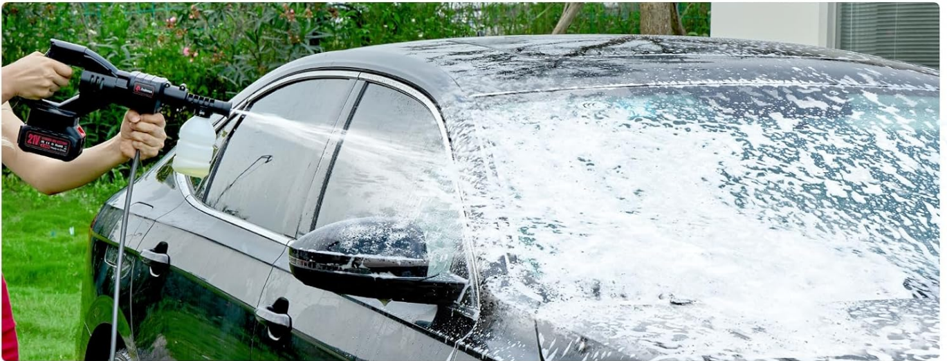
Image: Illustrates the different spray patterns available from the 6-in-1 nozzle.