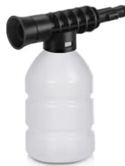
Removable Foam Bottle