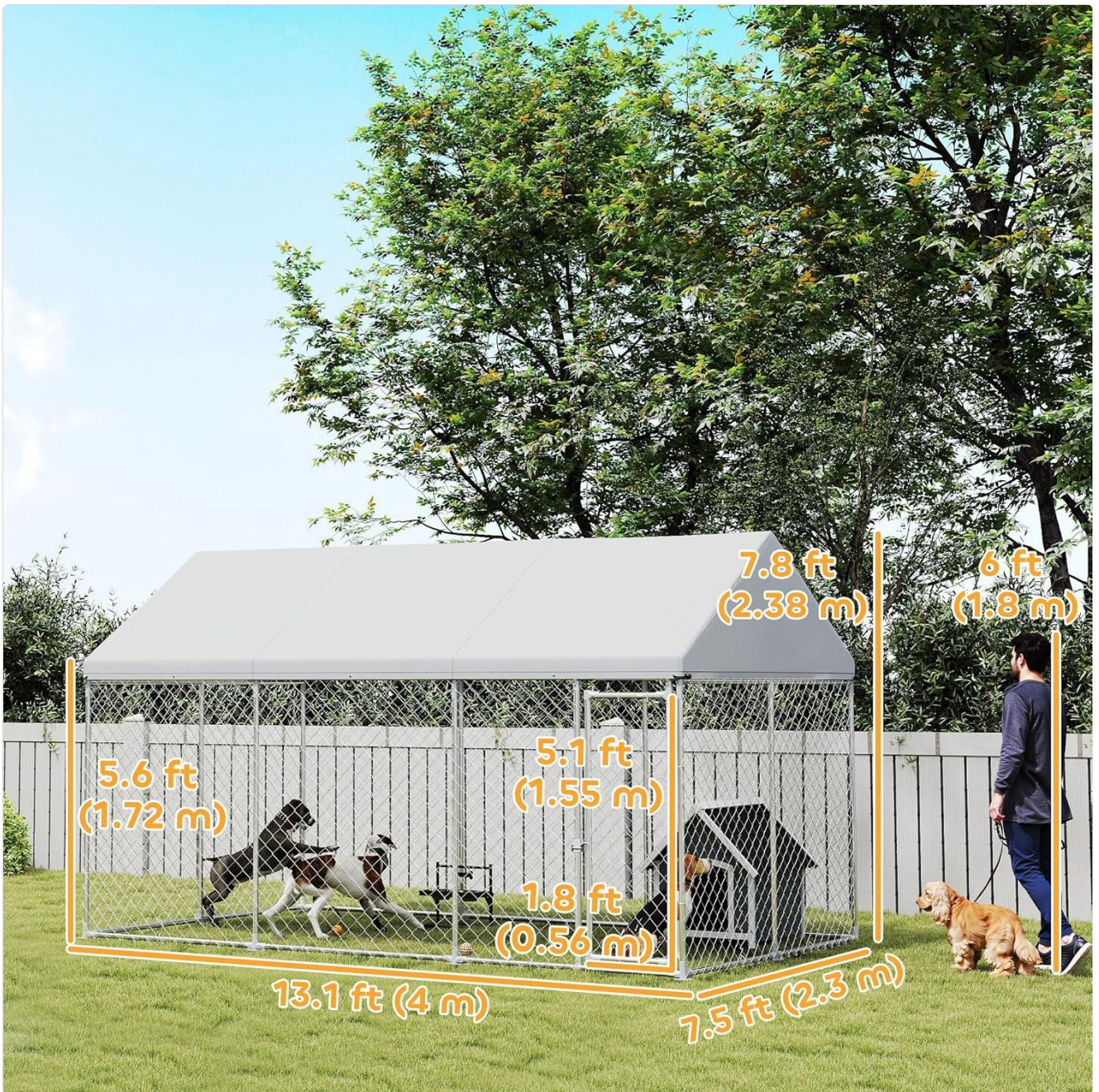
Image: Diagram illustrating the precise dimensions of the PawHut Large Dog Kennel.