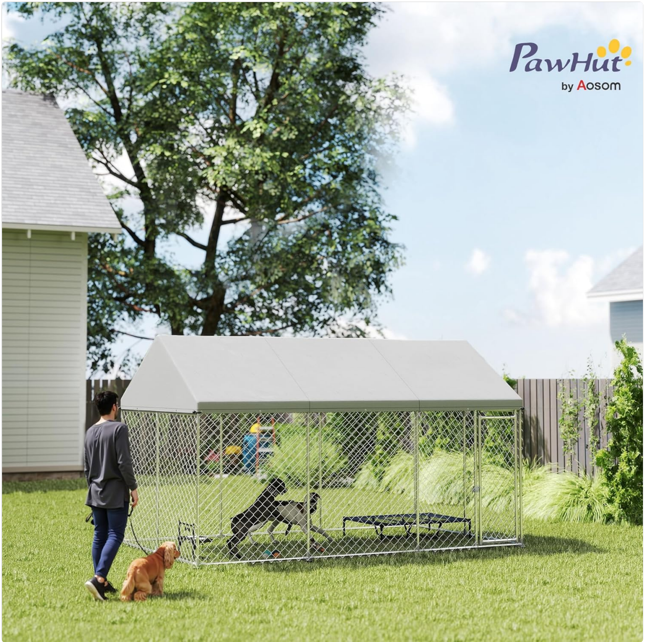
Image: A fully assembled PawHut dog kennel situated in a green backyard, demonstrating its spacious design.