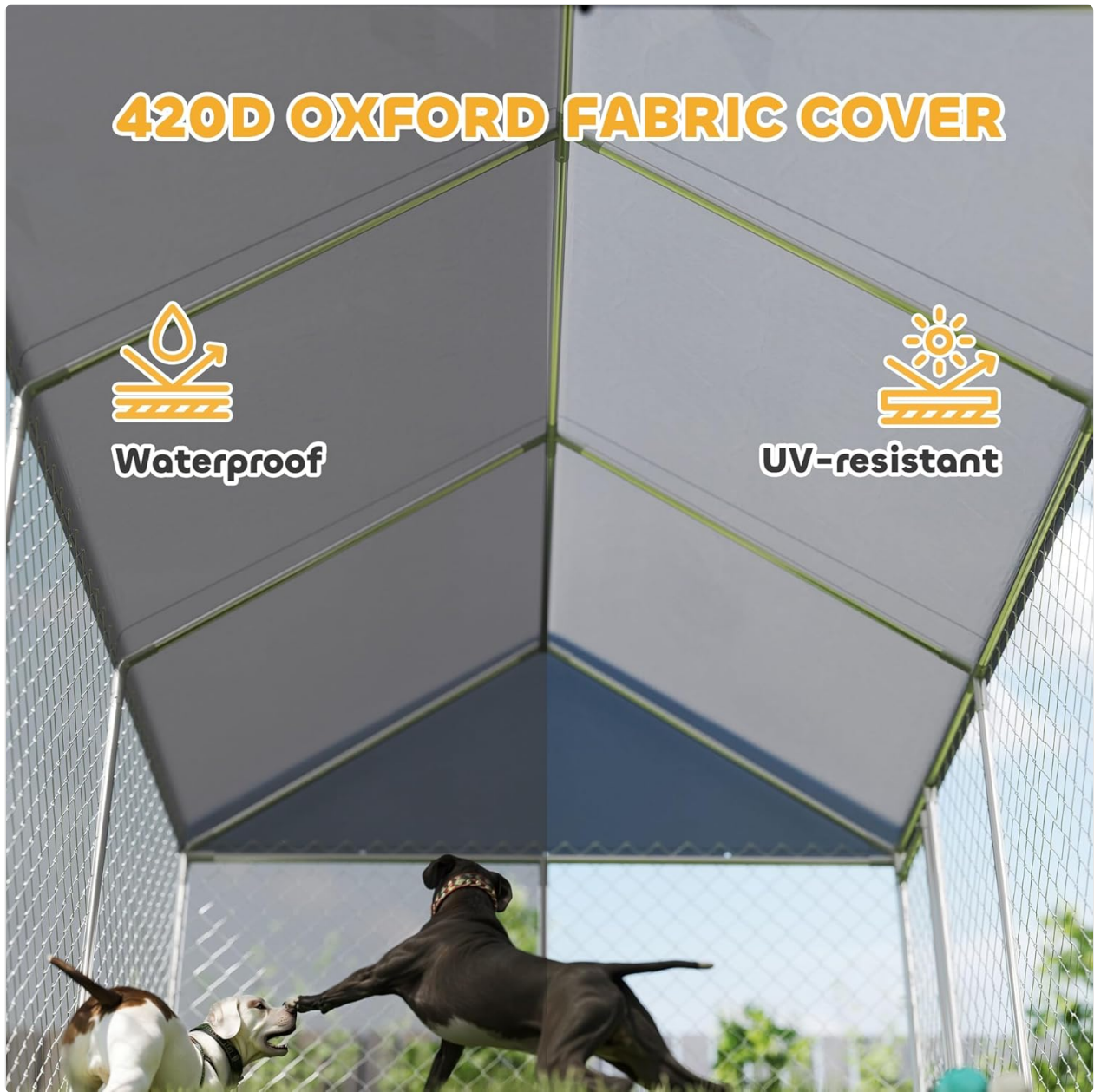
Image: Close-up view of the 420D Oxford fabric roof cover, highlighting its waterproof and UV-resistant properties.