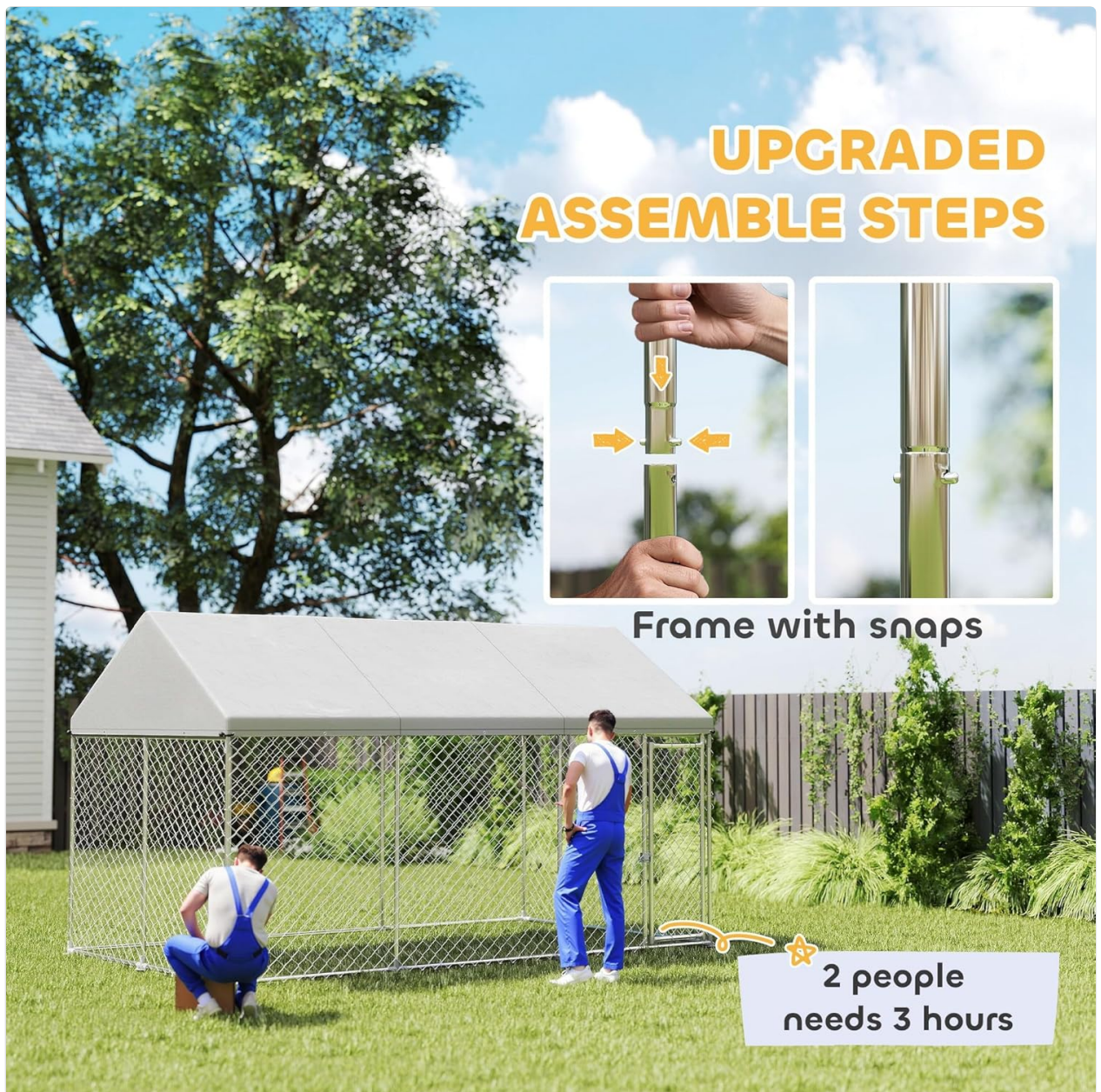
Image: Close-up of the telescopic tube design, illustrating how frame sections snap together for easy assembly.