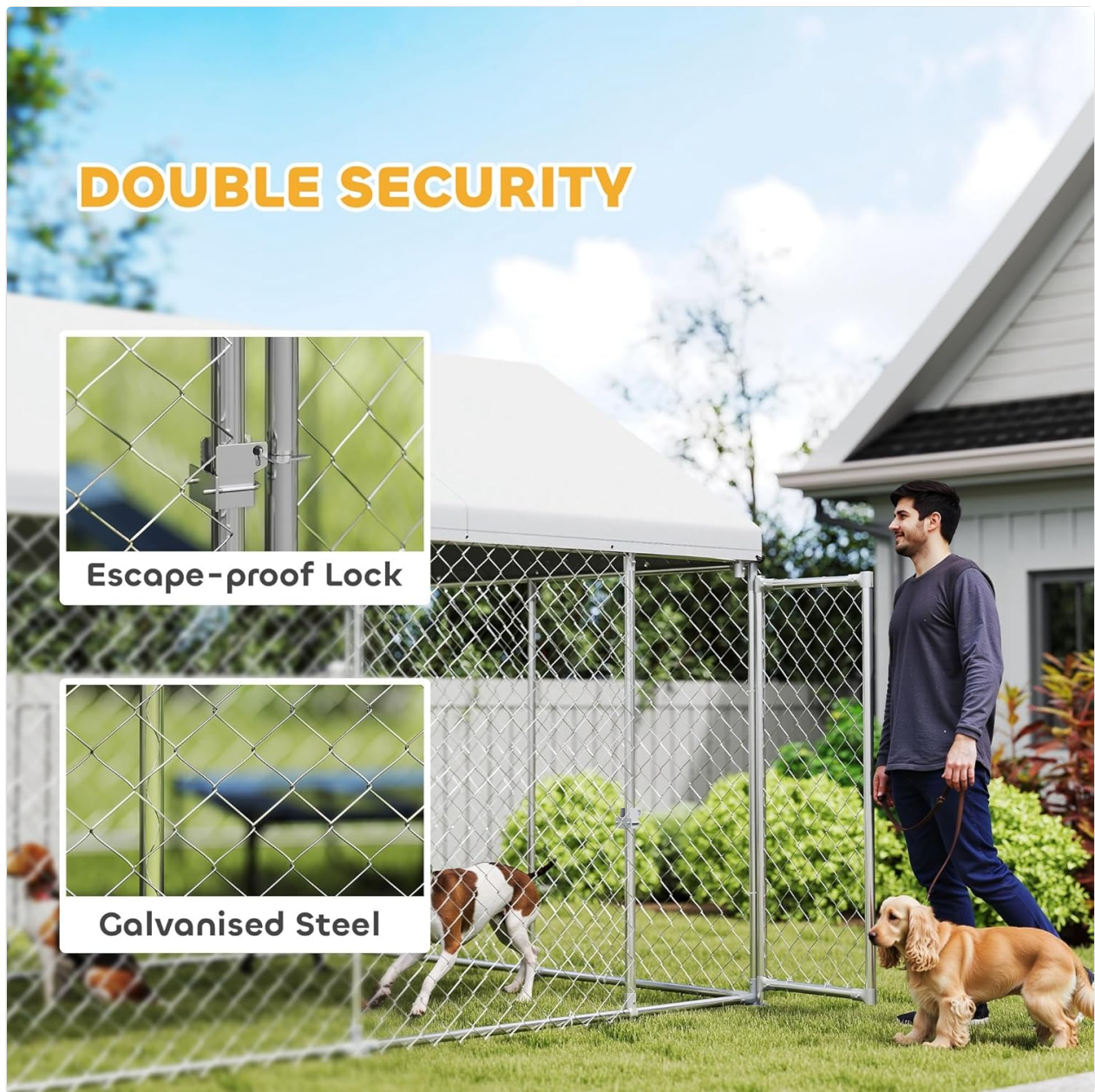
Image: Visual representation of the kennel's double security features, highlighting the escape-proof lock and galvanized steel construction.