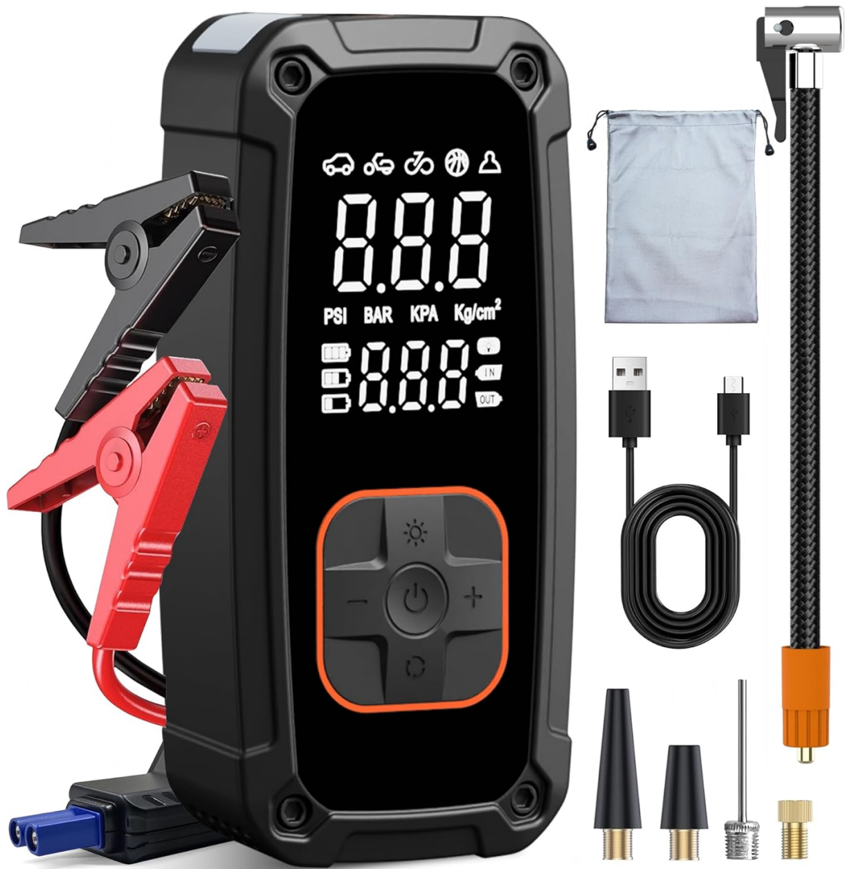
Image: lamfurart C845 unit with accessories, including the air hose.