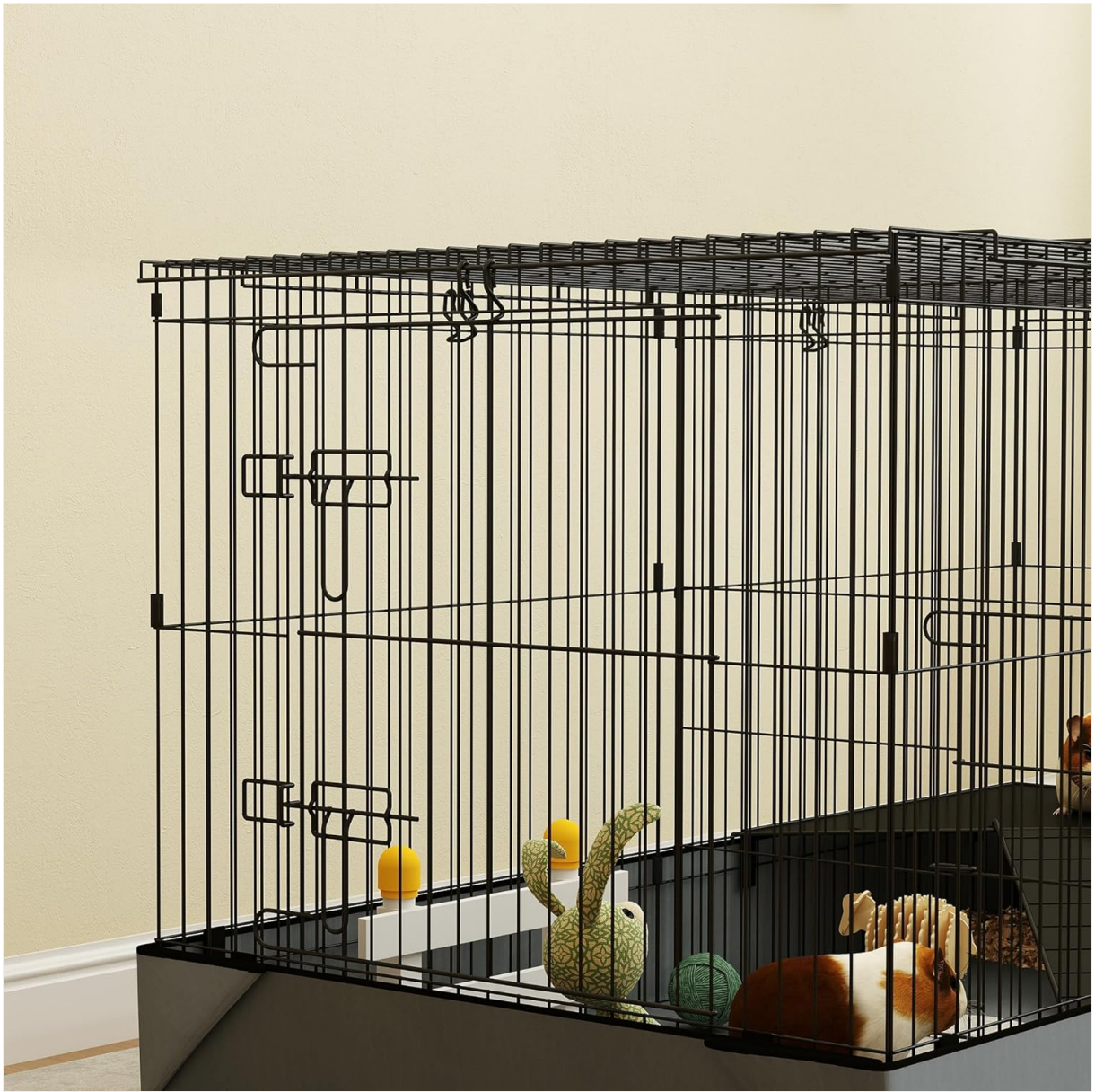
Image 4.2: Close-up view of the cage latches, ensuring secure closure.