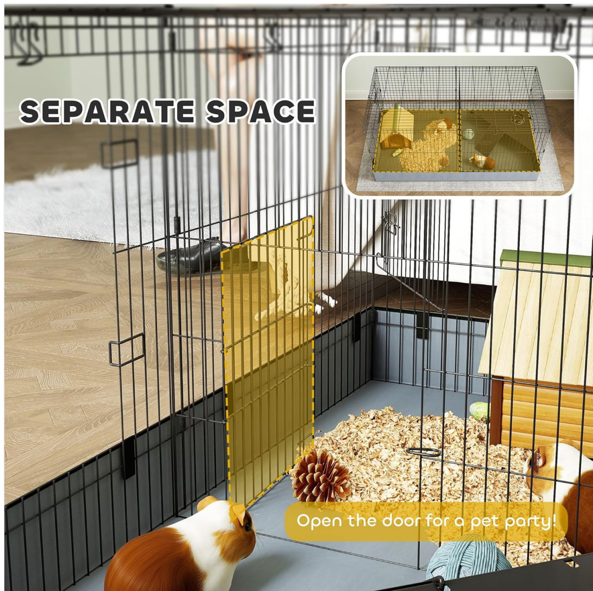
Image 5.2: View of the internal divider and the door that connects the separate areas within the cage.