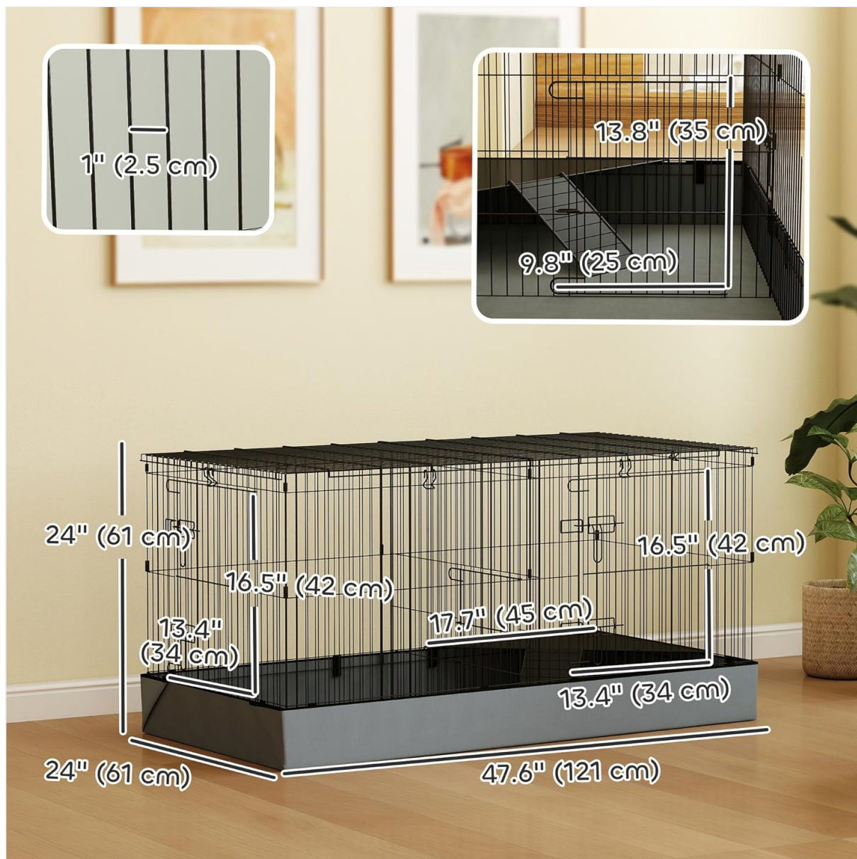
Image 4.1: Diagram showing the overall dimensions of the cage (121L x 61W x 61H cm).