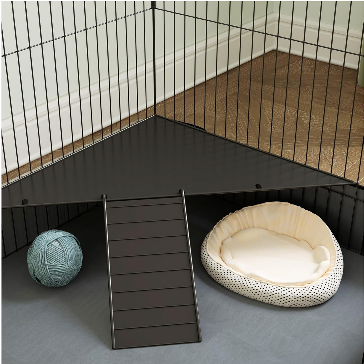
Image 5.3: Close-up of the ramp leading to an elevated perch area inside the cage.