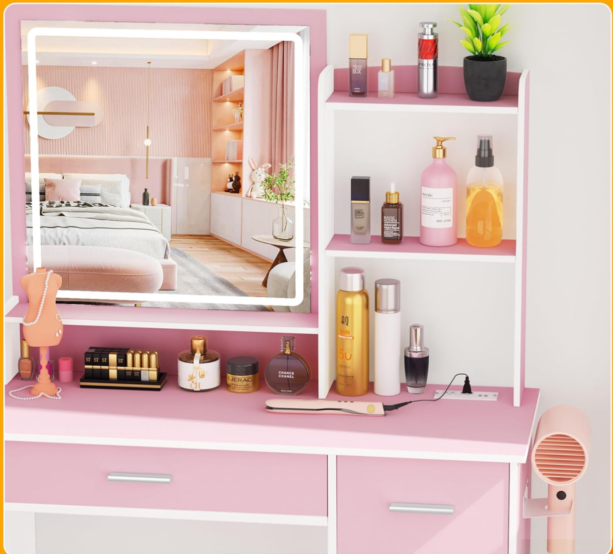
Figure 3.2: The side storage unit can be installed on either the left or right side of the main desk, offering flexible configuration.