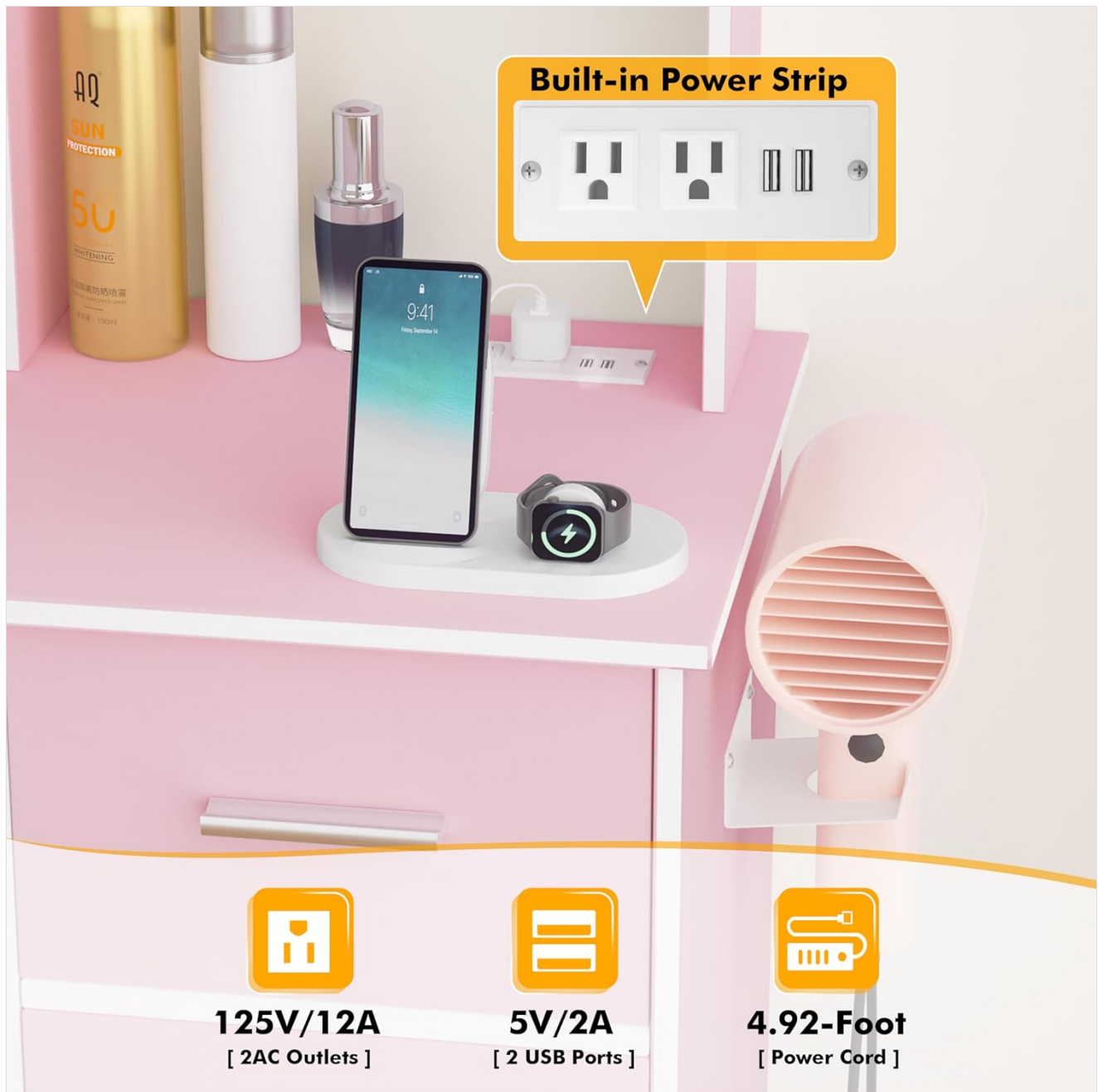
Figure 4.2: The built-in power strip provides convenient access to power for various devices.