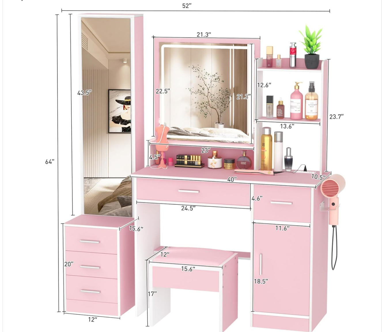
Figure 3.1: Package and Dimension Overview. The vanity and stool set are shipped in two boxes, which may arrive at different times.

TIPS: INTERGREAT Vanity and Stool Set will be shipped out with 2 boxes may arrive at different time