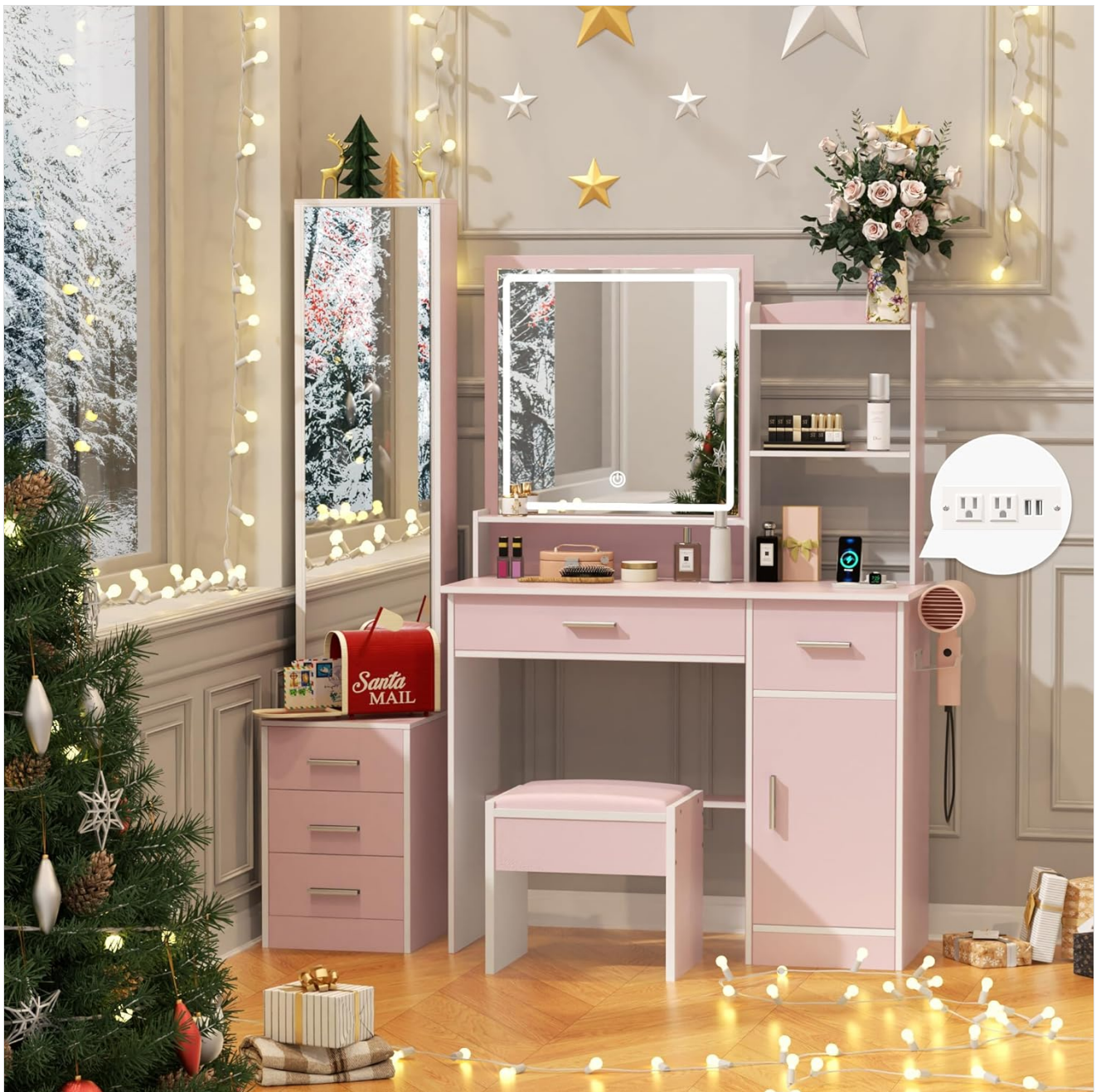
Figure 2.1: Overview of the INTERGREAT Makeup Vanity Desk components.