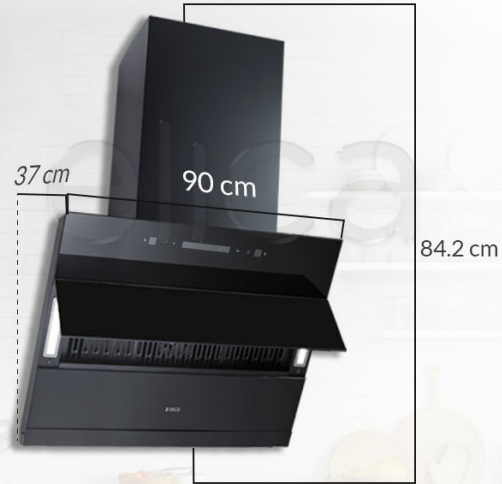
Image 3.1: Diagram illustrating the product dimensions (Length, Width, Height).

The chimney measures 90 cm length 84.2 cm height & 37 cm width; making it ideal for a seamless installation in your kitchen.