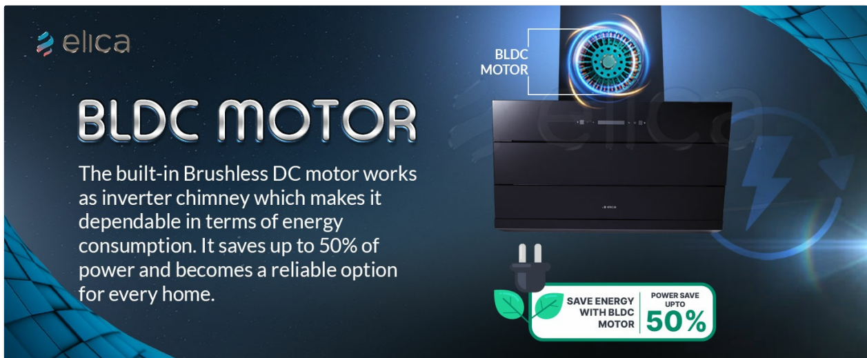
Image 4.4: Diagram explaining the BLDC motor and its energy-saving benefits.