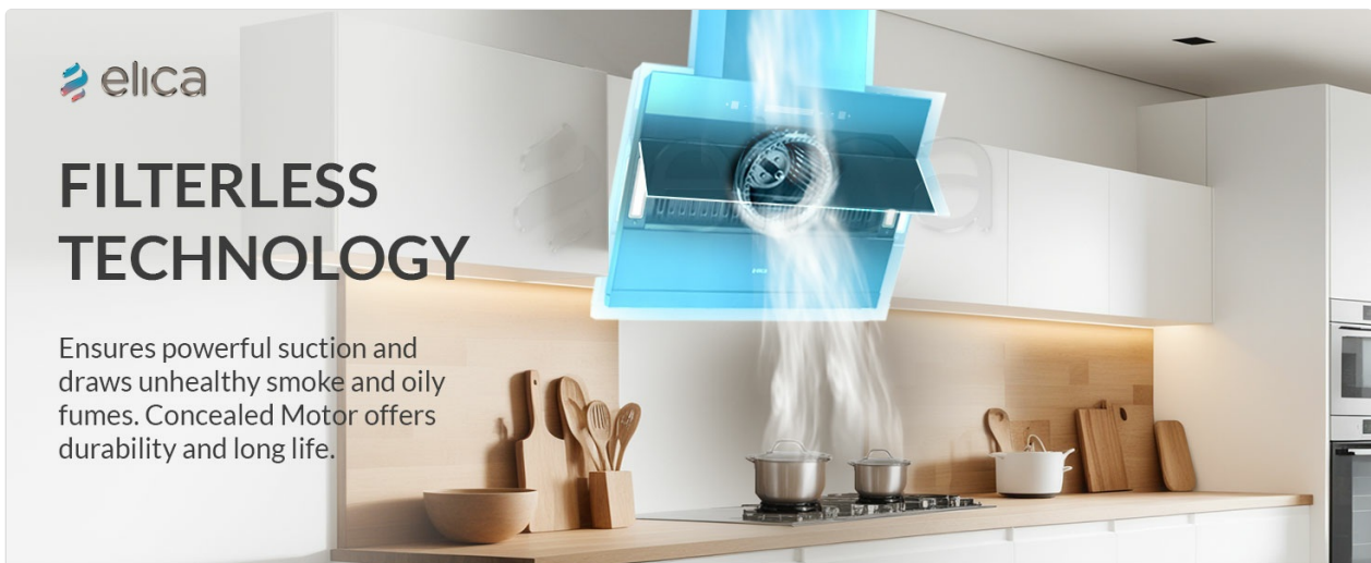
Image 4.5: Visual representation of the filterless technology and smoke extraction.

The filterless design, combined with a sealed motor, prevents oil residues and water vapors from interfering with the chimney's operation, ensuring consistent performance and reducing the need for frequent filter cleaning.