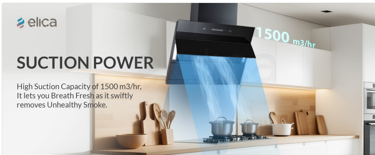
Image 4.6: Illustration of the chimney's powerful suction removing smoke.