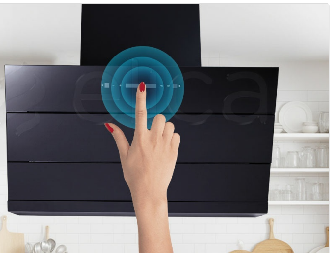
Image 4.1: Illustration of the touch control panel for power, fan speed, and lights.

Control the power, fan speed and lights with the touch of a button. Choose from high, medium and low suction.