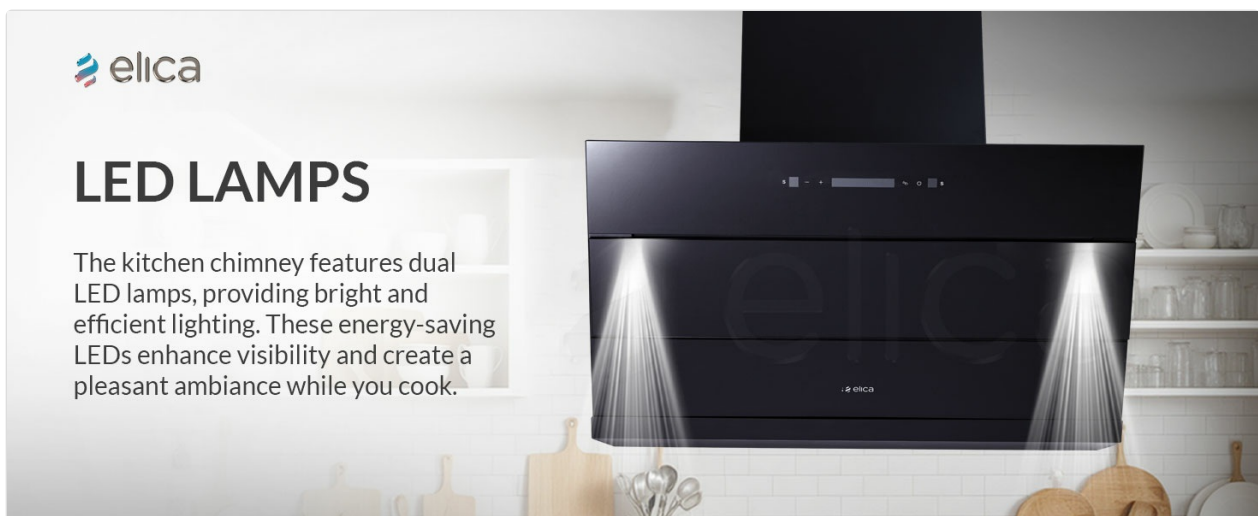
Image 4.3: View of the integrated LED lamps providing illumination.

The chimney is equipped with dual LED lamps to illuminate your cooking area. Activate or deactivate the lights using the dedicated button on the touch control panel.